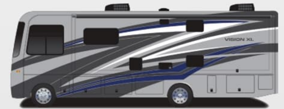
King Full-Body Paint