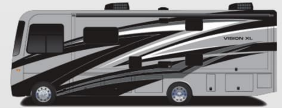
Logan Full-Body Paint