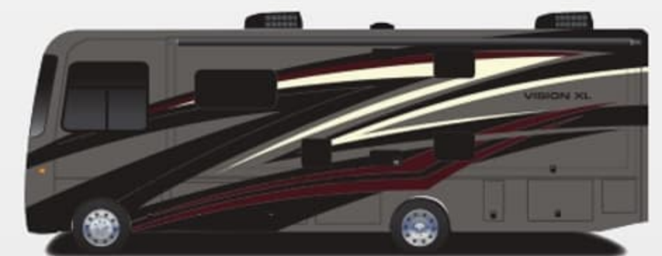
Foraker Full-Body Paint