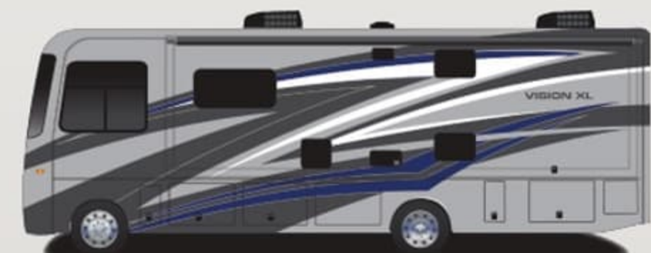
King Full-Body Paint