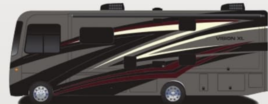
Foraker Full-Body Paint