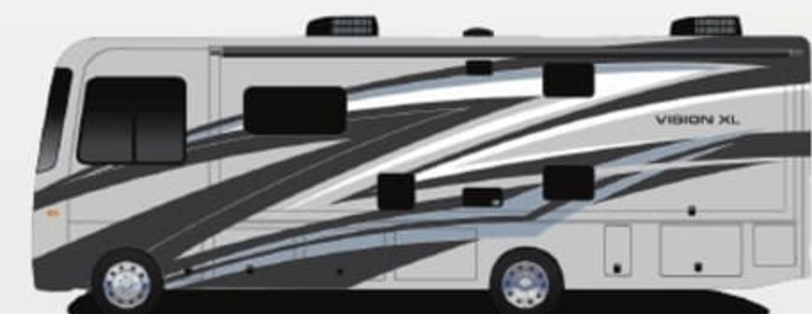
Elias Full-Body Paint