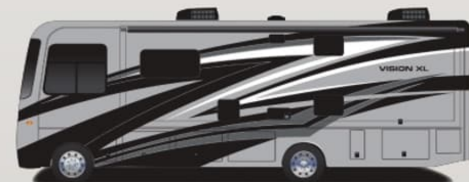
Logan Full-Body Paint