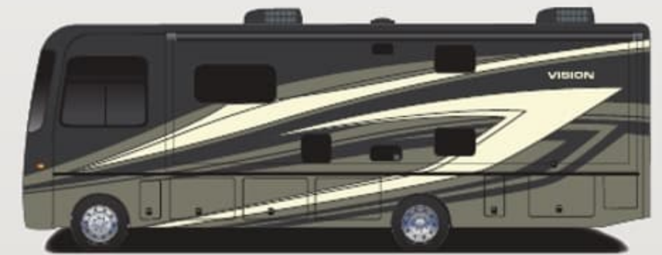
Dolomite Full-Body Paint