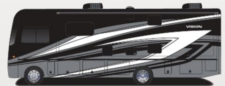
Tannerite Full-Body Paint