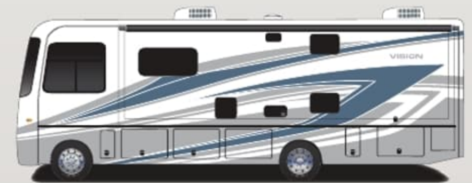
Basanite Full-Body Paint