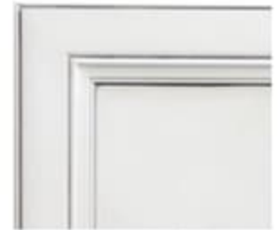
WINTER FOG (PAINTED W/GLAZED ACCENTS CABINETRY)

1 SOFA 2 LIVING ACCENT 3 BEDDING 4 COUNTERTOP 5 FLOORING 6 BACKSPLASH 7 VALANCE