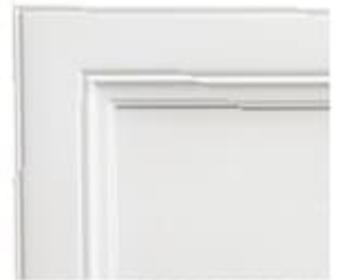
HERITAGE (PAINTED CABINETRY)