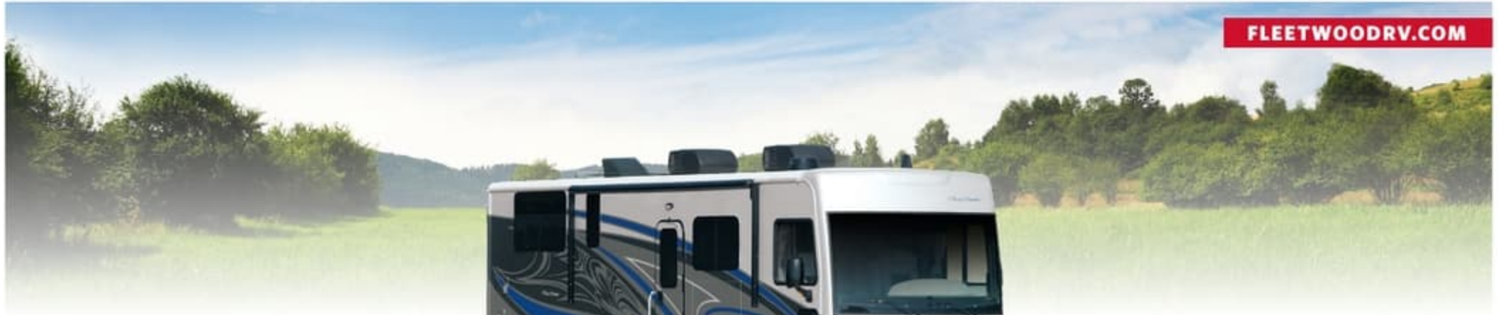
PACE ARROW Shown in Covelite Graphics