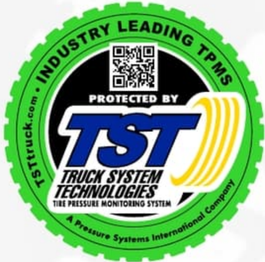
TIRE PRESSURE MONITORING SYSTEM