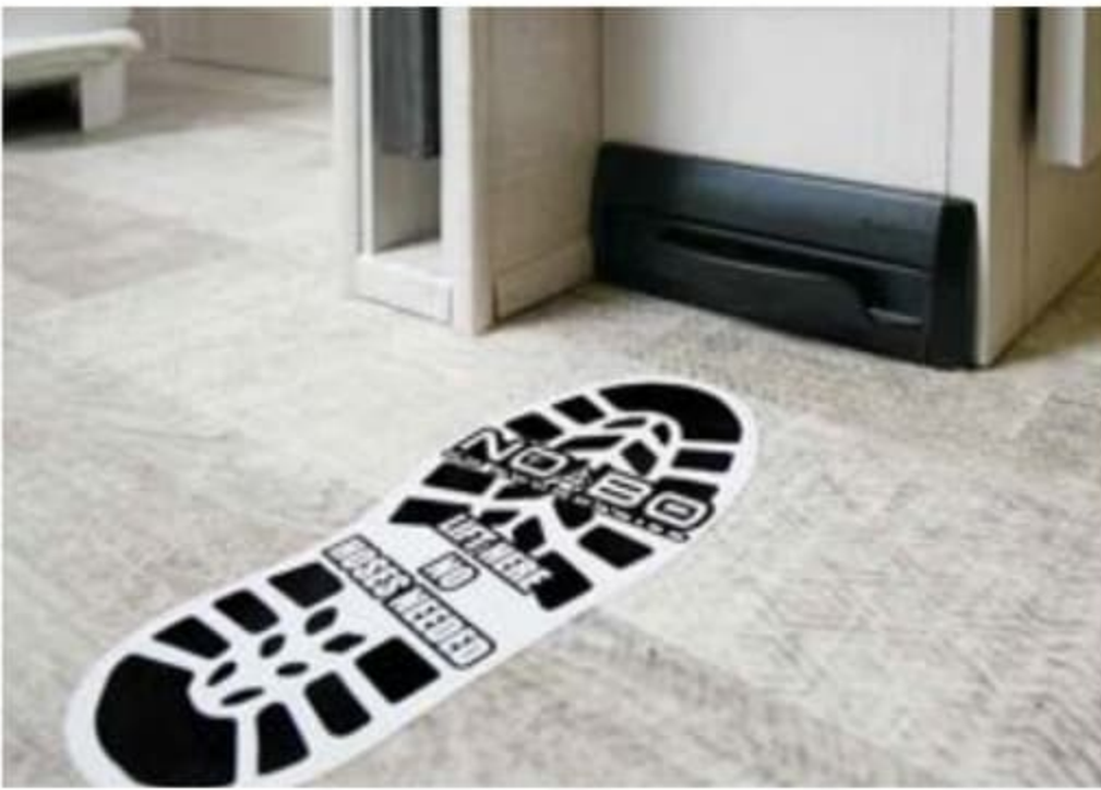
THE CENTRAL VACUUM SYSTEM MAKES CLEANUP EASY