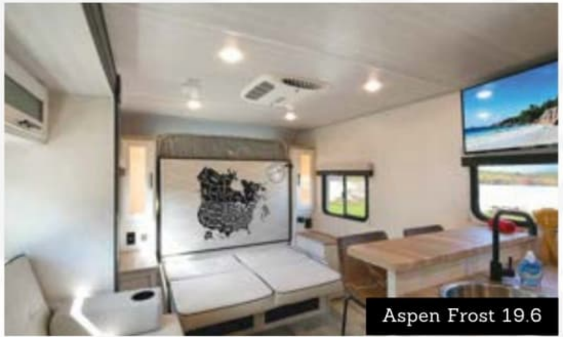
Aspen Frost 19.6