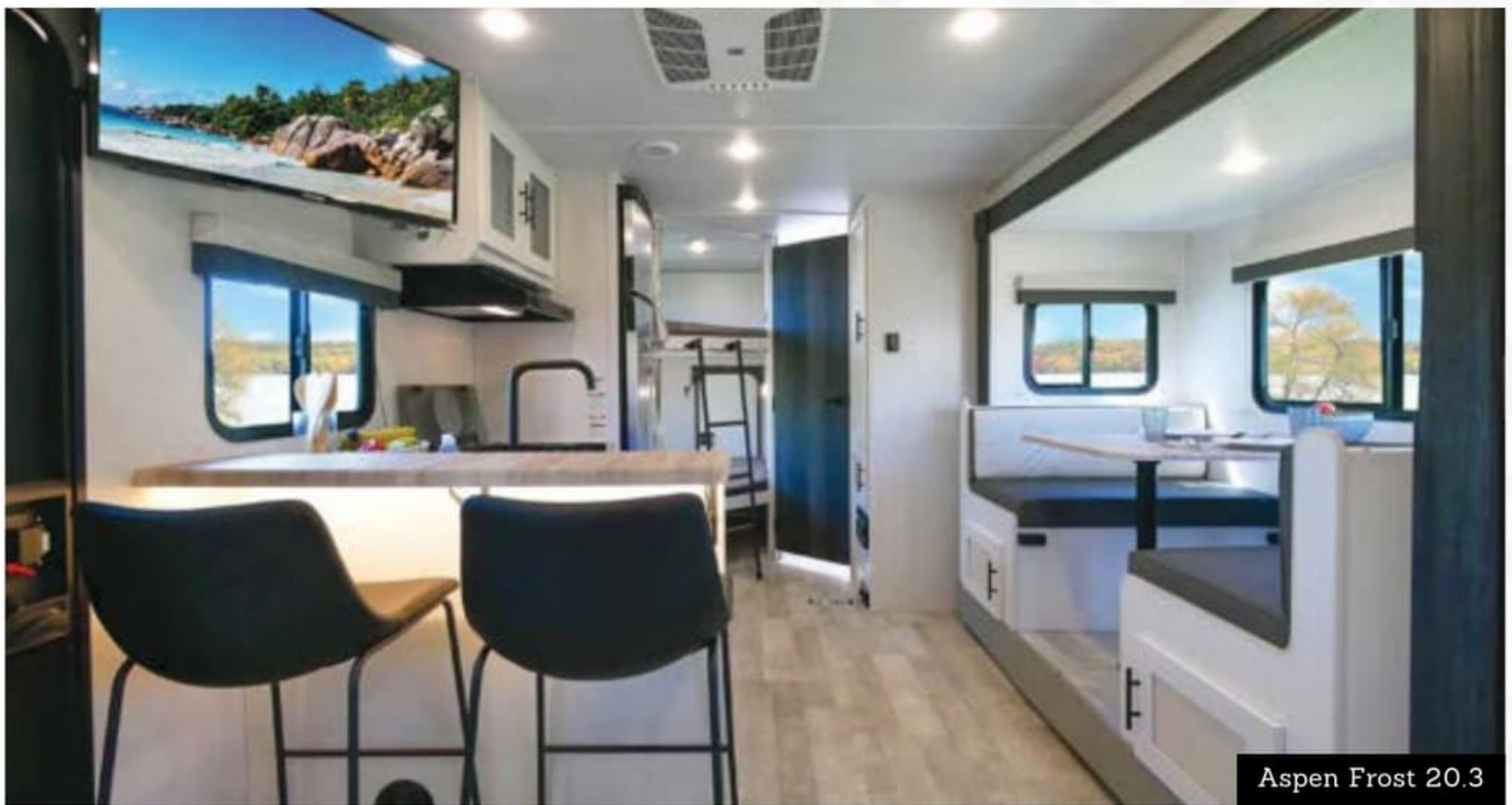
Aspen Frost 20.3