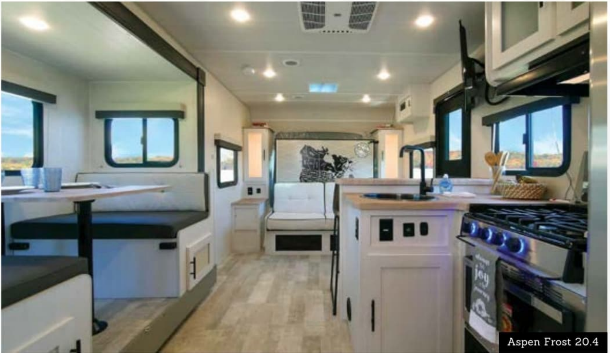
Aspen Frost 20.4