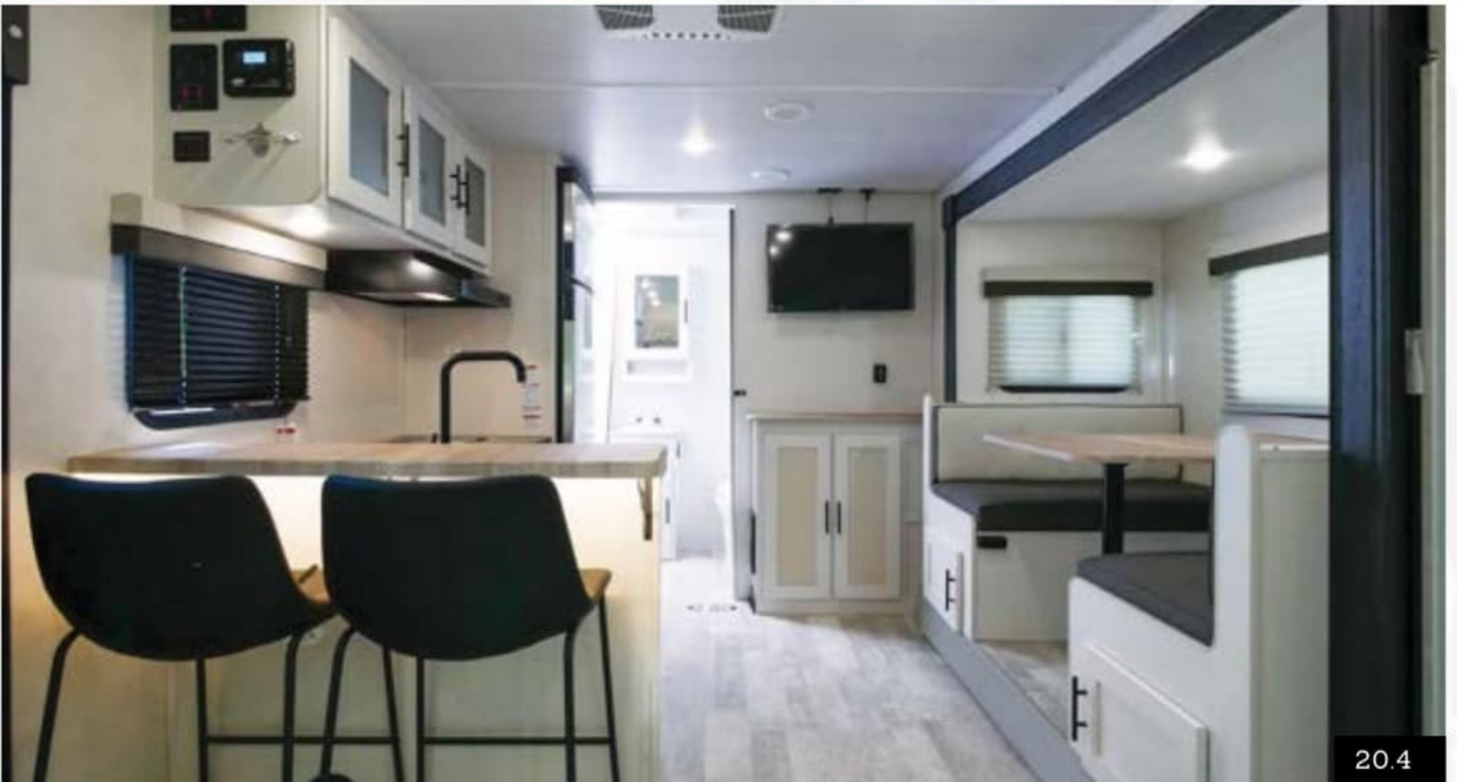
ALL-NEW ASPEN FROST INTERIOR DESIGN FEATURING PREMIUM FLOORING, ACCENT LIGHTING, AND CABINETRY