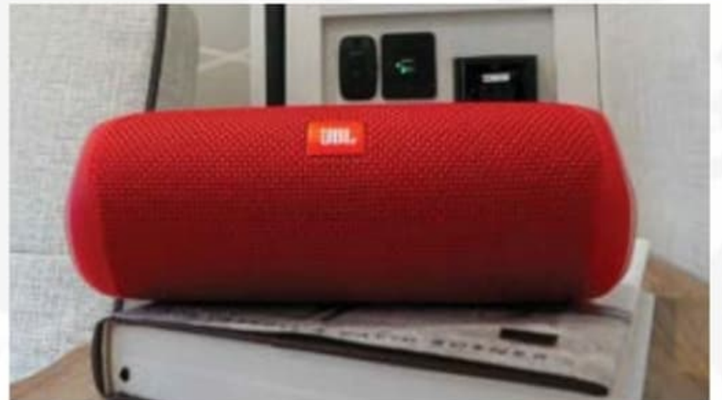
JBL PORTABLE BLUETOOTH SPEAKER FOR MUSIC ON THE GO!