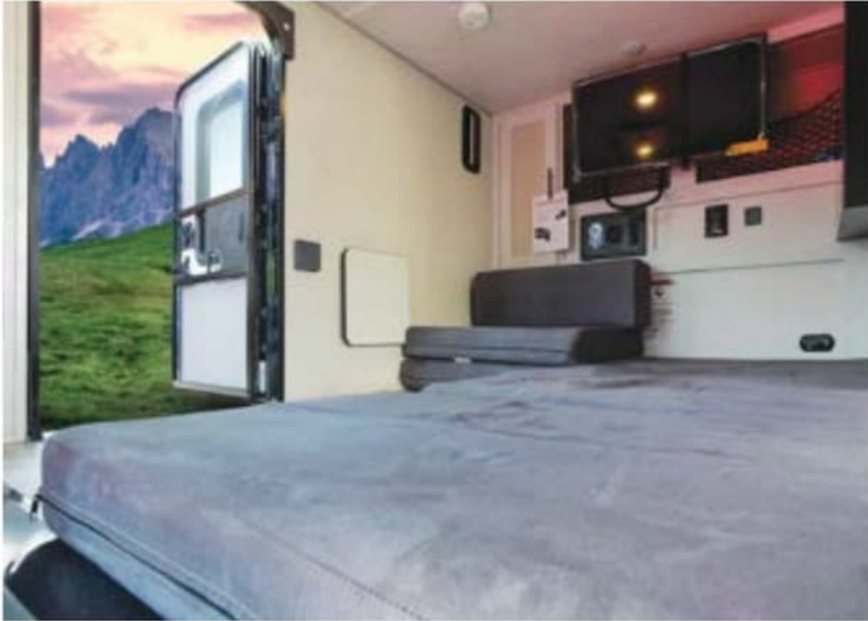
NO BOUNDARIES 10.6 FULL WARDROBE WITH STORAGE, DINETTE, OPTIONAL 12V TV AND 60" x 82" LOUNGER.