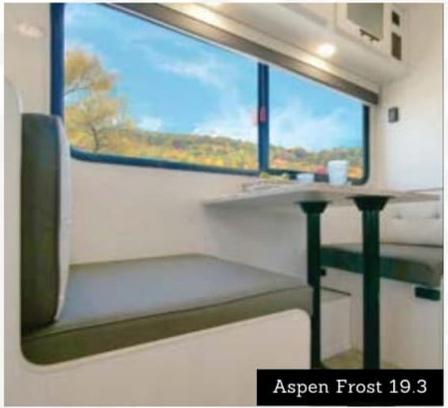
Aspen Frost 19.3