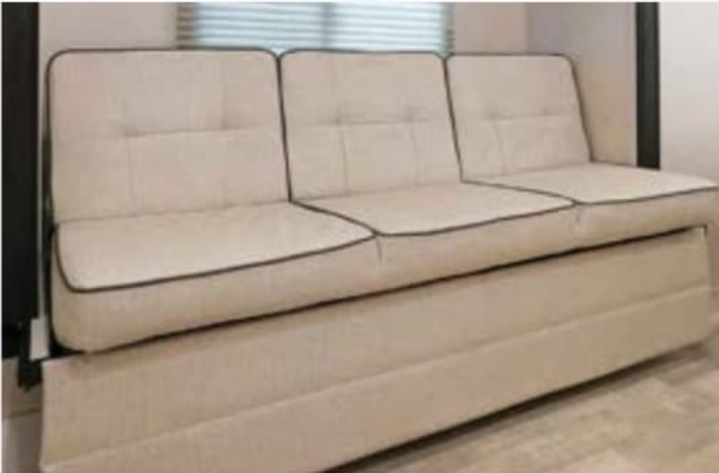
HIGH PERFORMANCE FURNITURE W/PREMIUM UPHOLSTERY