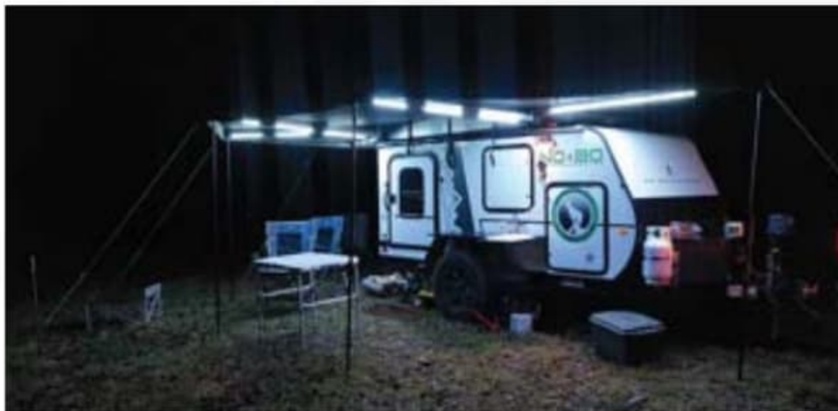
"Our NoBo at the Ozark National Forest on New Years Eve! No better way to start the new year than camping in our NoBo."