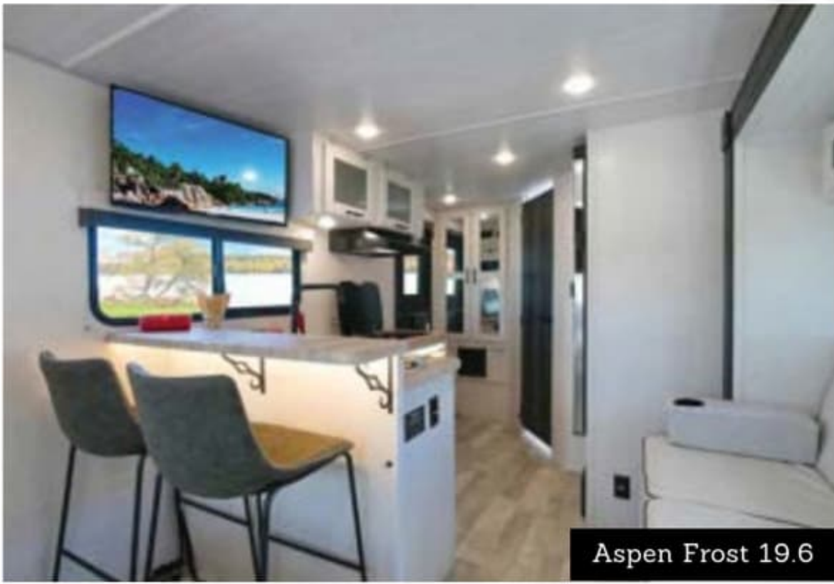
Aspen Frost 19.6