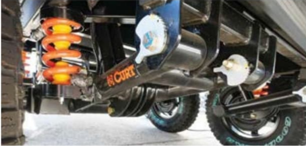
CURT BEAST MODE INDEPENDENT SUSPENSION SYSTEM WITH GOODYEAR ALL-TERRAIN TIRES