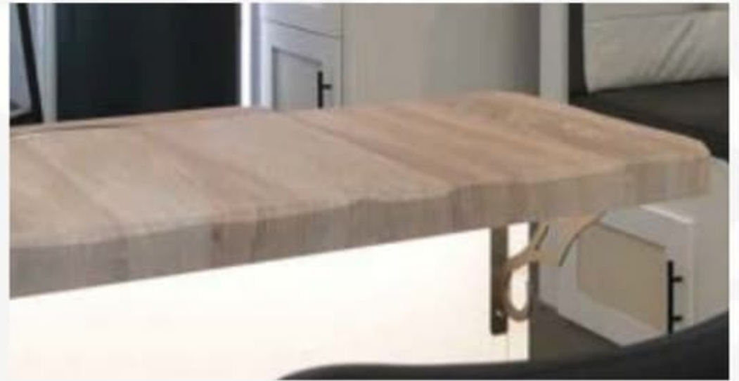
LIVE EDGE ACCENTS CREATE A HANDCRAFTED LOOK