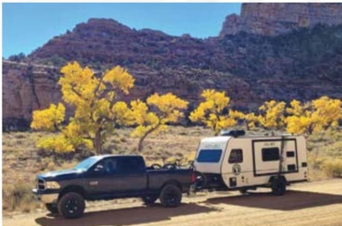
"Love this trailer. Everything you could want out of 16ft! Perfect setup for boondocking. Always getting asked questions anywhere we go."