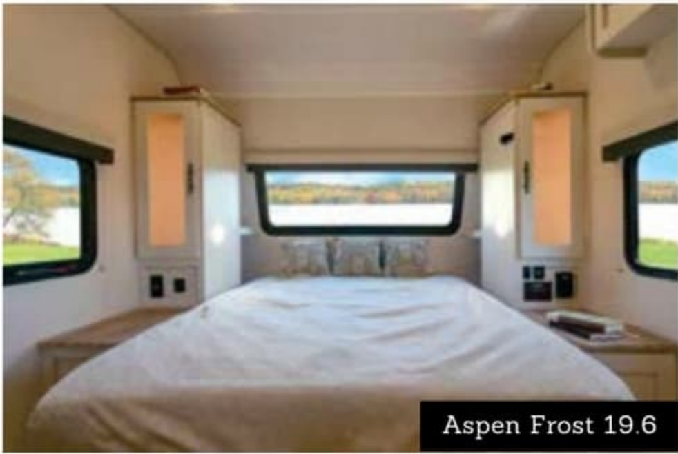
Aspen Frost 19.6