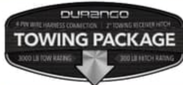
The Durango TOWING PACKAGE features a 3,000 LB tow rating, 300 LB hitch rating, 4-pin wire harness connection and 2" towing receiver hitch.