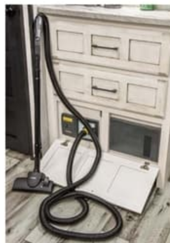
CENTRAL VACUUM with multiple attachments, stores out of sight.