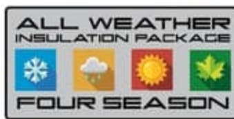
Heated, insulated & enclosed underbelly plus foil in floor, roof, front, rear! R-13* sidewalls, R-38* roof and floor. *Calculated R-Value