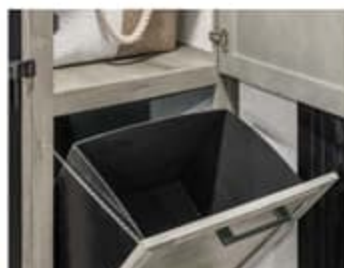
Bedroom cabinetry with BUILT-IN HAMPER