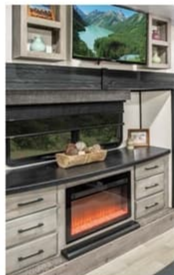
BUILT-IN DRESSER offers plenty of storage, and top lifts up and offers HIDDEN STORAGE for valuables. (select models)