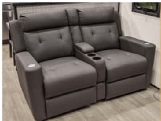
THEATER SEATING with cupholders, USB plug, heat, massage, and power recline/decline.

OPTIONAL "OFF THE GRID" SOLAR PACKAGE includes (2) 220W solar panels, 30A MPPT solar charge controller w/ MPPT remote panel, 2,000W True Sine Wave Inverter w/all outlets "hot".