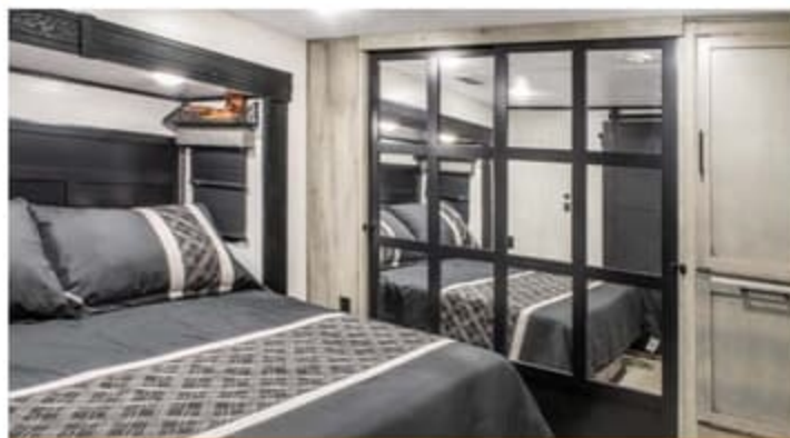
Enjoy a good night's sleep with an ELECTRIC TILT BED WITH SERTA COMFORT FOAM KING MATTRESS with under-bed storage.