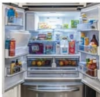
OPTIONAL 23 CU FT RESIDENTIAL REFRIGERATOR with temperature controls and easy slide out freezer drawer below.