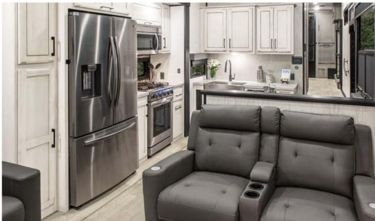
G360REQ | Barista décor