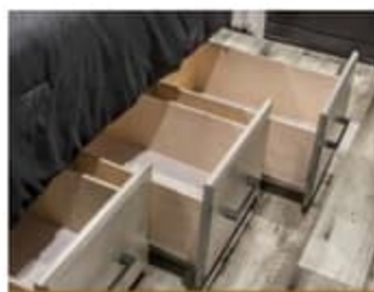
Three deep BEDROOM DRAWERS under the bed, for added storage.