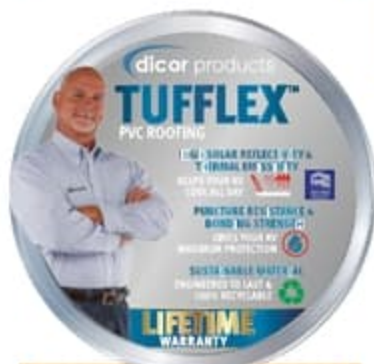
TUFFLEX PVC ROOFING with lifetime warranty and 3/8" walkable roof.