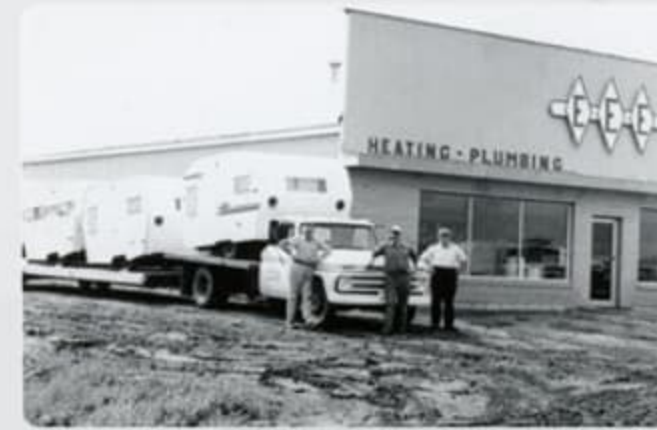
1965 The Beginning Triple E was incorporated on October 17, 1965.

Over 55 years later our vision remains committed to being a premier company. We're inspired by the freedom to explore and driven by a commitment to growing our community of employees, customers, dealers, suppliers, and our local community. May you experience the joy of companionship, surprise and adventure, as the road leads you on your journey ahead.