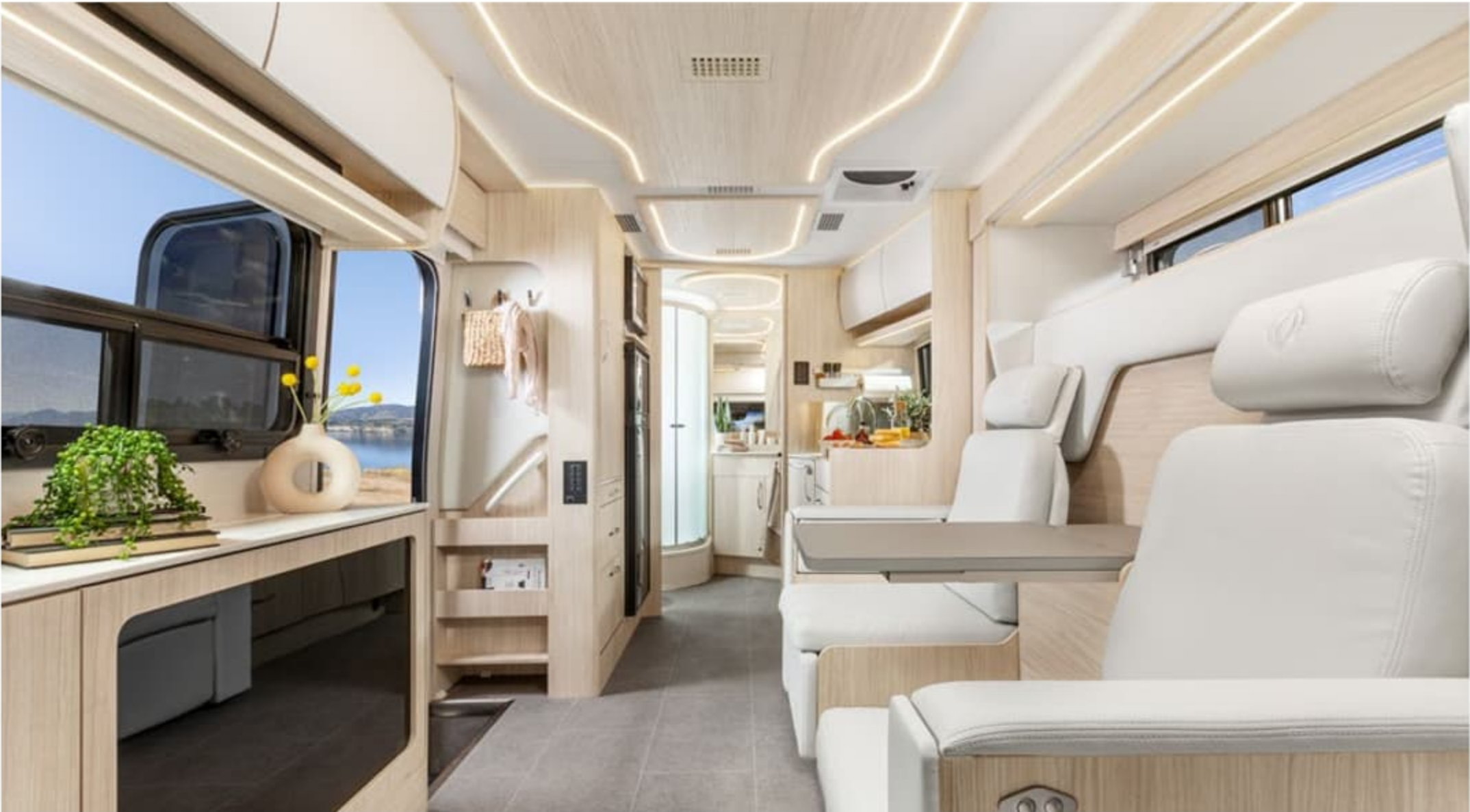
White Oak shown with Cabinetry Upgrade