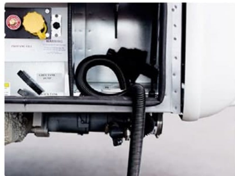
Macerator Sewage Discharge With Manual Disconnect