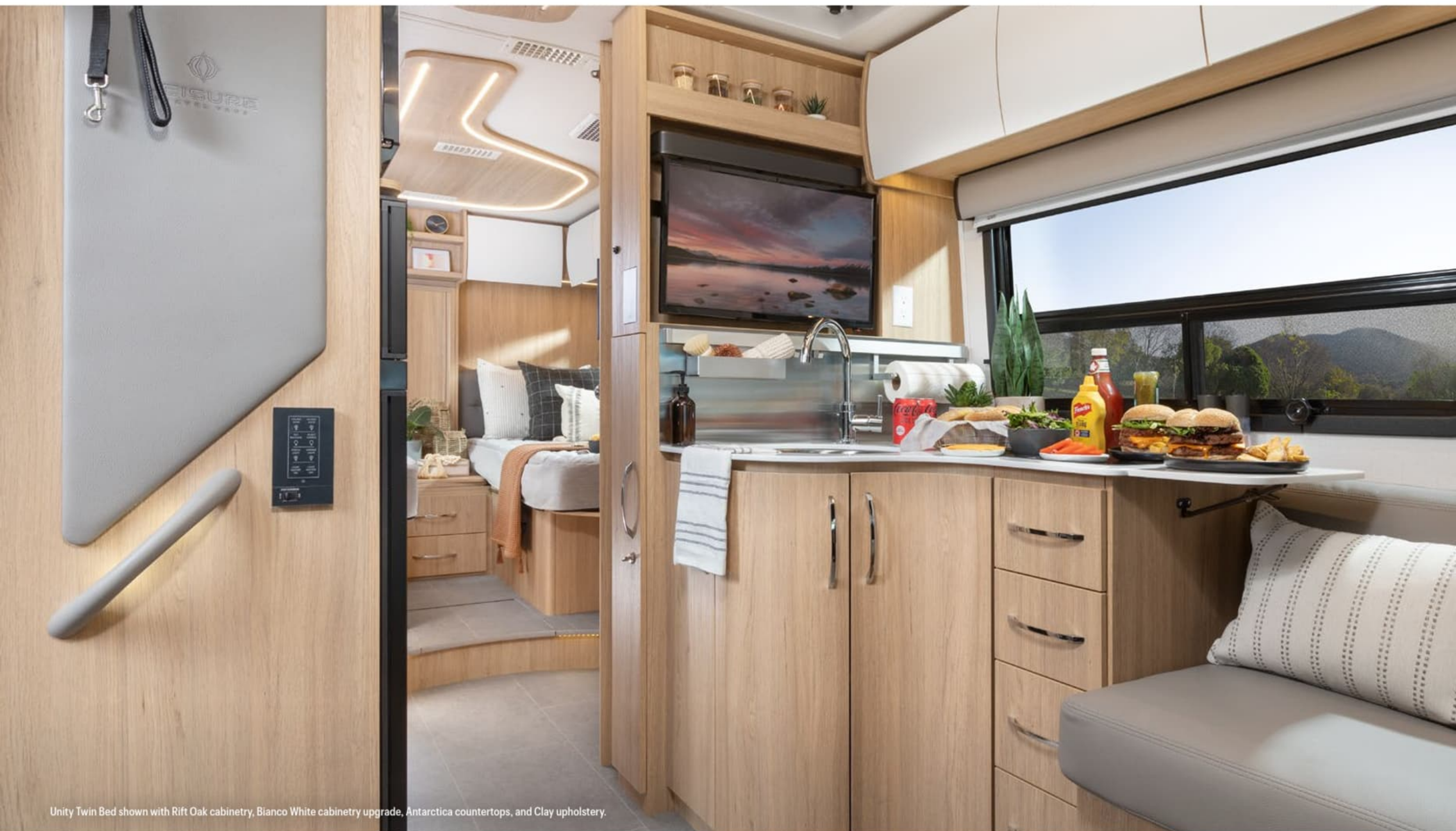
Unity Twin Bed shown with Rift Oak cabinetry, Bianco White cabinetry upgrade, Antarctica countertops, and Clay upholstery.