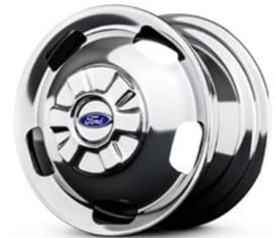
Aluminum Alloy Wheels Standard