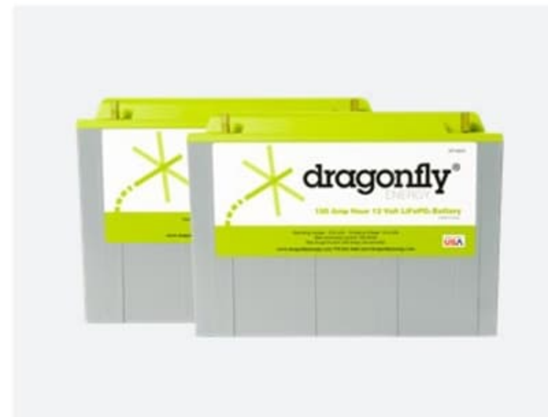
Dual 100 A-h, 12 V Lithium Coach Batteries With Built-in Heating Function