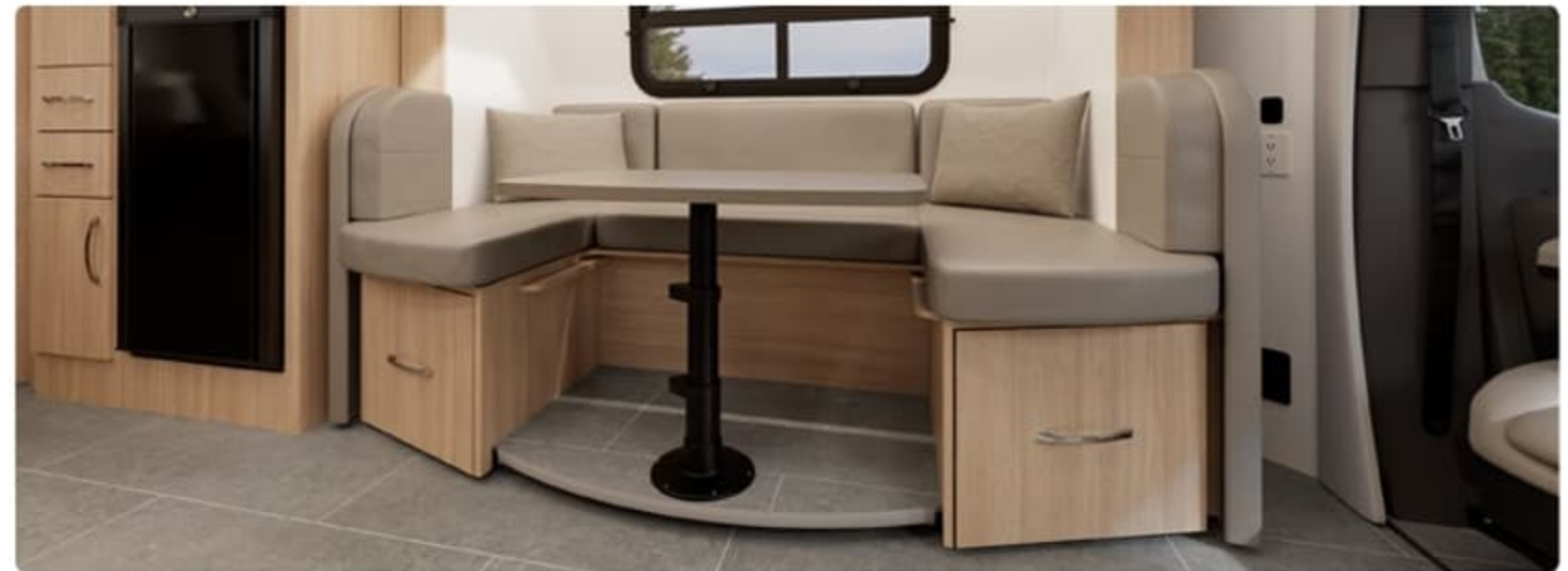
U-Lounge Dinette with Easy Lift Table Ultraleather® 40" x 69" Sleeping Area (Corner Bed)