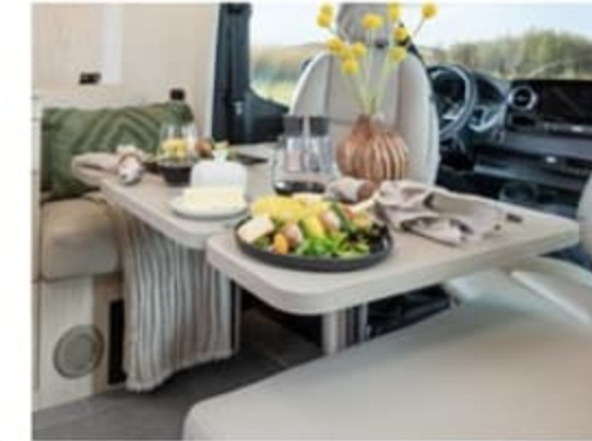
Table Mount System

The 2000 W Pure Sine Wave Inverter provides plenty of capacity for running your 120 V devices, as well as an inverted microwave plug. (Inverted microwave plug requires optional Lithium batteries)