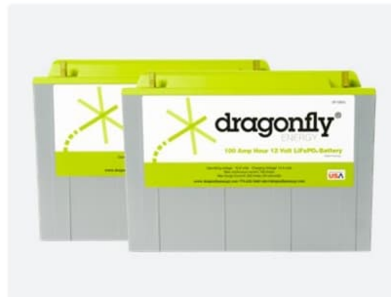
Dual 100 A-h, 12 V Lithium Coach Batteries With Built-in Heating Function