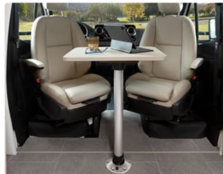
Removable Front Table between Captain Chairs (Murphy Bed, FX, Corner Bed)