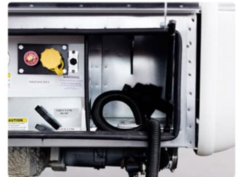
Macerator Sewage Discharge With Manual Disconnect