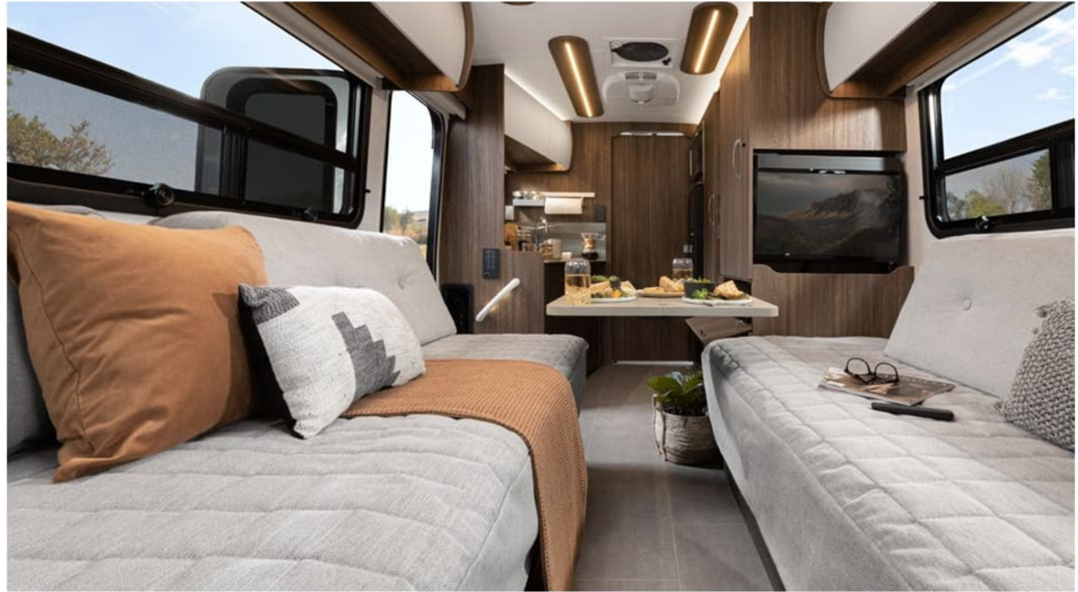
Mocha shown with Cabinetry Upgrade