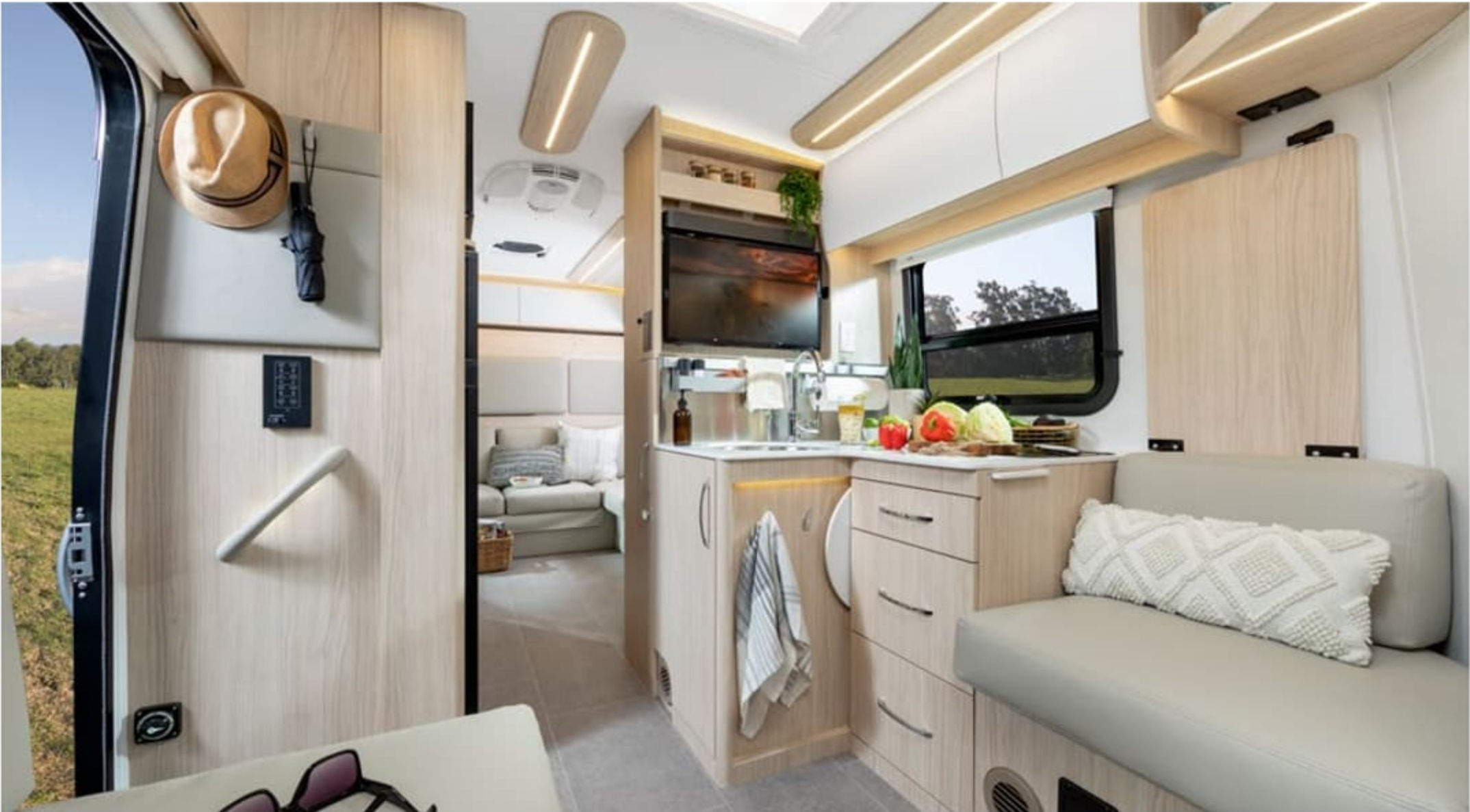
White Oak shown with Cabinetry Upgrade