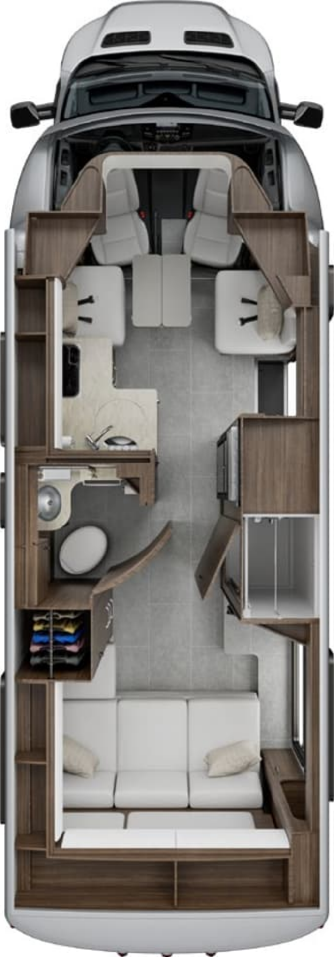
Rear Lounge | W24RL