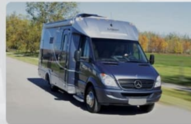
2009 An Industry First Triple E launched the Unity by Leisure Travel Vans – the industry's first Class C motorhome with a queen size Murphy bed built on a Mercedes-Benz chassis. The Unity quickly became recognized as one of Triple E's most innovative product introductions.