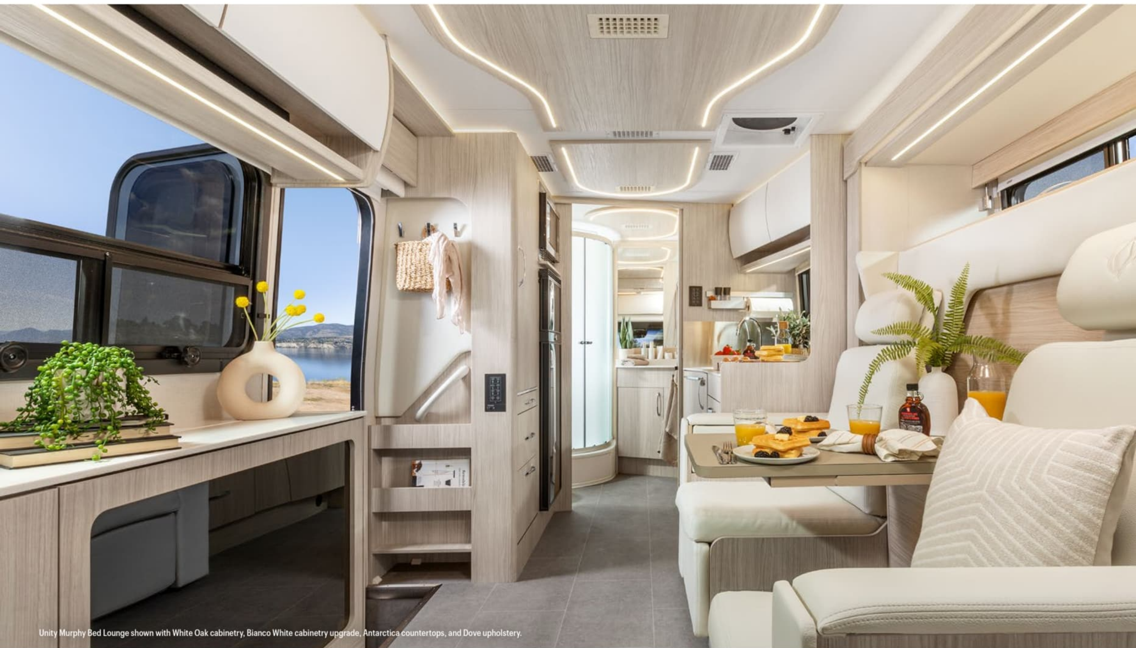
Unity Murphy Bed Lounge shown with White Oak cabinetry, Bianco White cabinetry upgrade, Antarctica countertops, and Dove upholstery.

Unity Murphy Bed Lounge | U24MBL PREVIEW