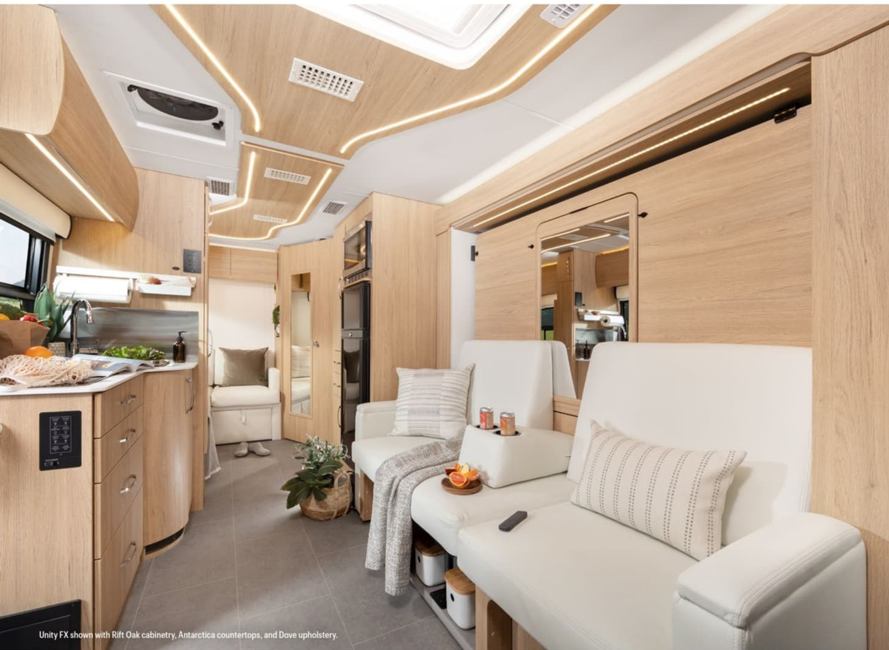
Unity FX shown with Rift Oak cabinetry, Antarctica countertops, and Dove upholstery.