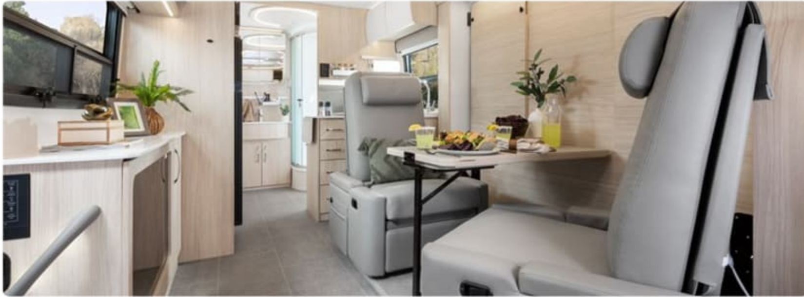
Leisure Lounge System Plus Dinette System 2 Ultraleather® Rotating Power Recliners (Murphy Bed)