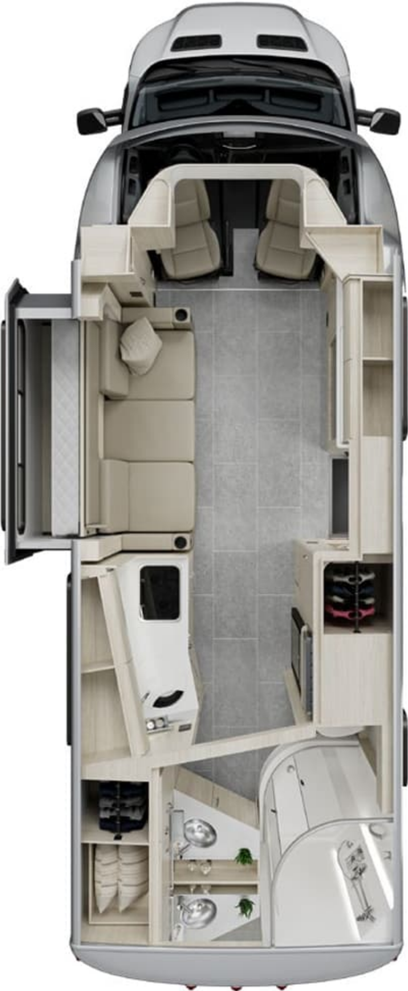
Murphy Bed Lounge | W24MBL