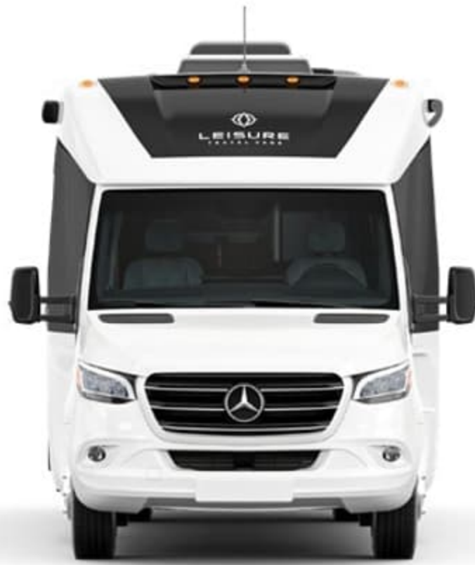
Width: 7' 11" (2,416 mm)