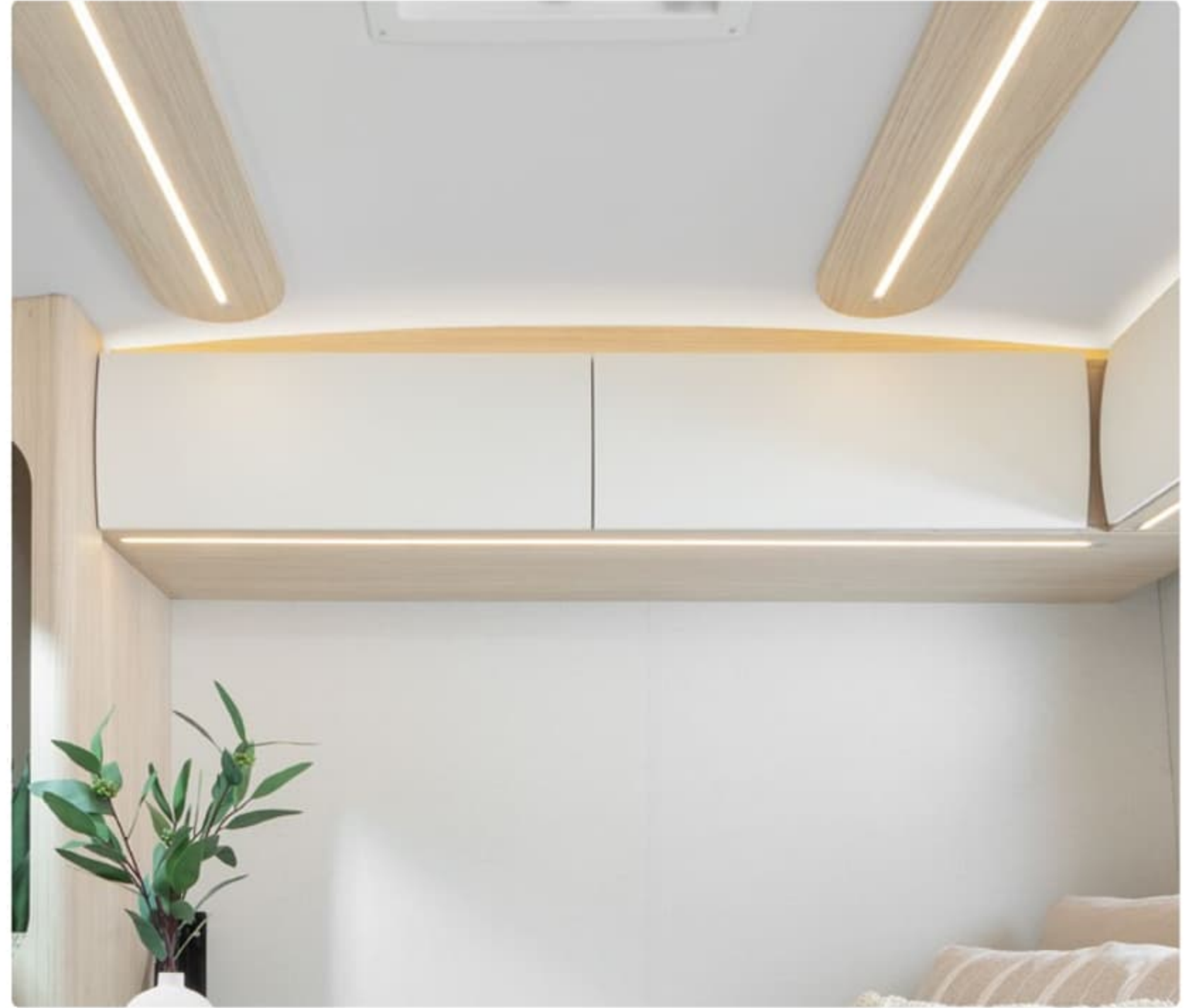
Cabinetry Upgrade FENIX NTM® Matte Overhead Cabinet Doors