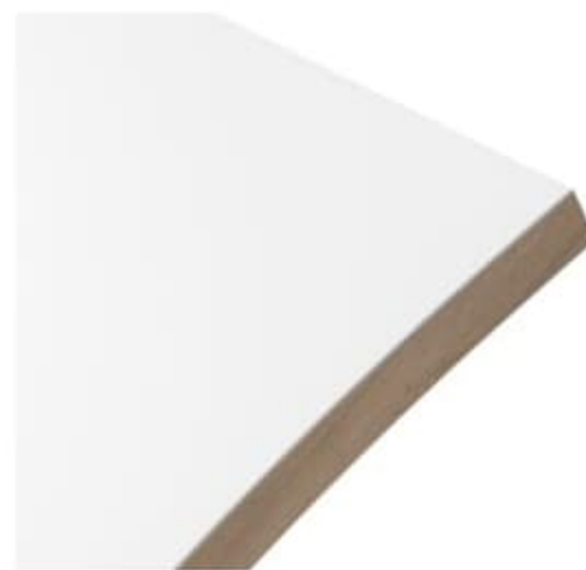
Bianco White FENIX NTM®