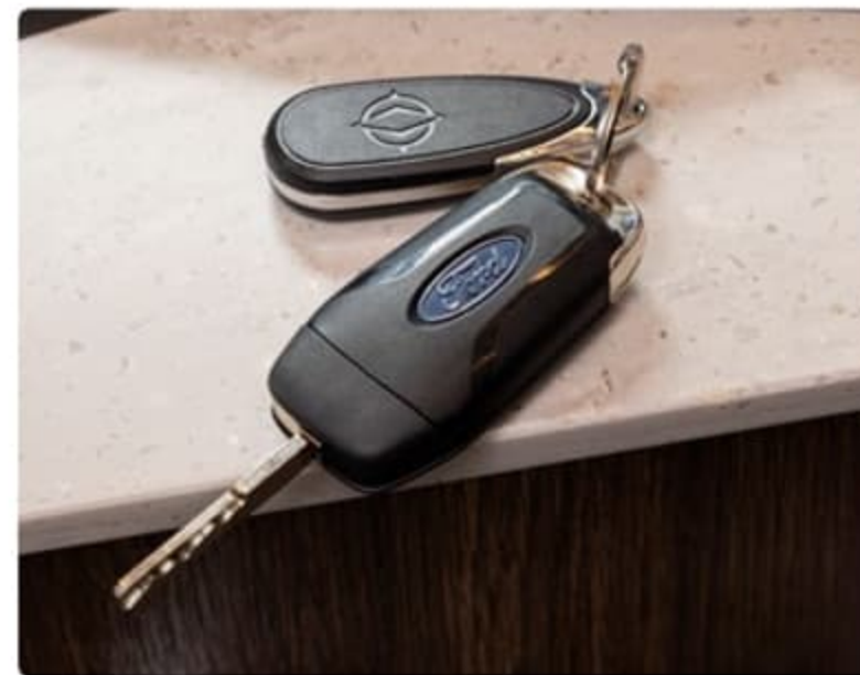
Keyless Entrance Door