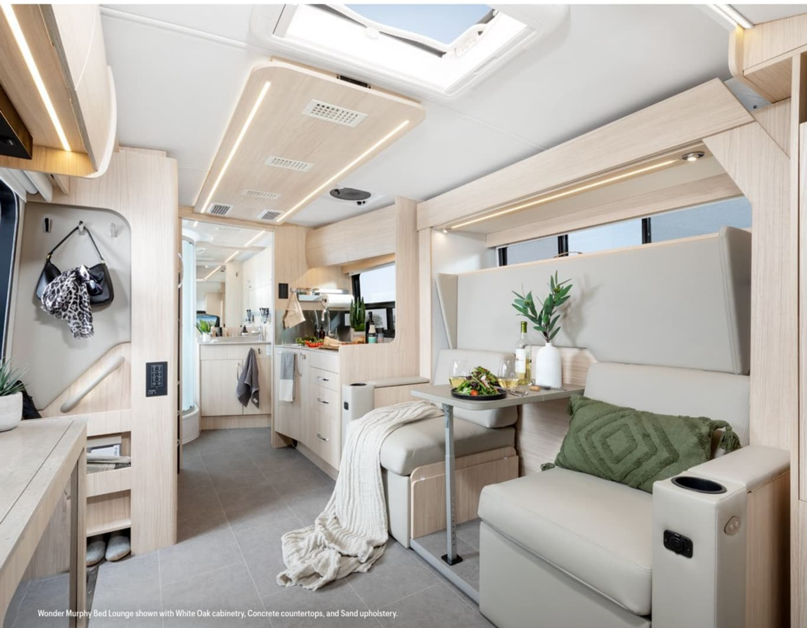
Wonder Murphy Bed Lounge shown with White Oak cabinetry, Concrete countertops, and Sand upholstery.