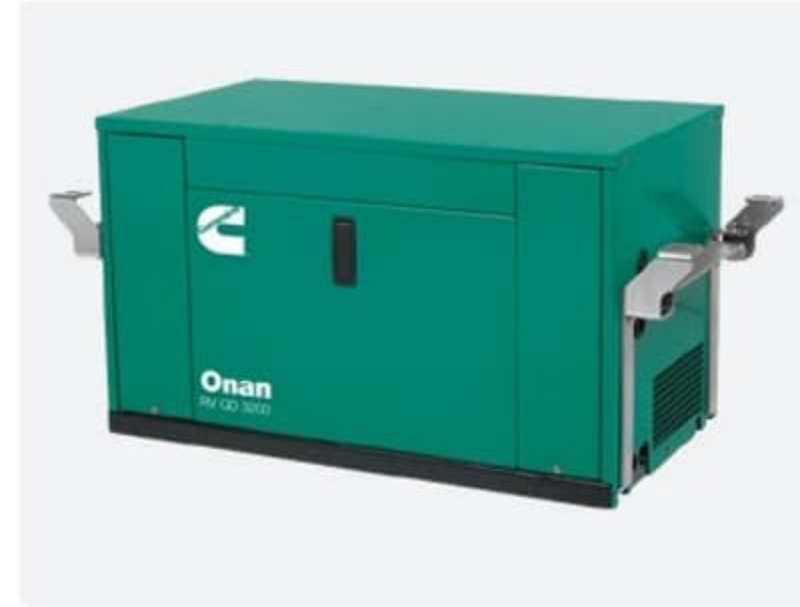
3.2 kW Diesel Generator With Auto Start and Auto Changeover Switch