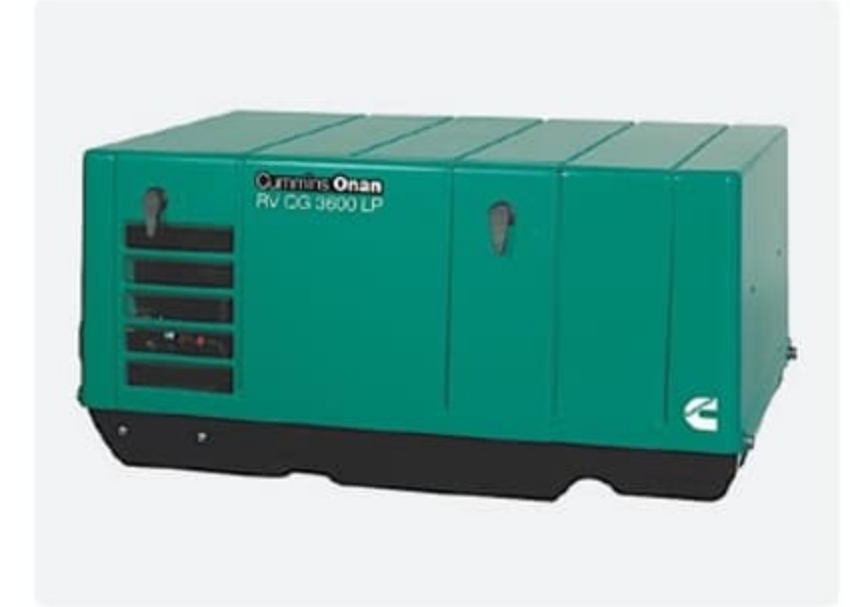
3.6 kW LP Generator With Auto Start and Auto Changeover Switch