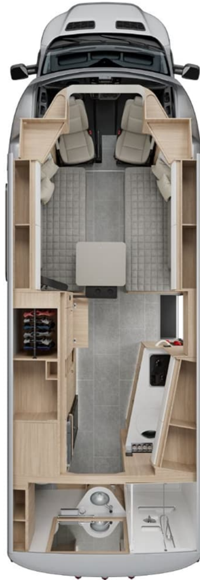
Front Twin Bed | W24FTB