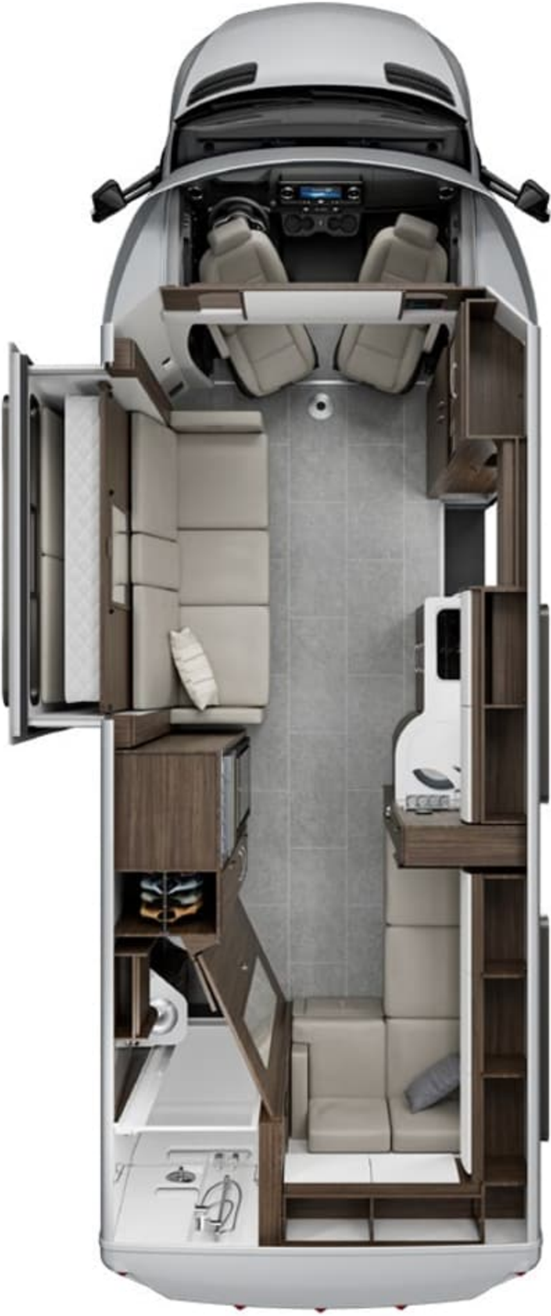
FX | U24FX