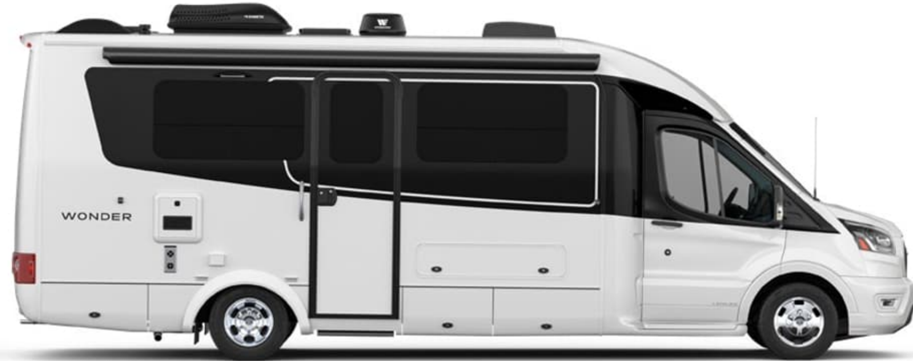
Wheelbase: 178" (4,522 mm)