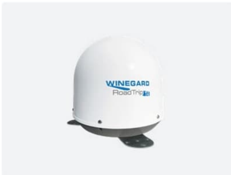
Auto-Acquisition Satellite Dish