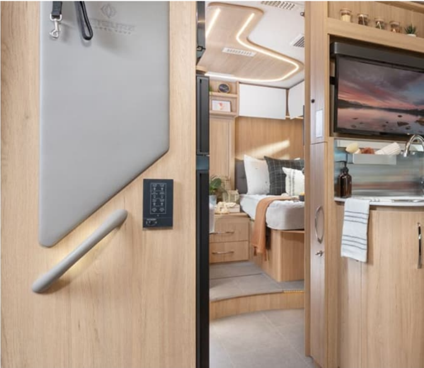
Rift Oak shown with Cabinetry Upgrade