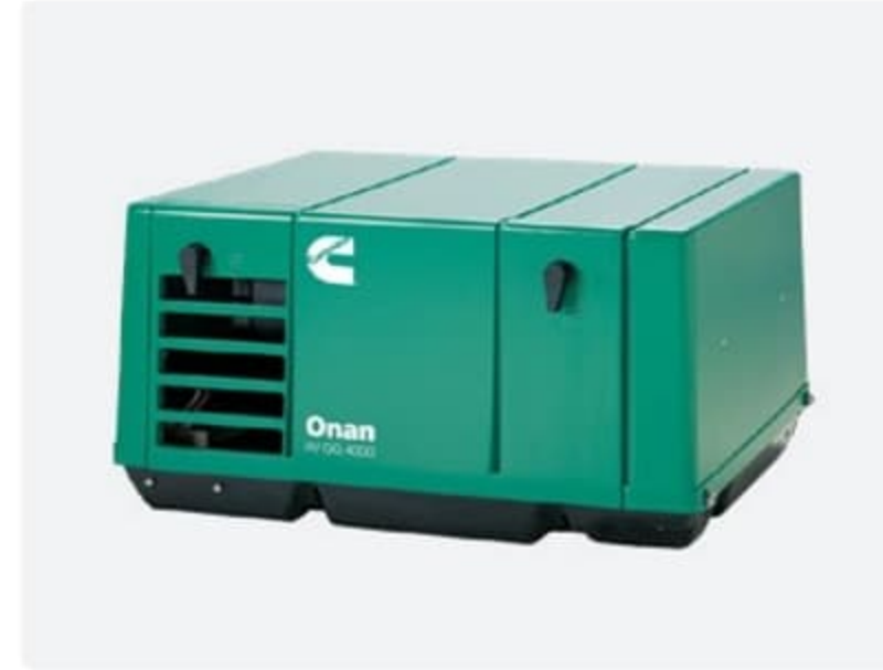
4.0 kW Gas Generator (Mandatory Option) With Auto Start and Auto Changeover Switch