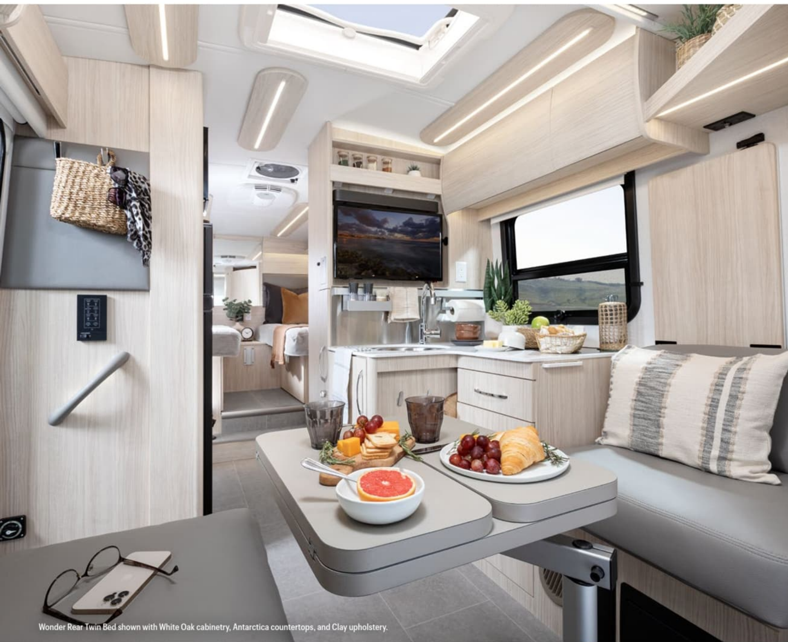
Wonder Rear Twin Bed shown with White Oak cabinetry, Antarctica countertops, and Clay upholstery.