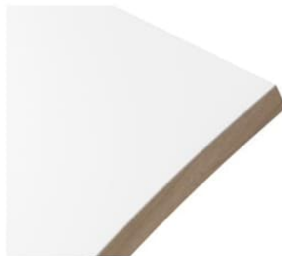
Bianco White FENIX NTM®