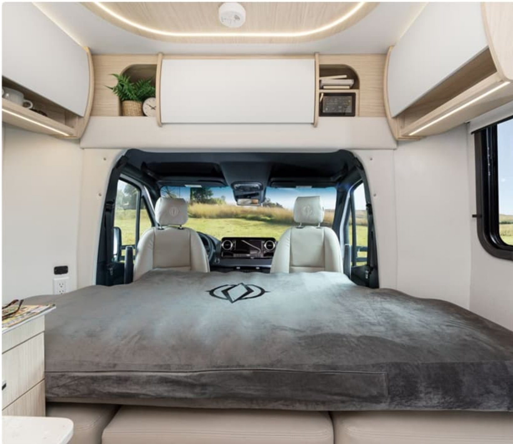
Inflatable Bed for Front Dinette 45" x 88" Sleeping Area (Rear Lounge, Twin Bed)