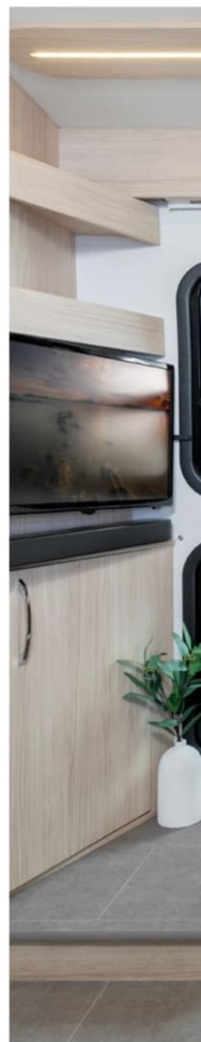
Wonder Rear Lounge shown with White Oak cabinetry, Bianco White cabinetry upgrade, Antarctica countertops, and Sand upholstery.