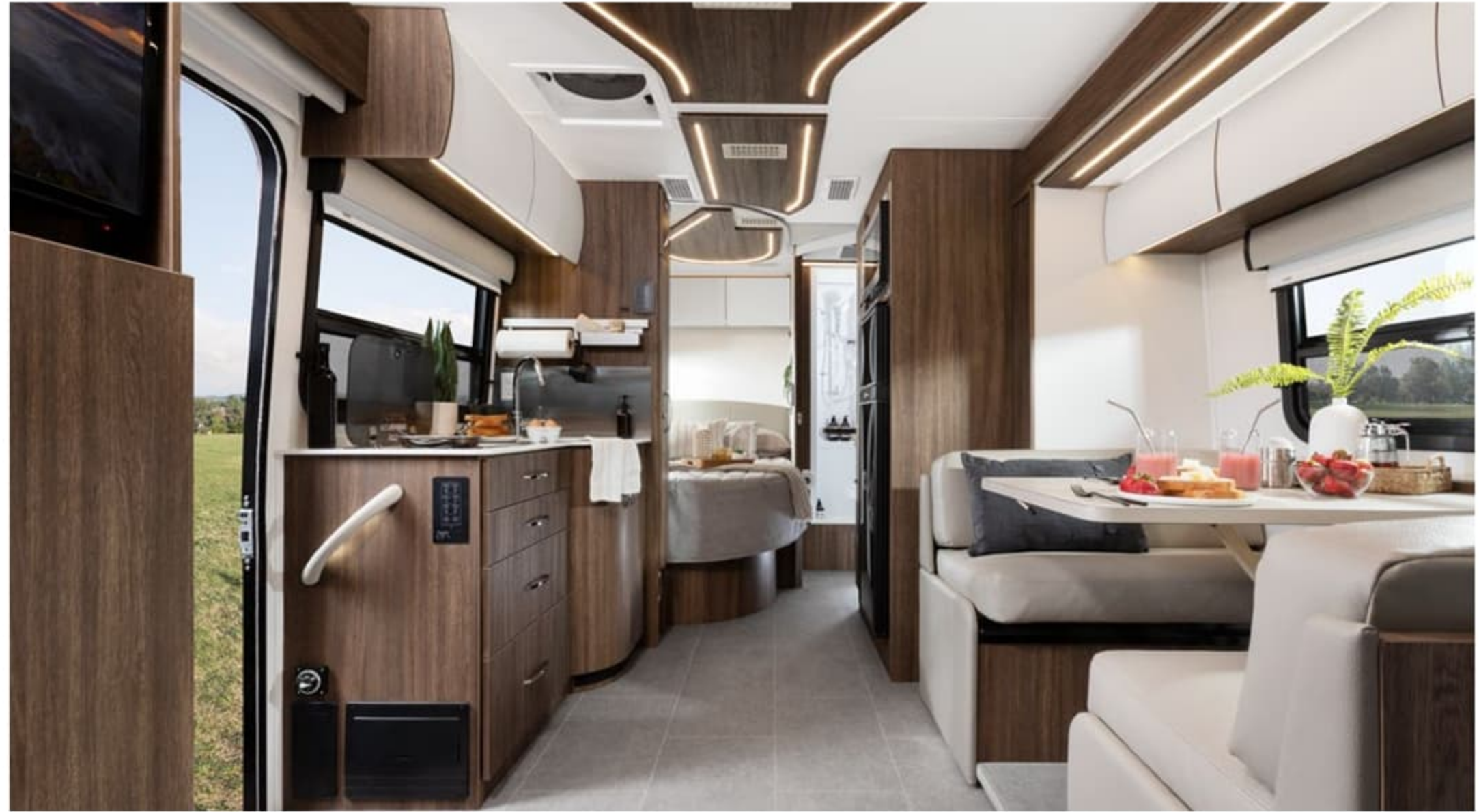
Mocha shown with Cabinetry Upgrade