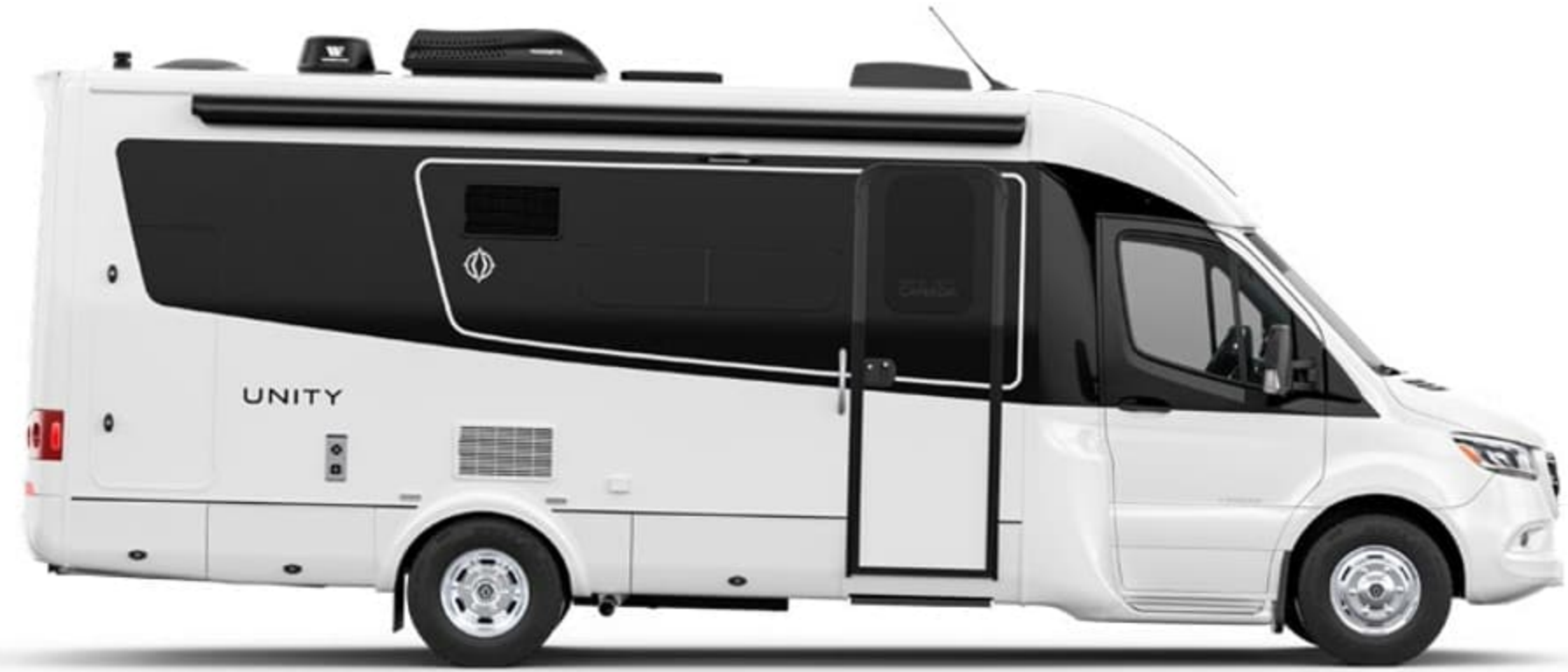
Wheelbase: 170" (4,326 mm)