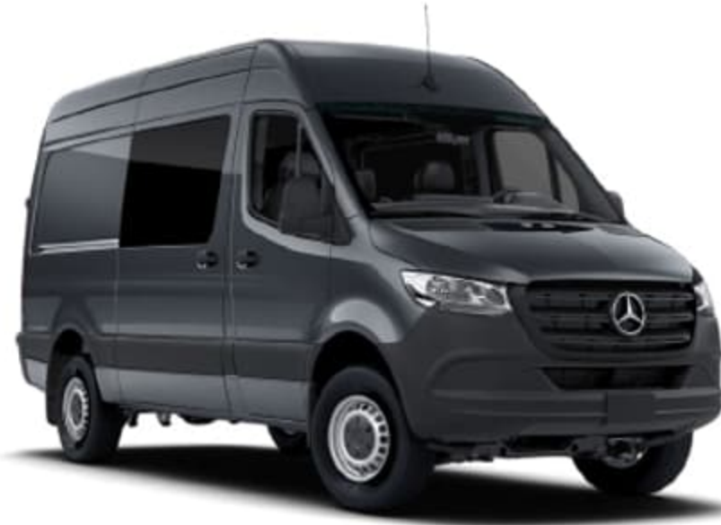
Tenorite Grey Metallic