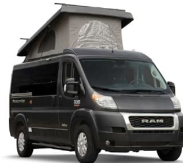
Granite Crystal Metallic