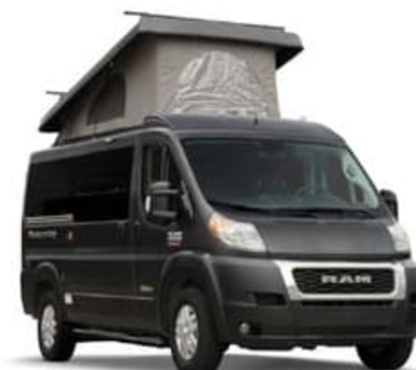
Granite Crystal Metallic