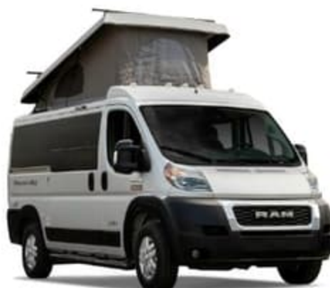
Bright Silver Metallic