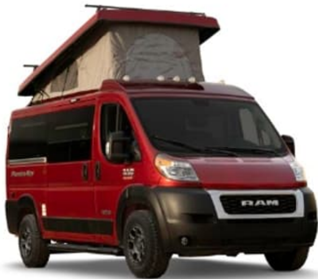
Deep Cherry Red Crystal Pearl