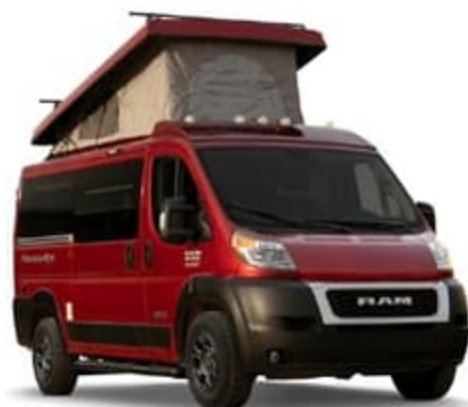
Deep Cherry Red Crystal Pearl