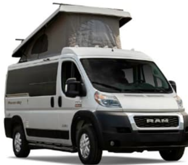
Bright Silver Metallic