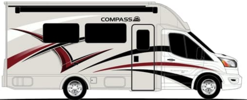
TRADE ROUTE QHD-MAX