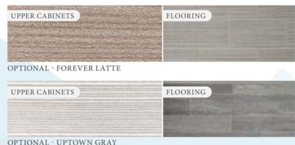
OPTIONAL - UPTOWN GRAY