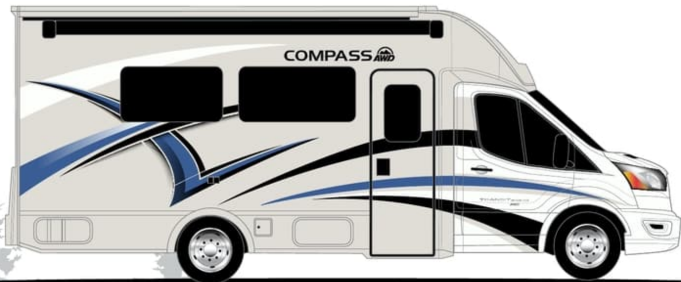
VOYAGE BLUE QHD-MAX