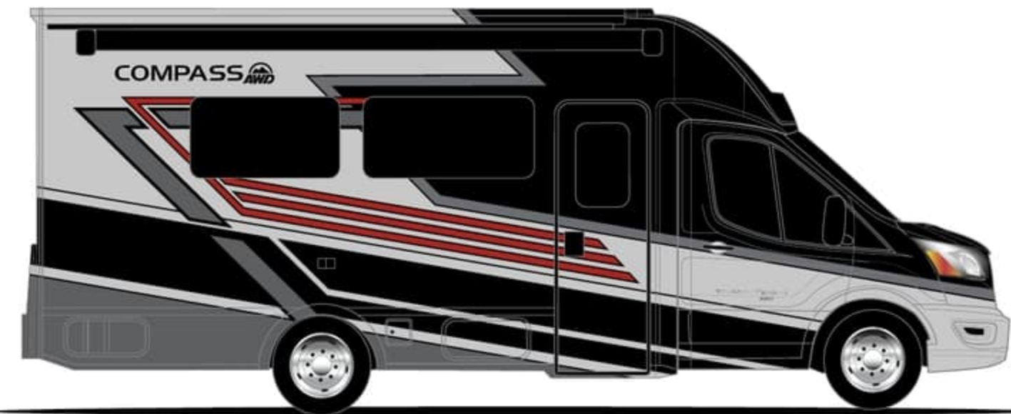
FIBRE OPTIC 4 FULL-BODY PAINT