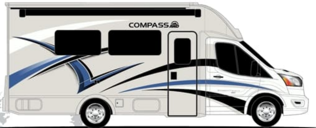
VOYAGE BLUE QHD-MAX