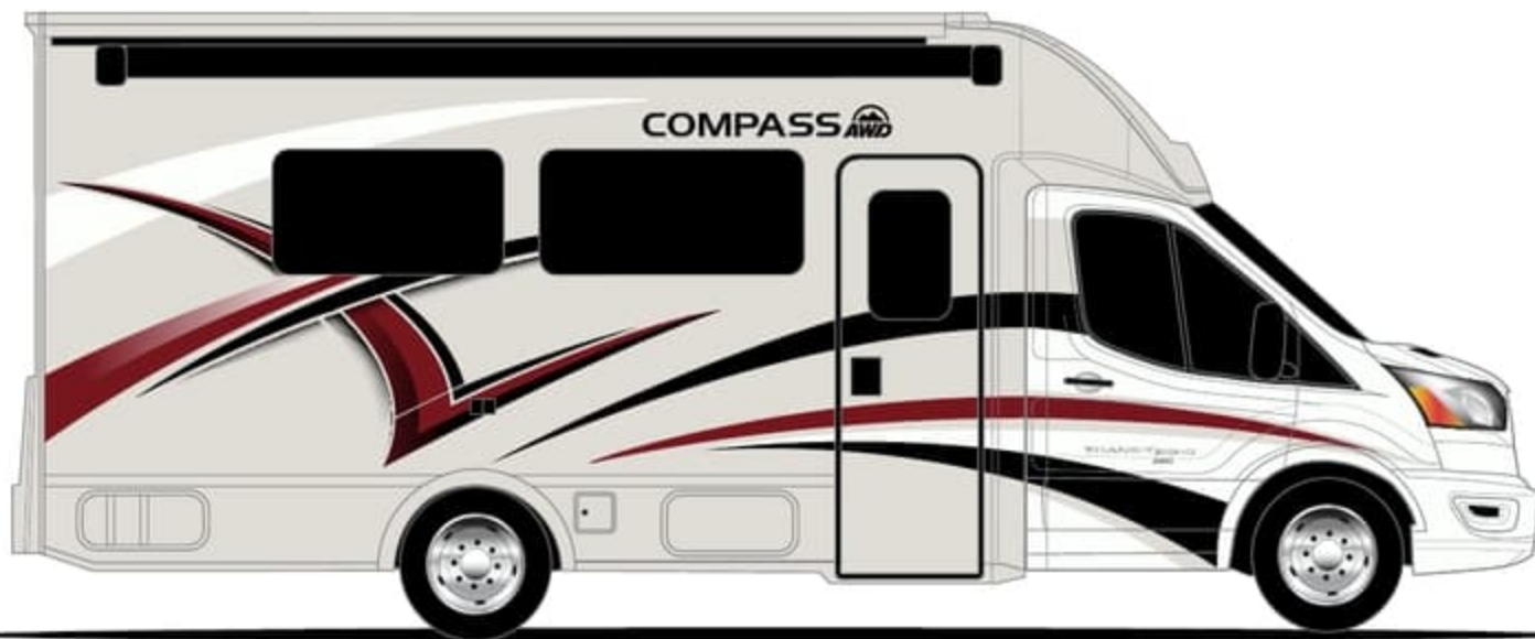
TRADE ROUTE QHD-MAX