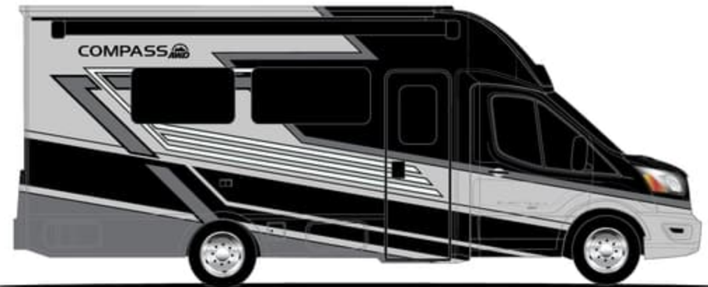
TRUE NORTH 4 FULL-BODY PAINT