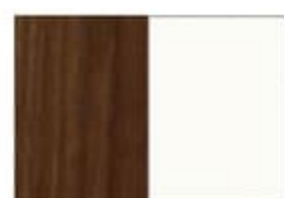
Walnut and White