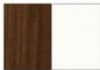
Walnut and White