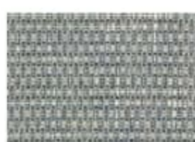
Bed Cover (K, KL)