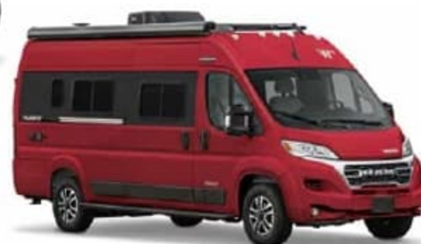
DEEP CHERRY DELUXE