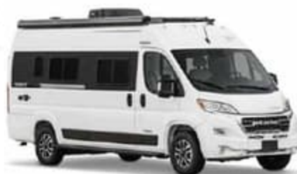
BRIGHT WHITE DELUXE