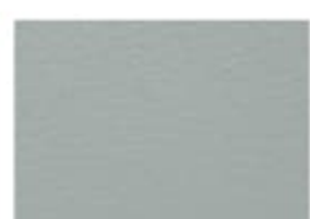
Ultrafabrics Accent (G, GL)