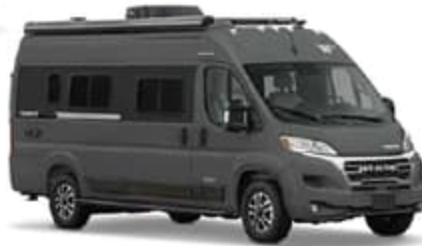
CERAMIC GRAY DELUXE