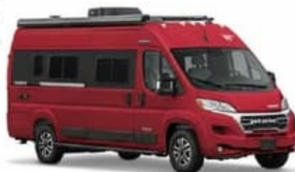
DEEP CHERRY DELUXE