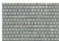
Bed Cover (K, KL)