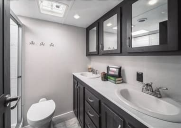
EXTRA LARGE SHOWER WITH SEAT