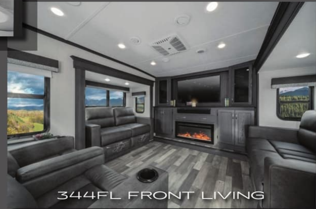
344FL FRONT LIVING