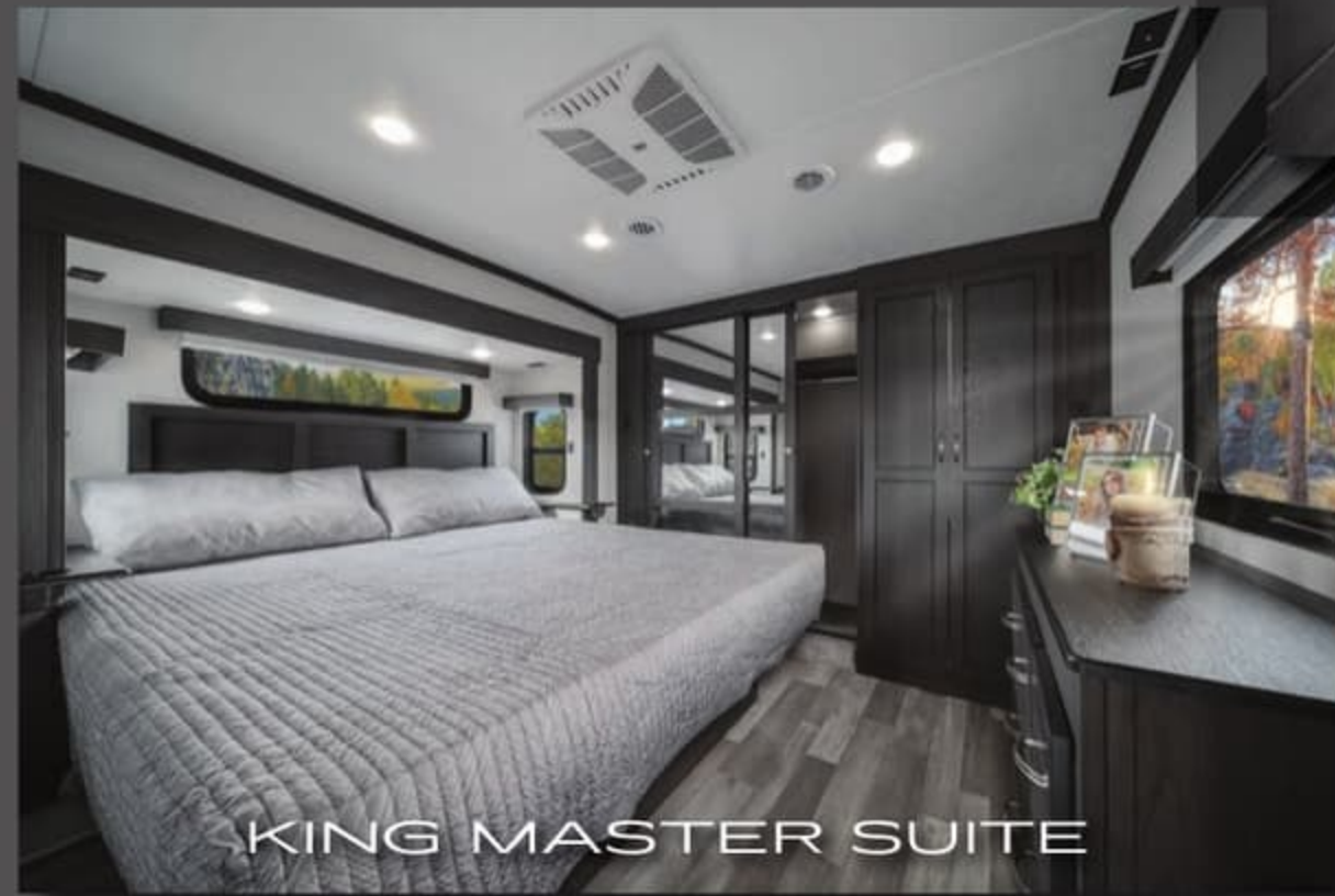
KING MASTER SUITE