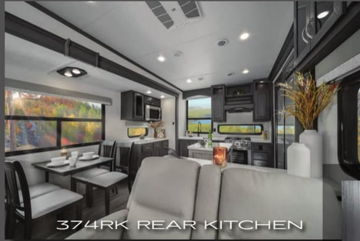
374RK REAR KITCHEN