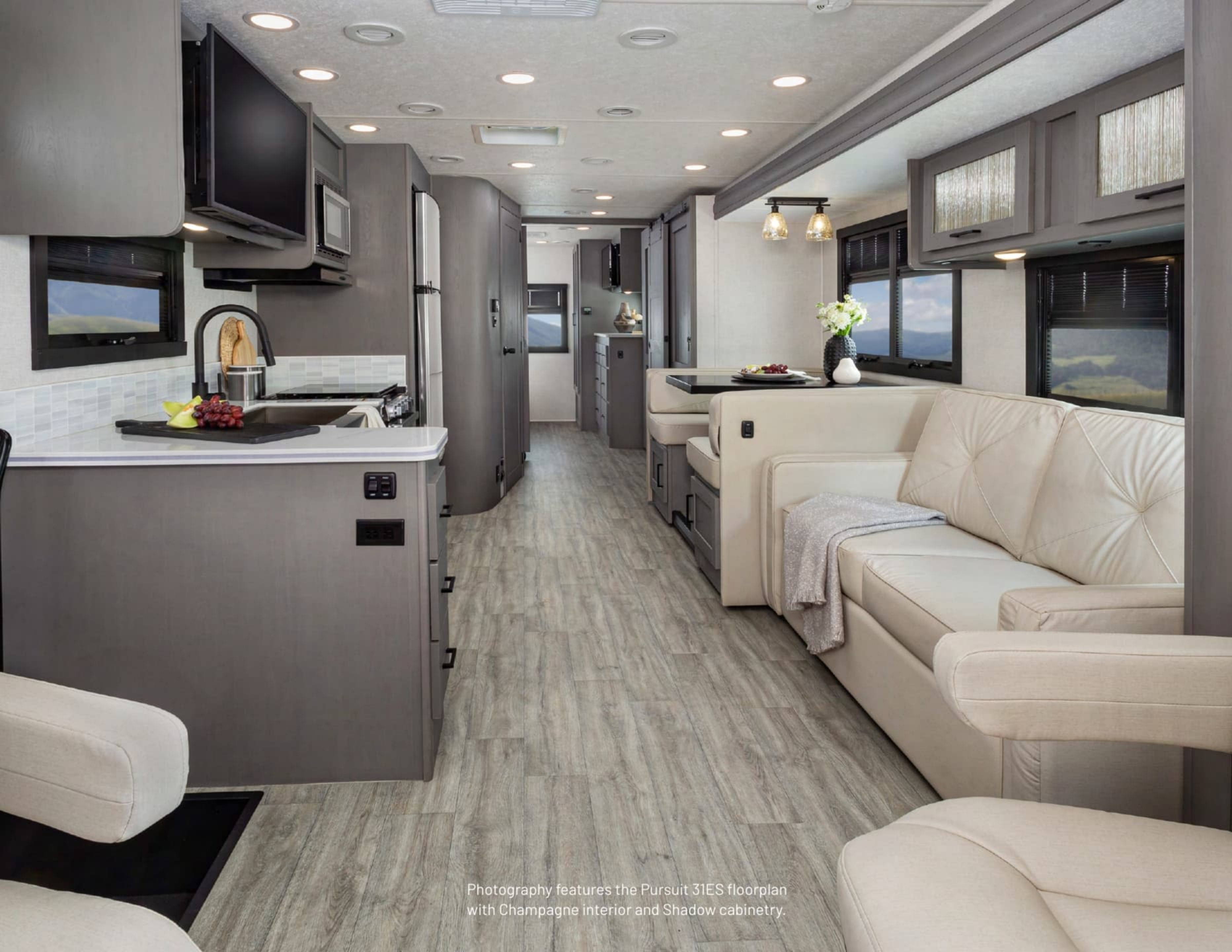
Photography features the Pursuit 31ES floorplan with Champagne interior and Shadow cabinetry.