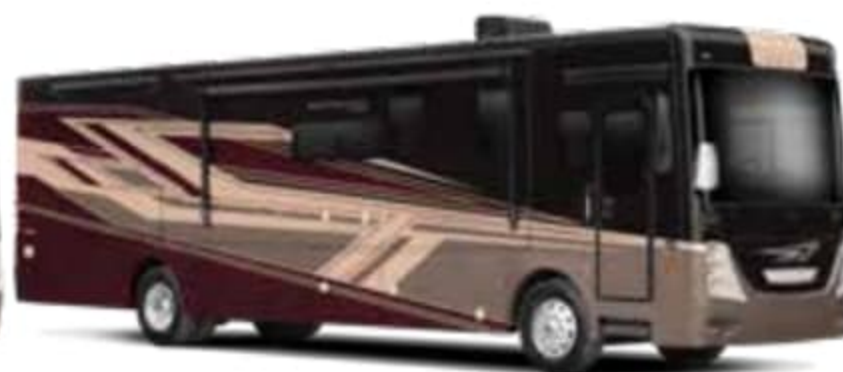
Full Body Paint - Madison Avenue