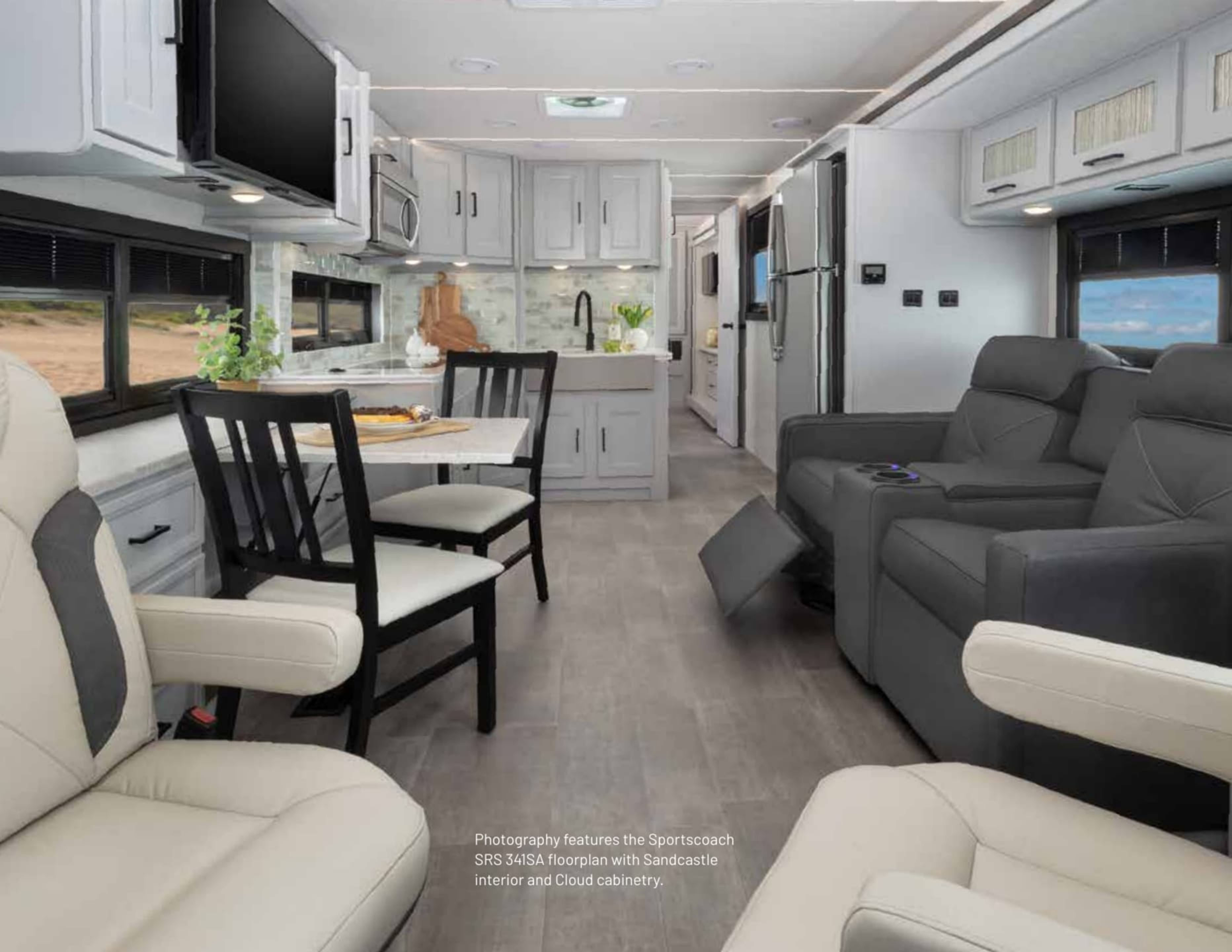
Photography features the Sportscoach SRS 341SA floorplan with Sandcastle interior and Cloud cabinetry.