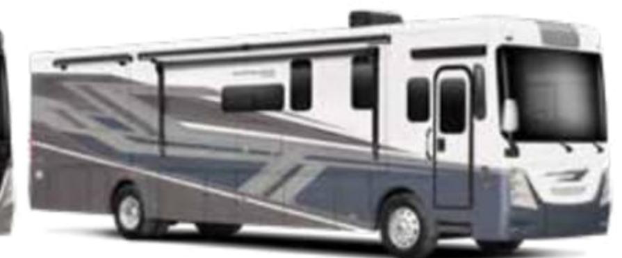
Full Body Paint - The Cooper