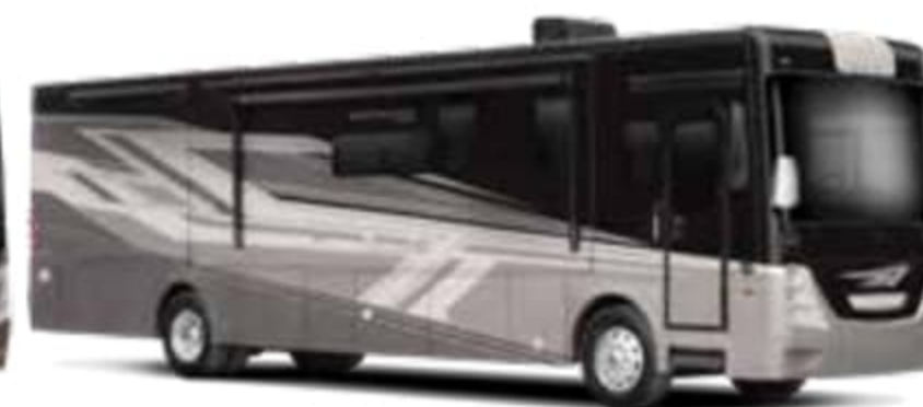
Full Body Paint - Sterling