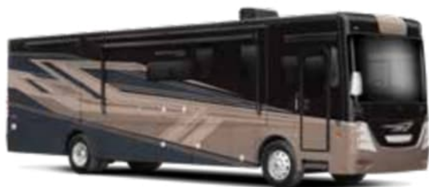
Full Body Paint - Draper