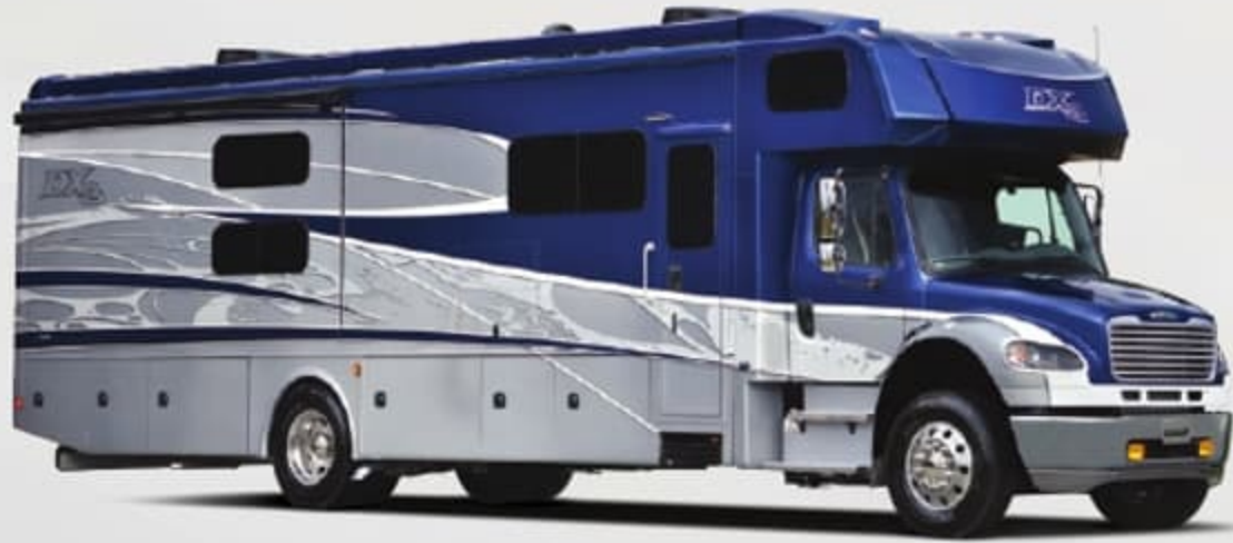
Extended Front Cap with Cab-Over Bunk