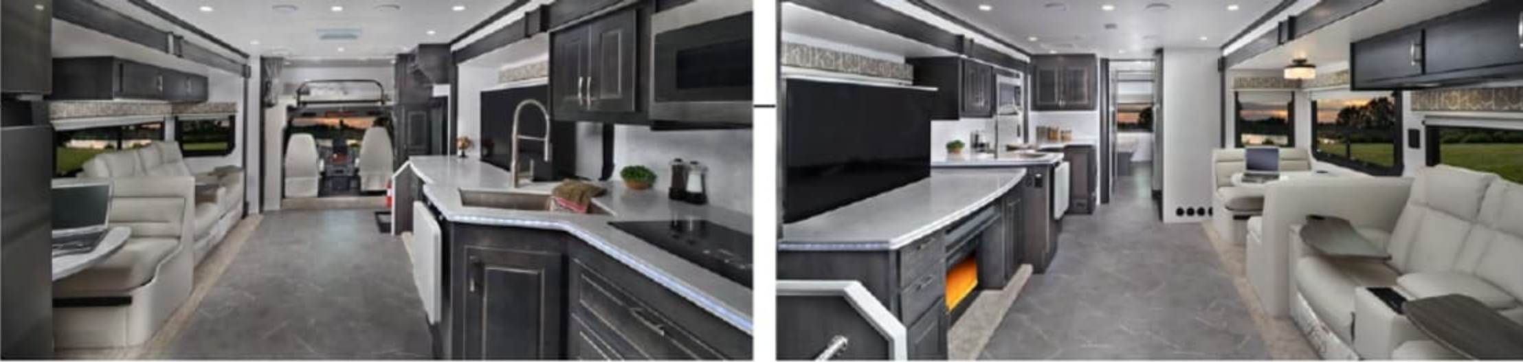
DX3 37TS with Shadow Cabinetry and Milano décor is shown with the Optional Entertainment Center with 50" LED TV and Fireplace.