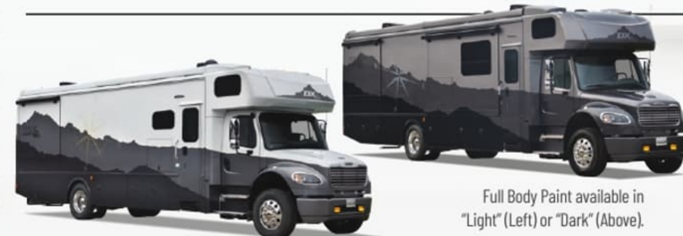
Full Body Paint available in "Light" (Left) or "Dark" (Above).

All information contained in this brochure is believed to be accurate at the time of publication. Please be advised that the stated Standards and Options are subject to change during the model year due to factors outside of the direct control of Dynamax, such as supplier changes/shortages. Dynamax also often makes running changes during the model year to improve reliability, performance, and/or capacity. Please refer to www.dynamaxcorp.com for the most current specifications.