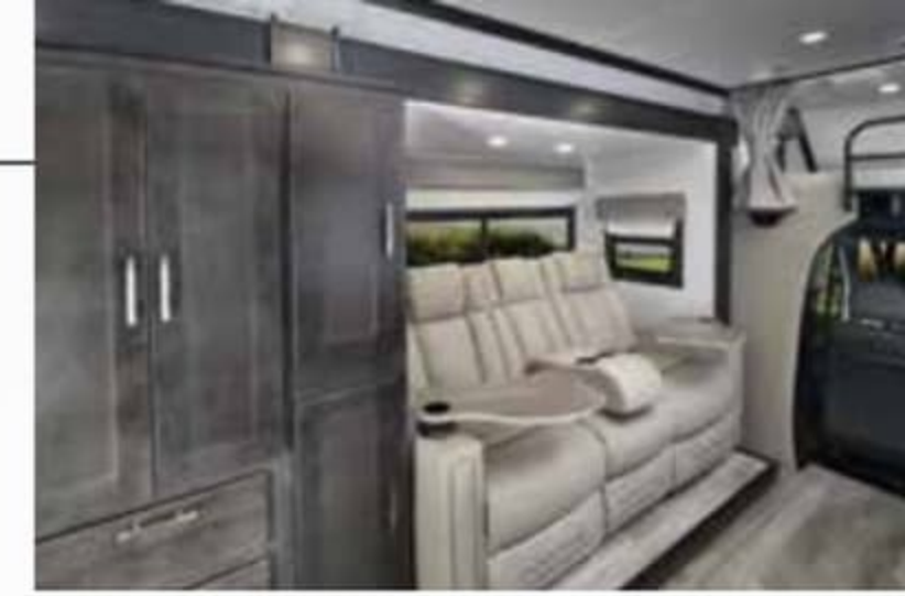
24FW shown with Shadow cabinetry and Crescent décor.