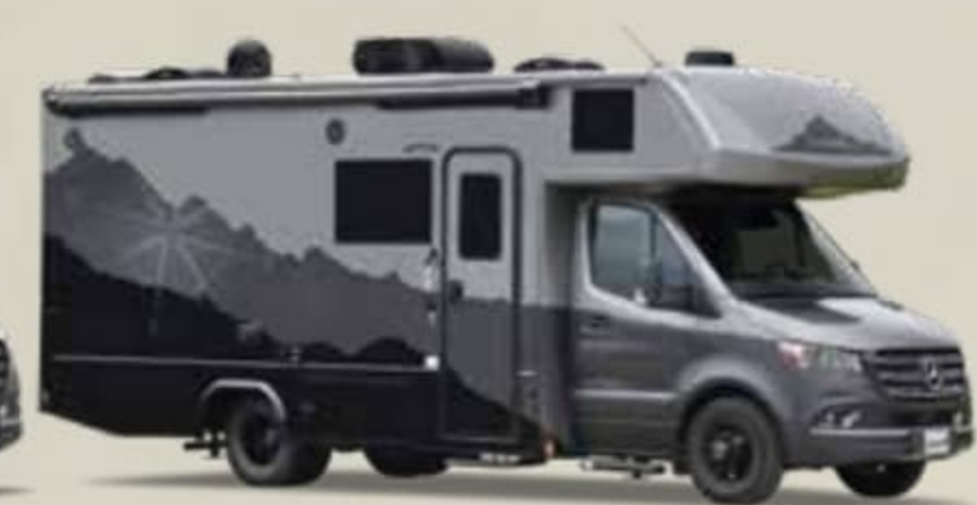
Freedom Edition Dark shown with optional black aluminum wheels