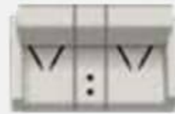
DUAL POWER THEATER SEATS IPO Dinette (24RW)