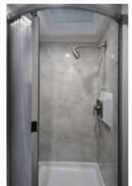
24FW shown with Driftwood II cabinetry and Milano décor.

All information contained in this brochure is believed to be accurate at the time of publication. Please be advised that the stated Standards and Options are subject to change during the model year due to factors outside of the direct control of Dynamax, such as supplier changes/shortages. Dynamax also often makes running changes during the model year to improve reliability, performance, and/or capacity. Please refer to www.dynamaxcorp.com for the most current specifications.