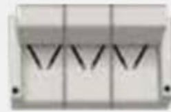
THREE-SEAT POWER THEATER SEATS IPO Dinette (24FW)