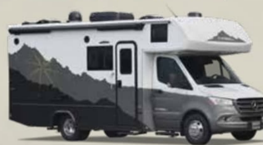
Freedom Edition Light