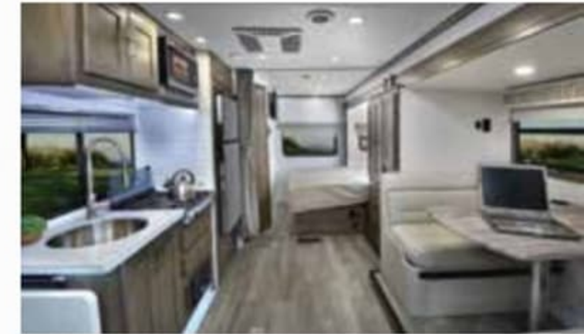
24FW shown with Driftwood II cabinetry and Milano décor.