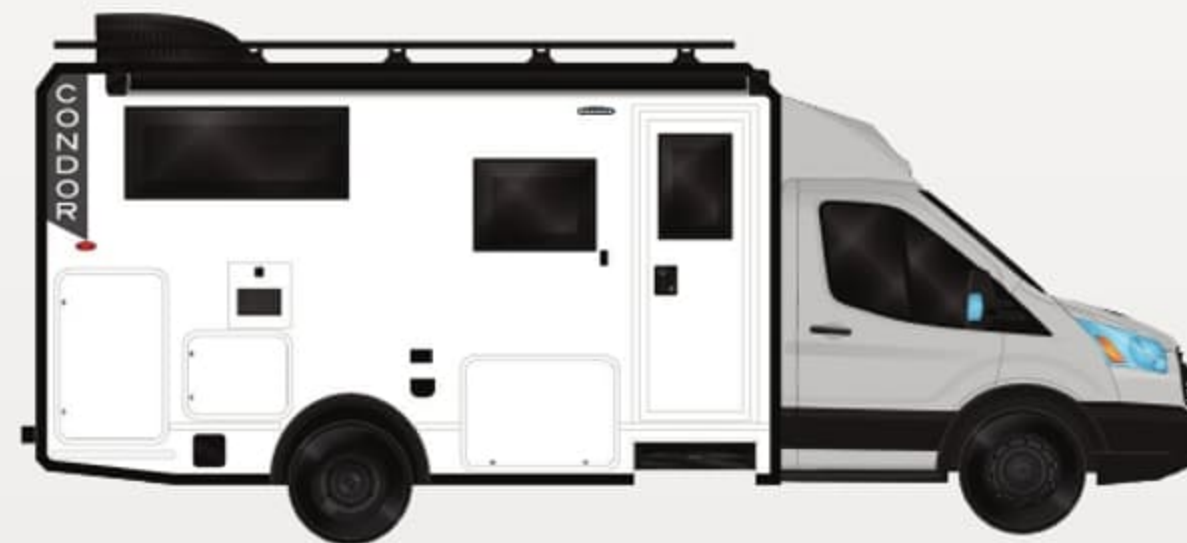
Graphics Delete Option