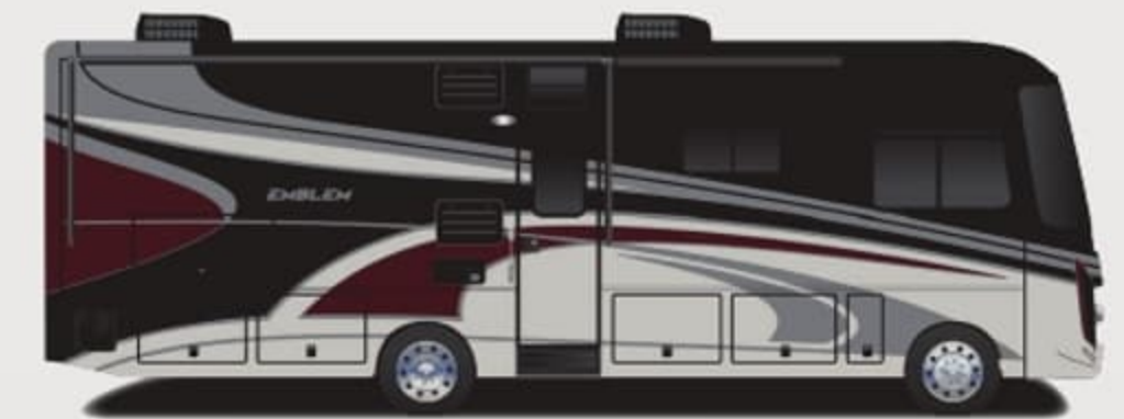
Plains Full-Body Paint