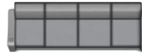
120" Reclining Sofa Option