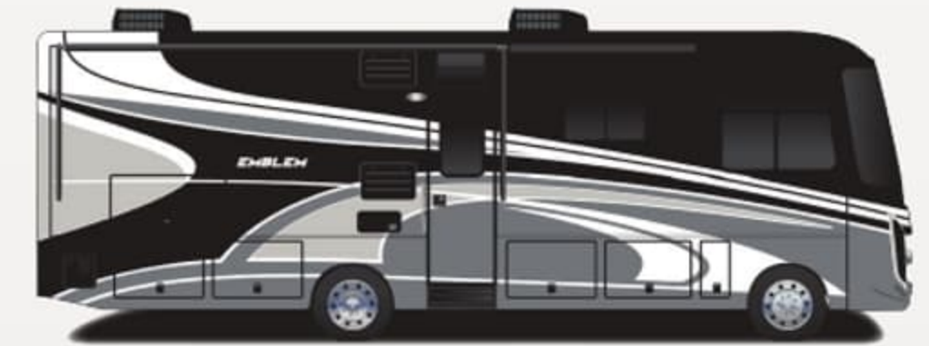
Appalachia Full-Body Paint