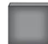
15 Cu. Ft. Fridge Option