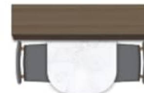
Freestanding Dinette Option