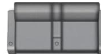
Theater Sofa Option