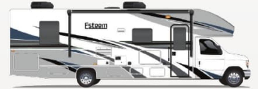
Standard Partial Paint