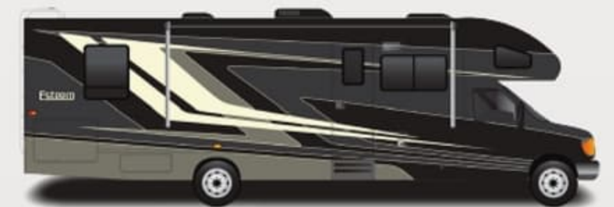
Stardust Full-Body Paint