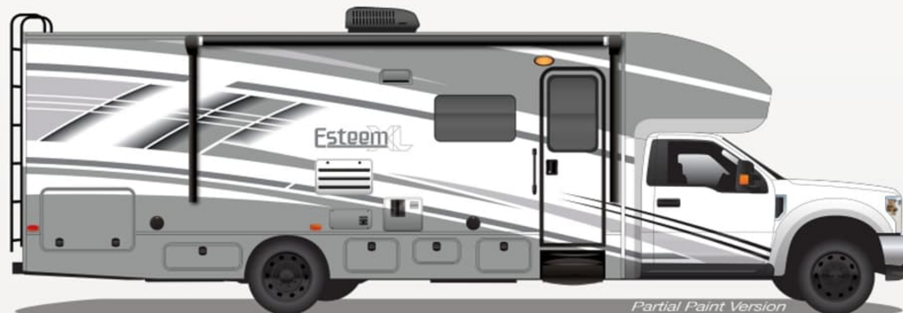
Standard Partial Paint