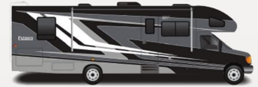
North Star Full-Body Paint