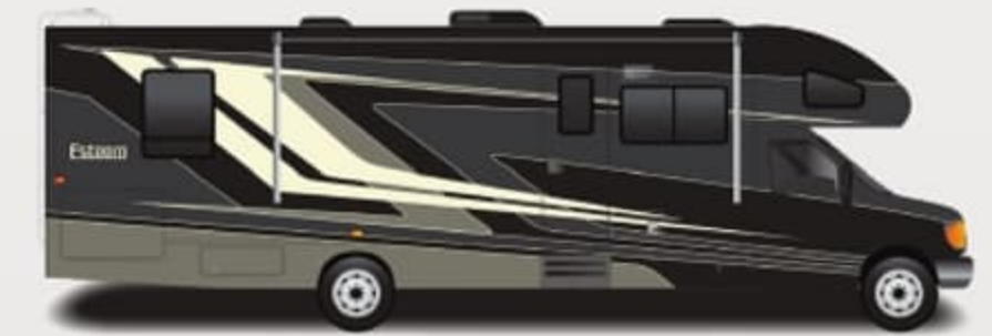
Stardust Full-Body Paint