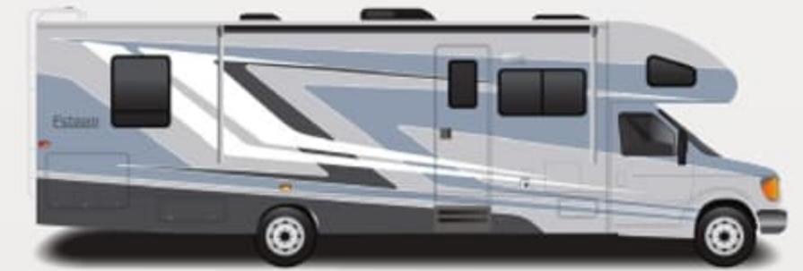
Pearl Full-Body Paint