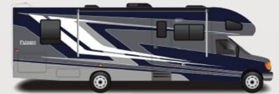
Tidal Mist Full-Body Paint