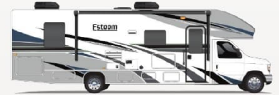
Standard Partial Paint