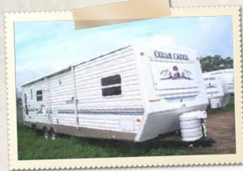
#1st Cedar Creek aluminum-sided Travel Trailer in 1998... wow!