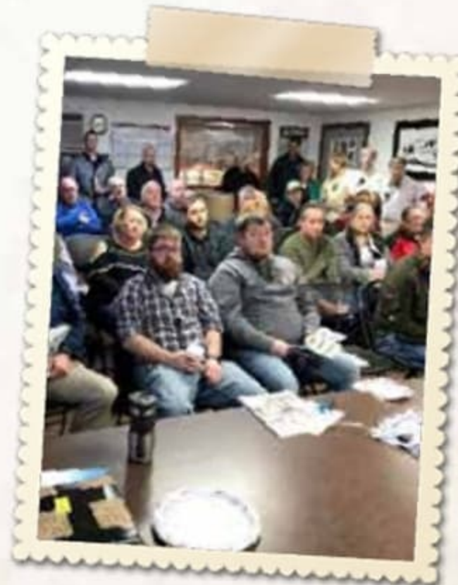
Cedar Creek University training classes