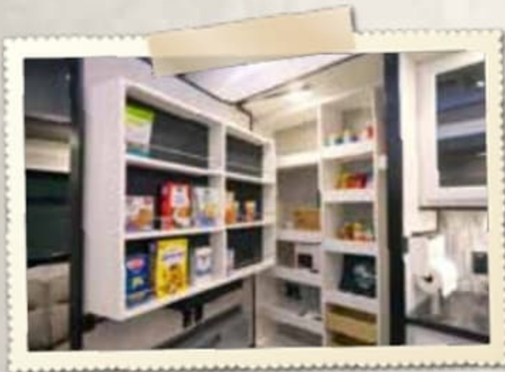
MURPHY PANTRY You'll find this large capacity storage tucked away in a convenient and handy location. The shelving is custom built by Cedar Creek.