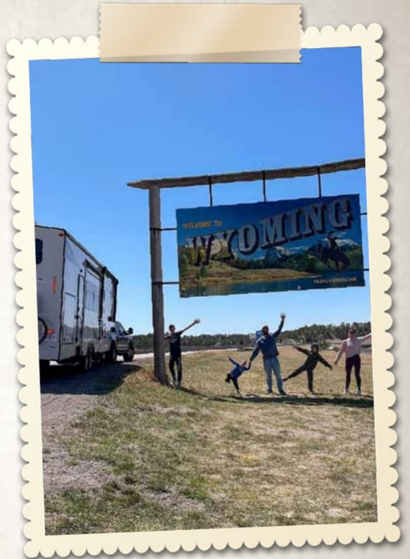
Cedar Creeks have seen the world in 25 years!