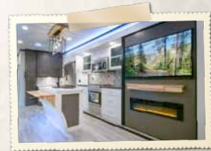
ENTERTAINMENT CENTER A decorative fireplace with natural wood mantel and Smart television mounted on a swing arm.