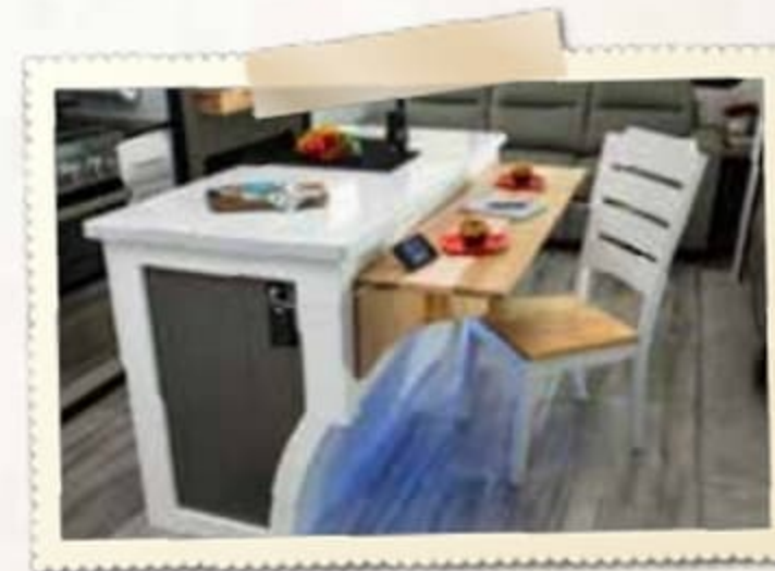
FLIP-UP BREAKFAST COUNTER This multi-purpose countertop can be used in a variety of ways. Additional space is available thanks to our unique flip-up counter.