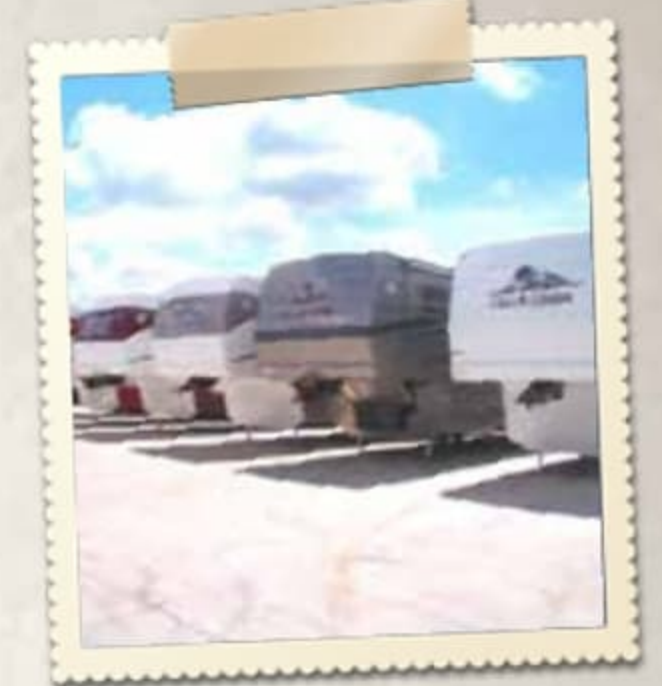
Cedar Creek fantastic lineup for 2003