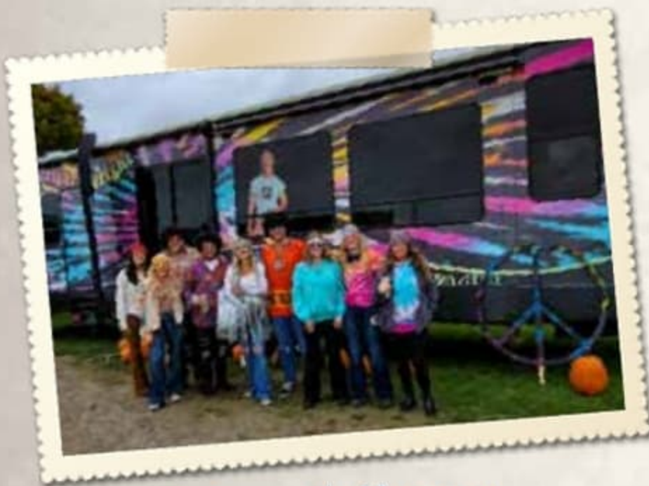
Forest River Halloween Spooktacular 2021