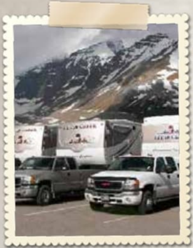
Cedar Creek RV Owners Group Alaska 2007