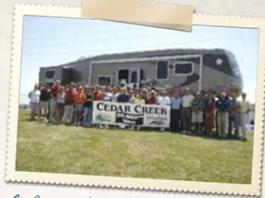
On June 12th, 2007, Cedar Creek, proudly celebrated its 20,000th unit, and marked this occasion by giving back to the community