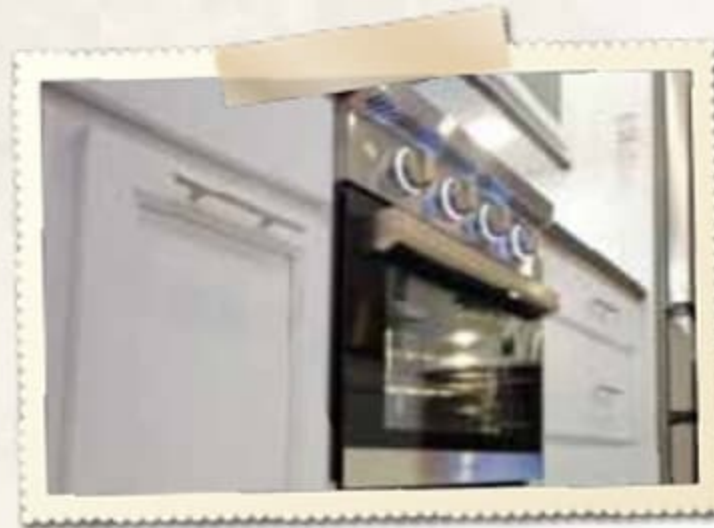
GAS RANGE Chef's Collection gas range is large and convenient. It's built in to our custom cabinetry in the kitchen.