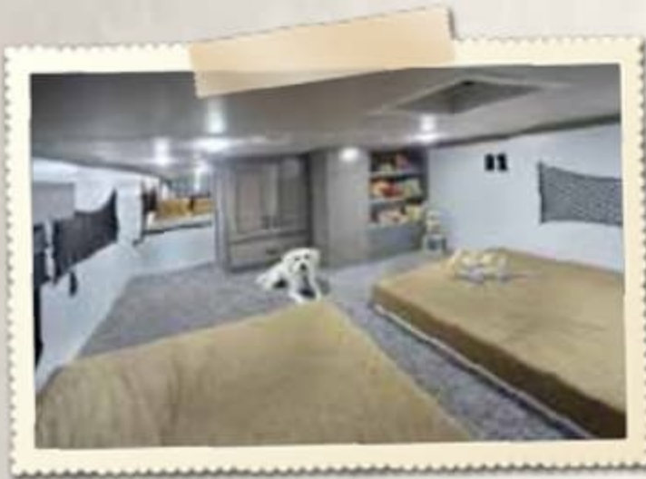
UPPER DECK Some floorplans like the 40CDL and 40CBK have two upper level sleeping areas or convert into a storage area.