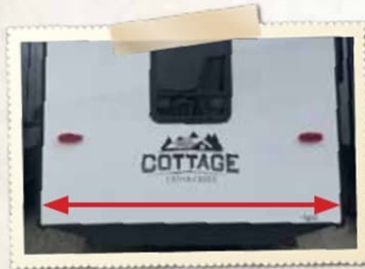
WIDE-BODY CONSTRUCTION Cottages are built on a 102" wide-body construction platform.