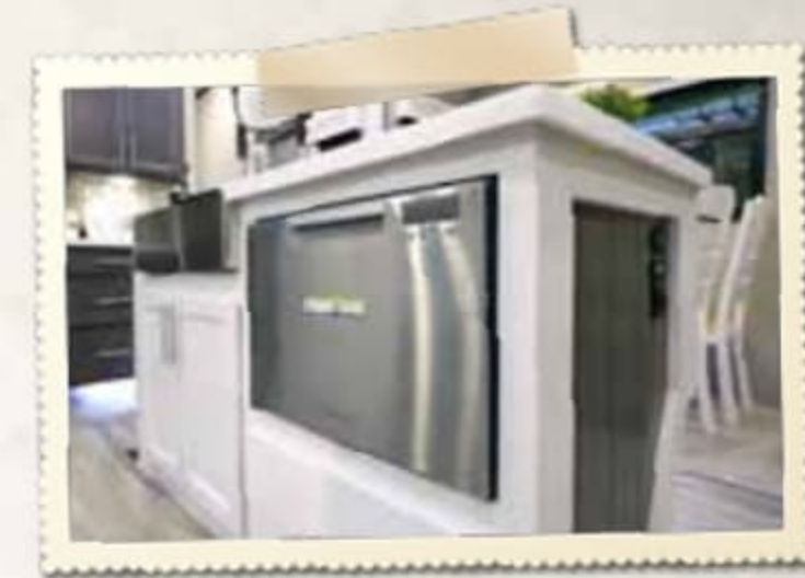
DISHWASHER The dishwasher is a great optional feature (most models) and is built into the island.