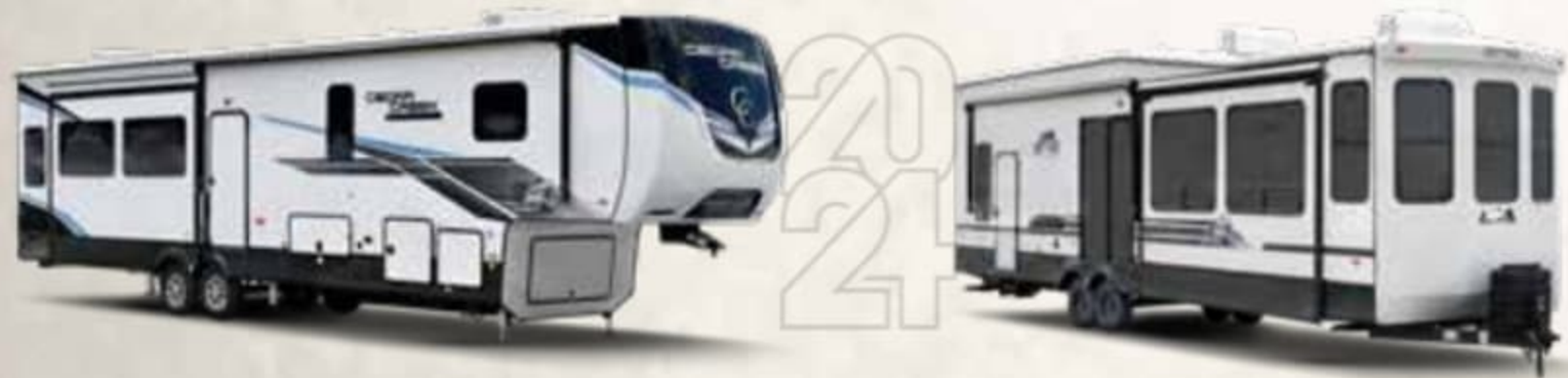
2024 FIFTH WHEEL Pages 6-11