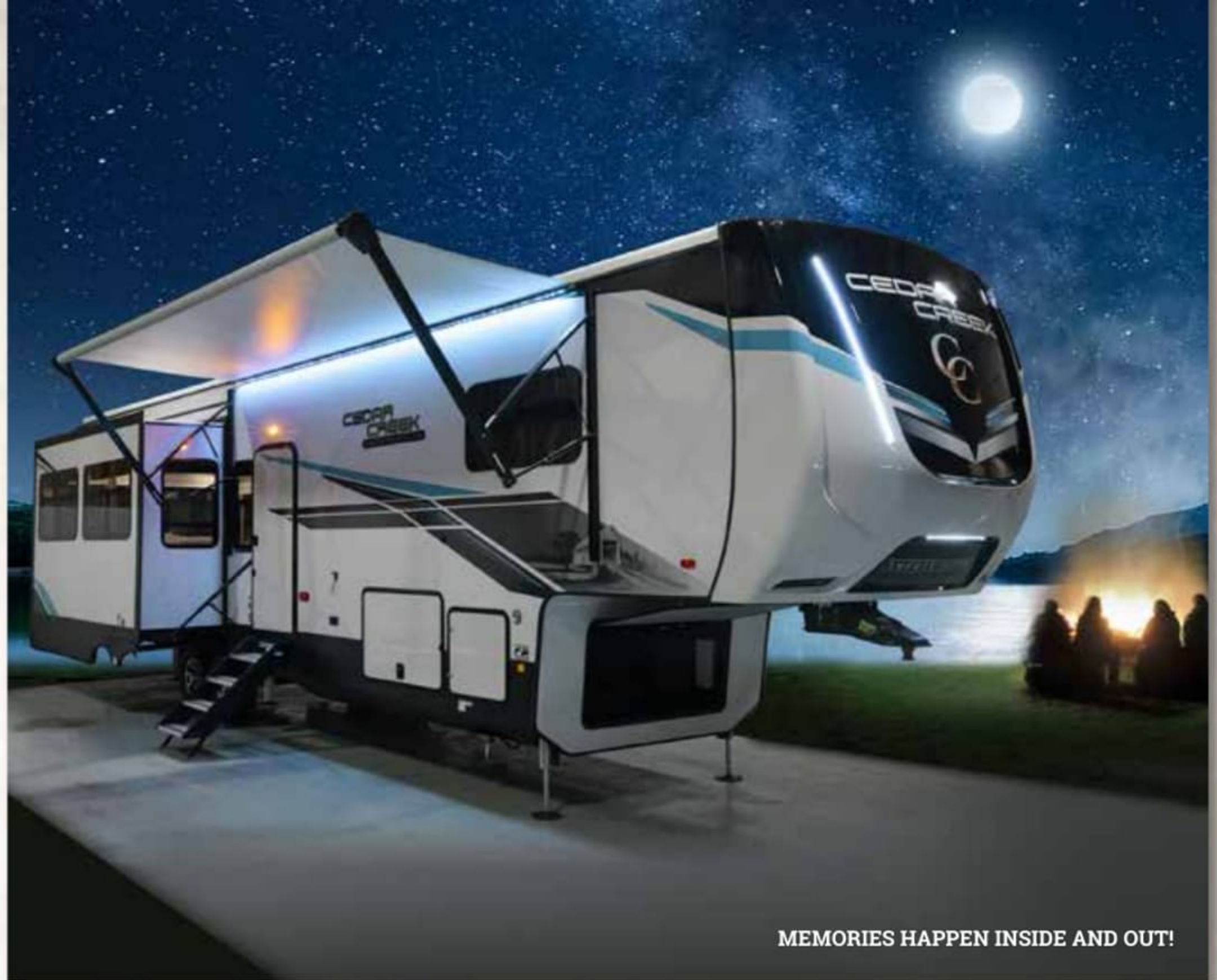
MEMORIES HAPPEN INSIDE AND OUT!