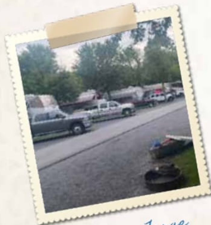
At the Pigeon Forge, TN 2020 rally!