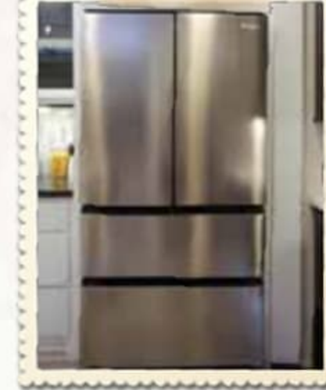
REFRIGERATOR 12Volt, 20 Cu. Ft. stainless steel refrigerator with icemaker.