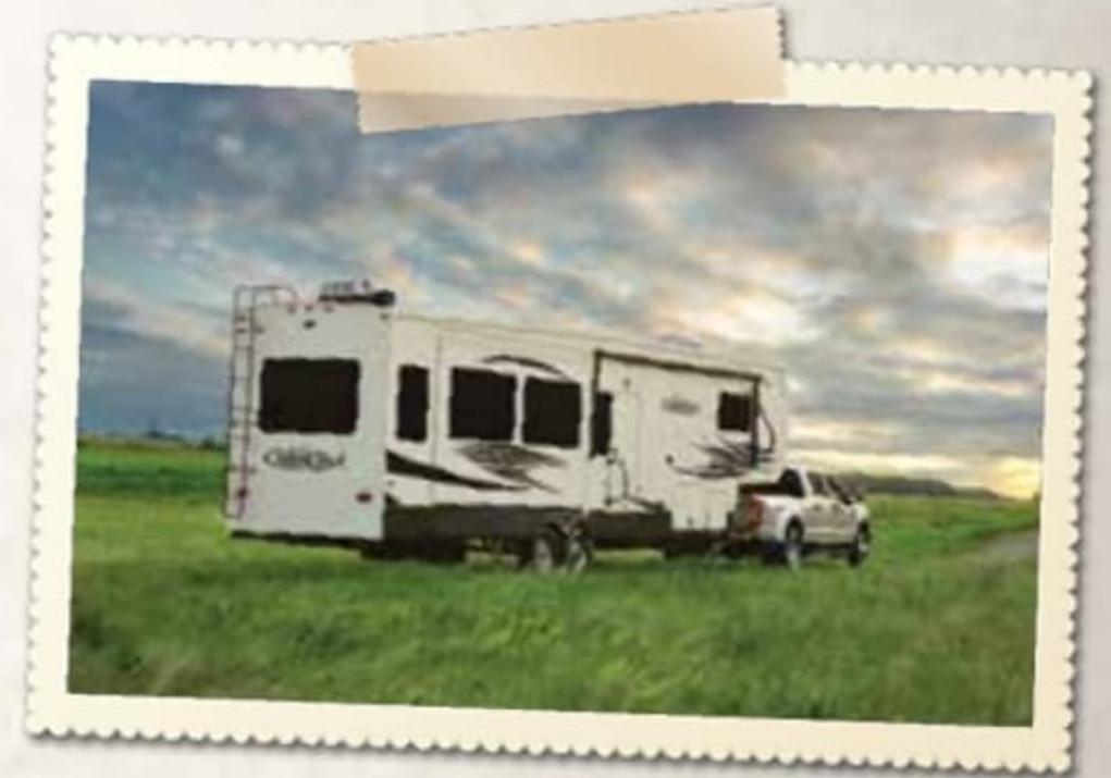
Cedar Creek, the smart choice for the experienced RVer