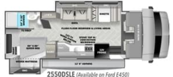
2550DSLE (Available on Ford E450)