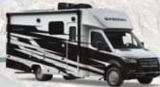
ONYX Full body paint (also available on Transit)