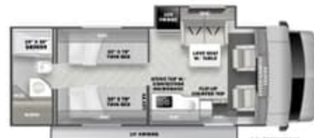
TS2370 (Ford EcoBoost 3.5L gas engine)