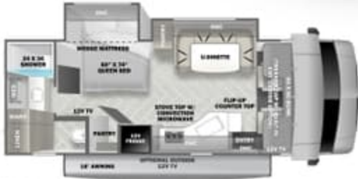
2440DS (Available on Ford E450)