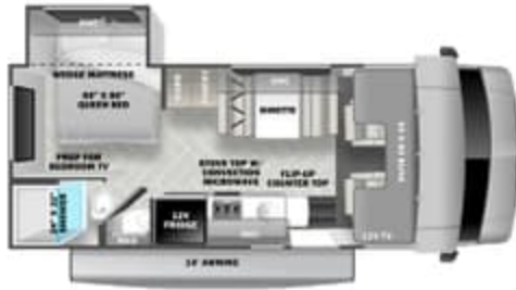
2250SLE (Available on Ford E350/Chevy 3500)