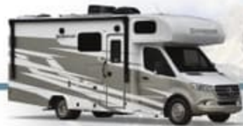
PLATINUM Full body paint (also available on Transit)