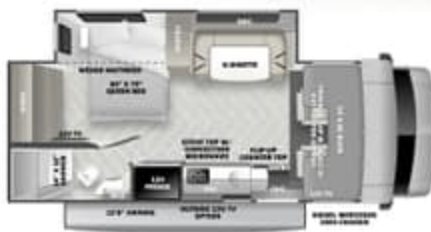
2400B (Available on Sprinter 3500)