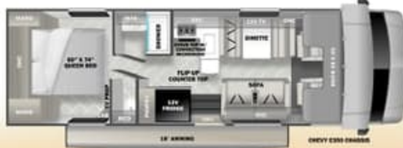
2950SLE (Available on Ford E450)