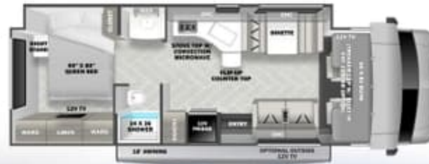
3050S (Available on Ford E450)