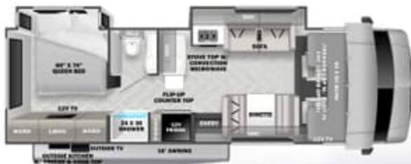
2860DS (Available on Ford E450)