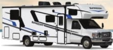
STANDARD Exterior graphics (Standard on LE, Classic, MBS & TS Models)