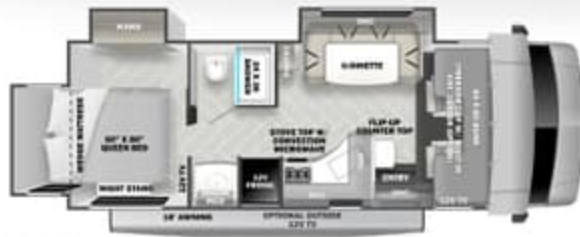
2500TS (Available on Ford E450)