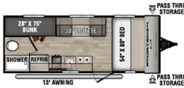
180BH UVW - 2,880 | Exterior Length - 21' 5" | Sleeps - 4