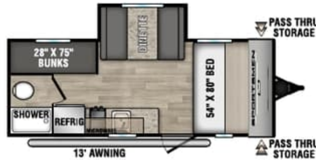
181BH UVW - 3,180 | Exterior Length - 21' 5" | Sleeps - 5