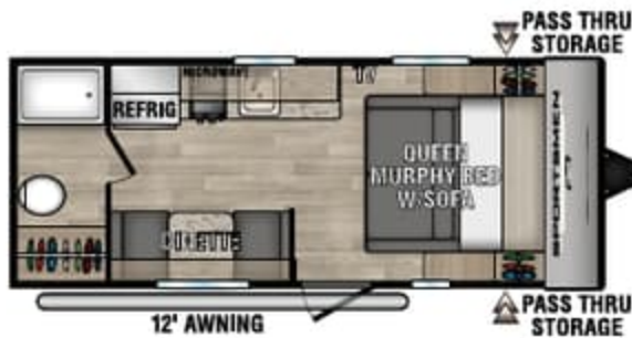
170MB UVW - 2,980 | Exterior Length - 22' | Sleeps - 3