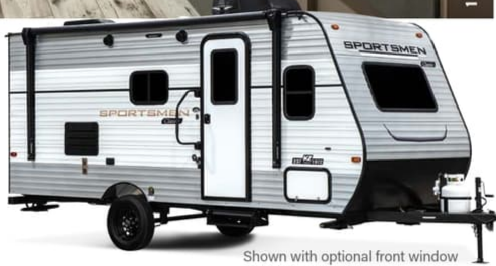
Shown with optional front window