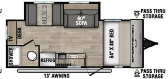
181SS UVW - 3,570 | Exterior Length - 22' 2" | Sleeps - 4