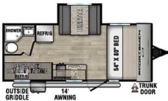
191BHK UVW - 3,490 | Exterior Length - 22' 1" | Sleeps - 5