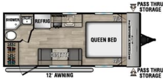
160QB UVW - 2,960 | Exterior Length - 22' | Sleeps - 3