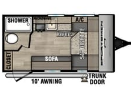
130RB UVW - 2,350 | Exterior Length - 16' 9" | Sleeps - 2

NOTE: Options and packages can be found on the website