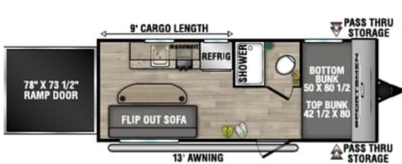
180TH TOY HAULER UVW - 3,210 | Exterior Length - 21' 8" | Sleeps - 4