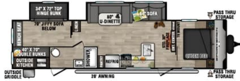
332BHKSE UVW - 7,440 | Exterior Length - 37' 3" | Sleeps - 10