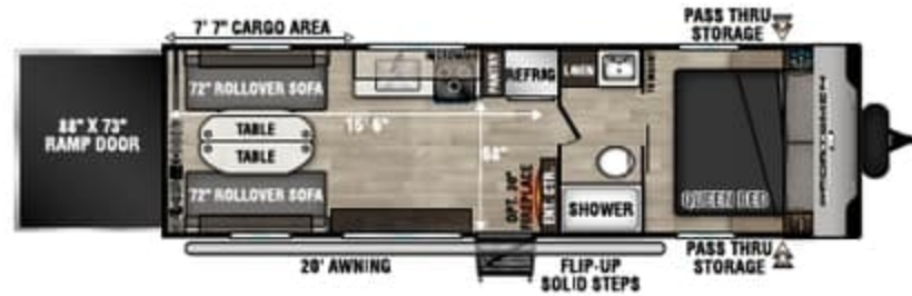
270THSE UVW - 5,400 | Exterior Length - 30' 10" | Sleeps - 6