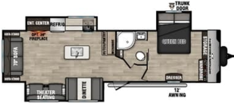
303QBSE UVW - 7,600 | Exterior Length - 34' 7" | Sleeps - 5