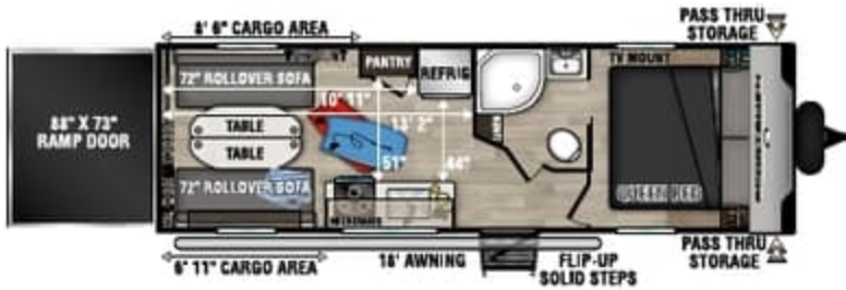
250THSE UVW - 5,300 | Exterior Length - 29' 1" | Sleeps - 6