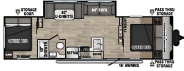
301DBSE UVW - 6,180 | Exterior Length - 32' 10" | Sleeps - 8