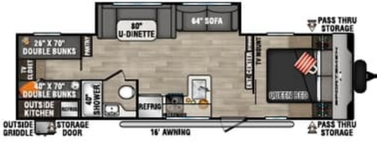
301BHKSE UVW - 6,310 | Exterior Length - 32' 10" | Sleeps - 10