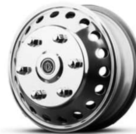
Standard Steel Wheels With Wheel Simulators