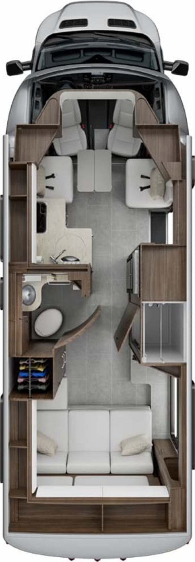
Rear Lounge | W24RL