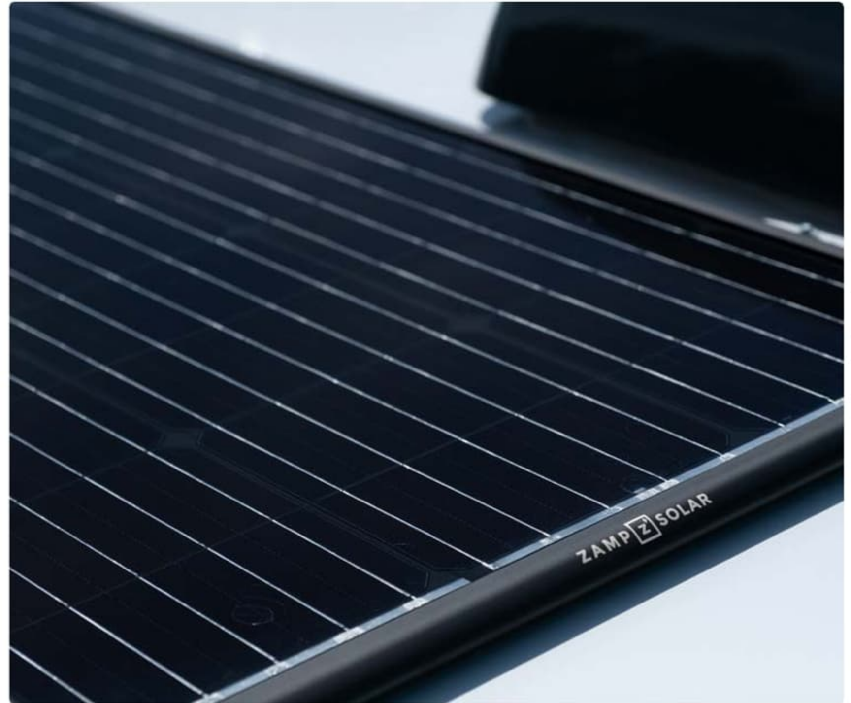
Rigid Solar Panels with Control Panel 200 W or 400 W