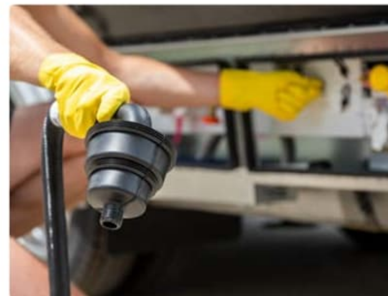
Macerator Sewage Discharge With Manual Disconnect