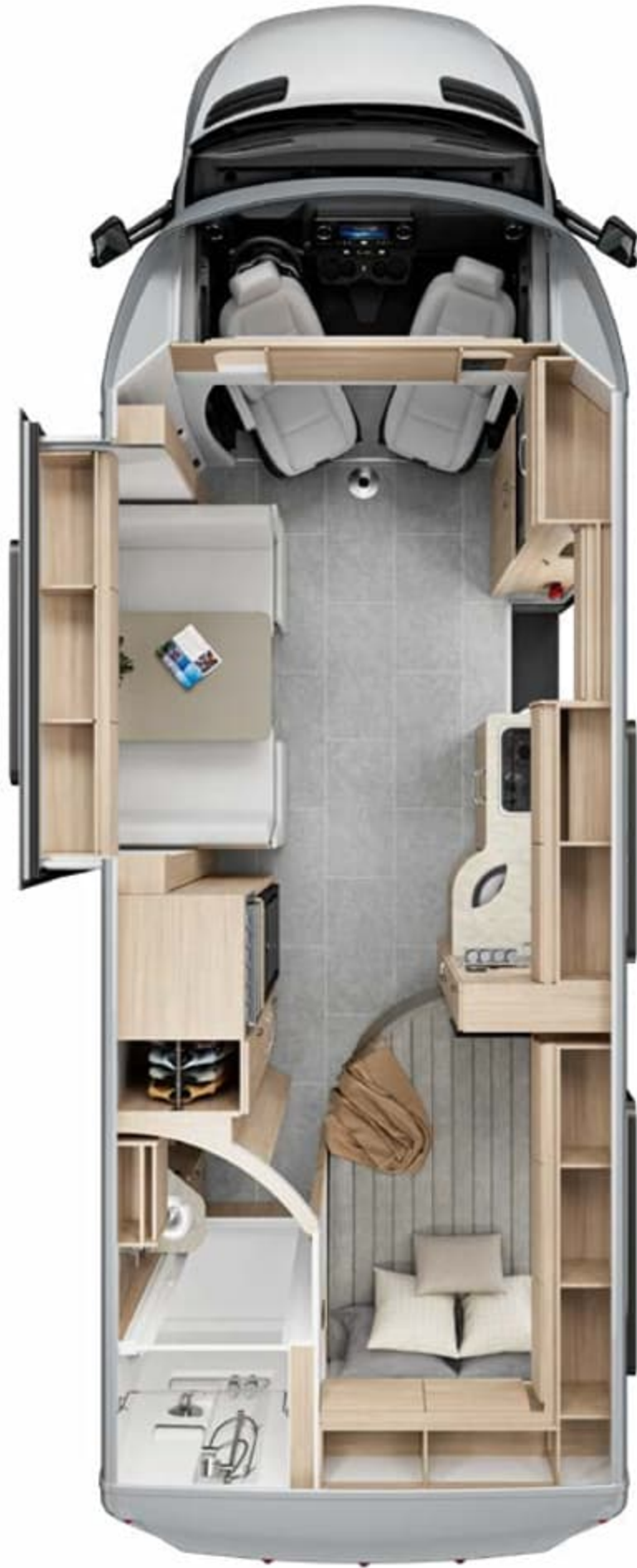
Corner Bed | U24CB (Shown with Standard Dinette)