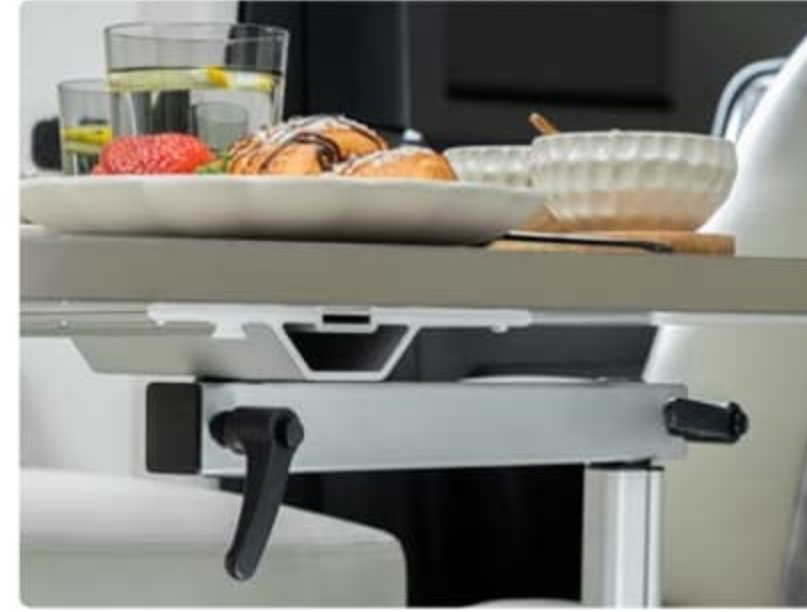
Removable Front Table Between Captain's Chairs (MBL)