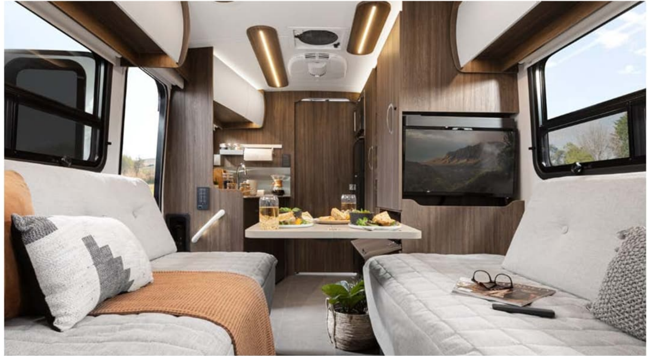
Mocha shown with Bianco White FENIX® Cabinetry Upgrade