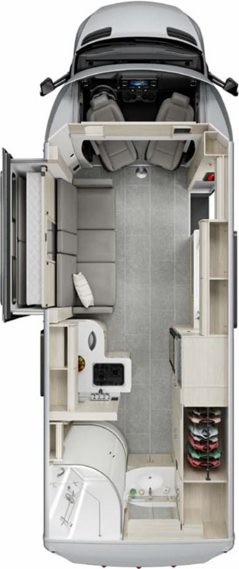
Murphy Bed | U24MB (Shown with standard Leisure Lounge)