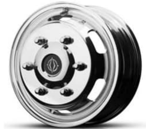
Optional Alcoa Dura-Bright® Aluminum Wheels All 6 Aluminum Wheels, 4 Dura-Bright® Wheels