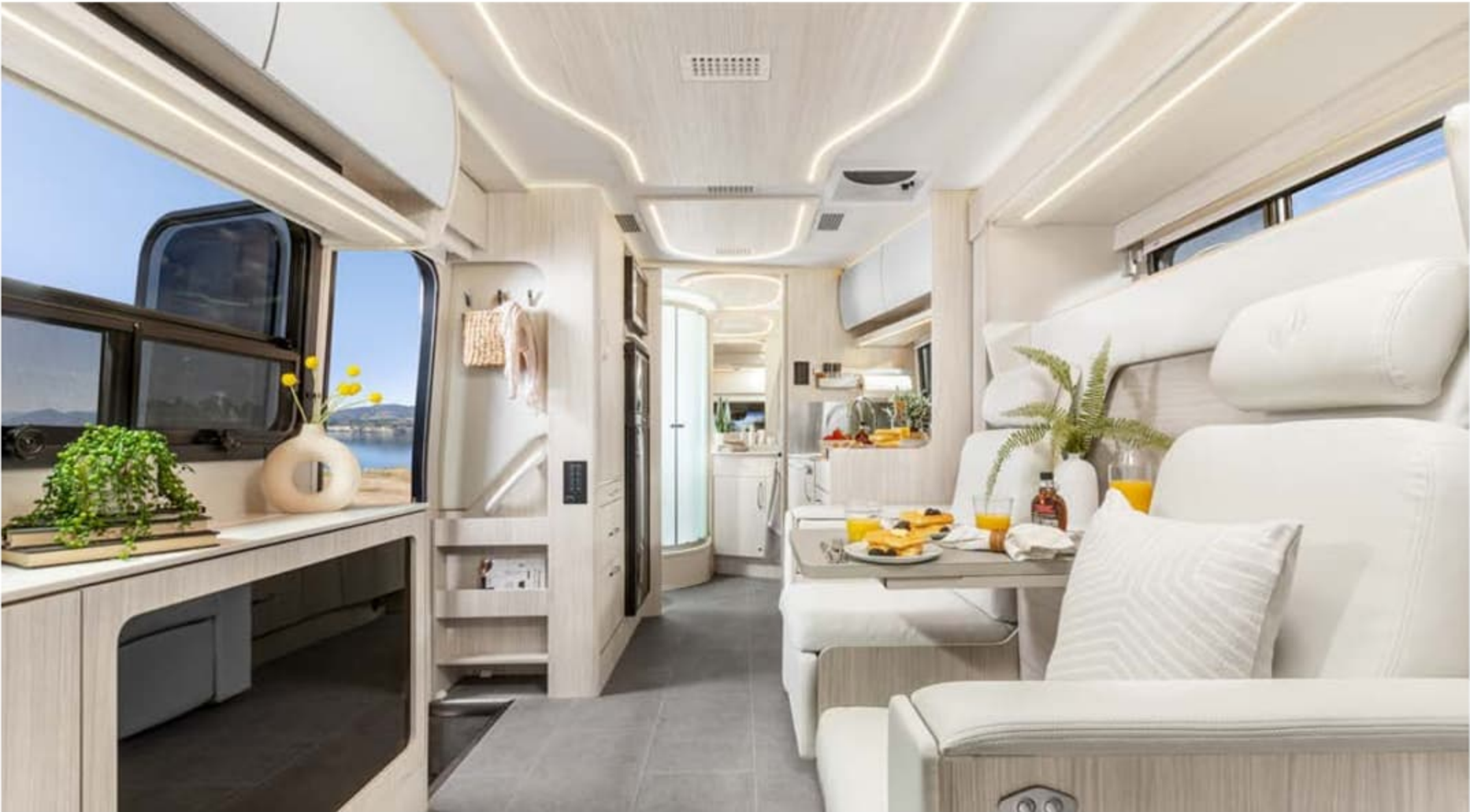
White Oak shown with Bianco White FENIX® Cabinetry Upgrade