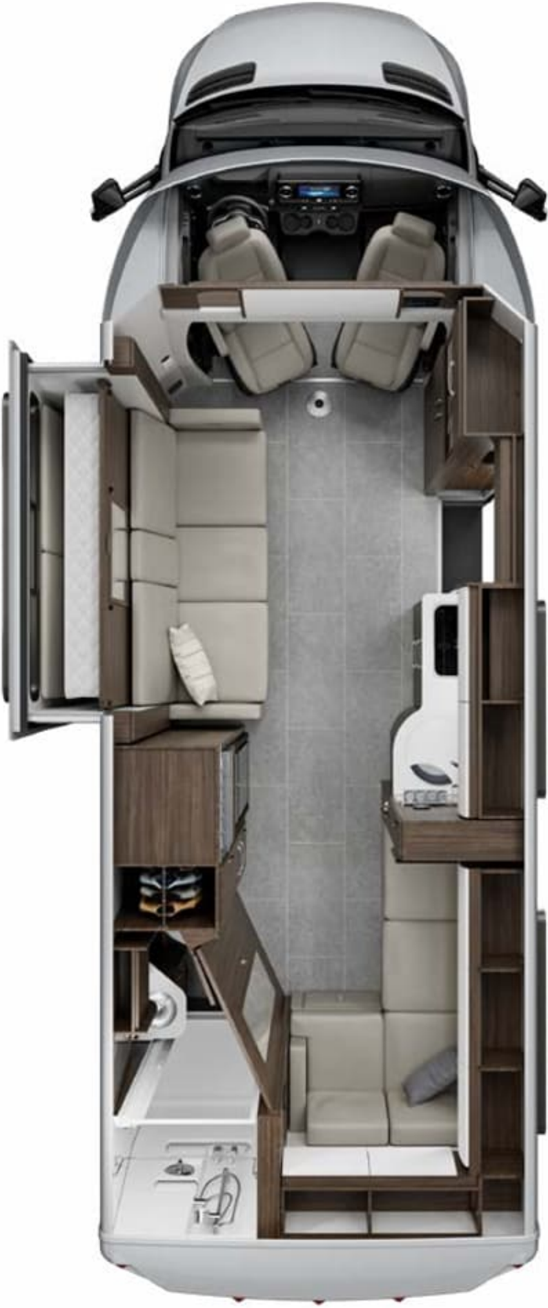
FX | U24FX