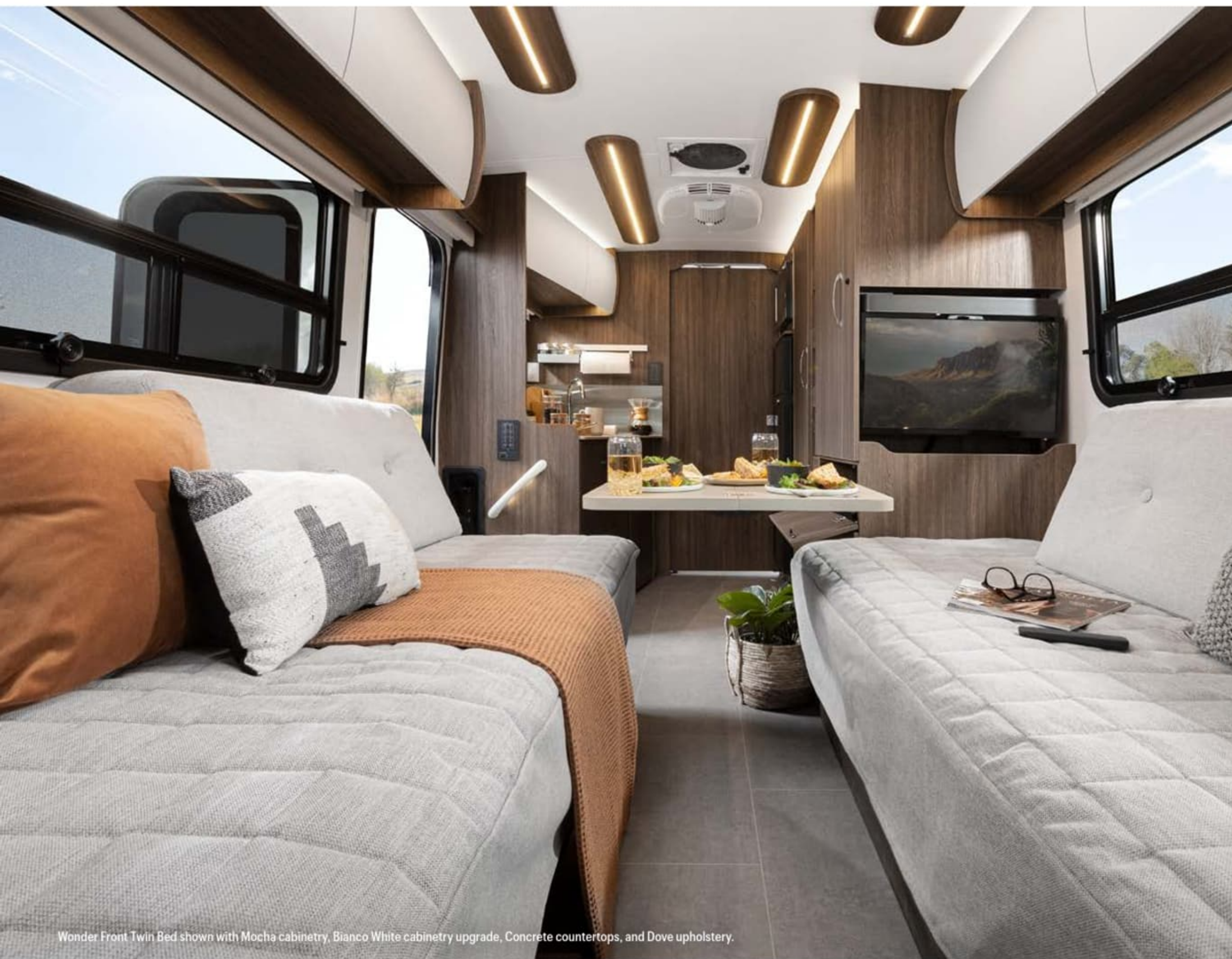
Wonder Front Twin Bed shown with Mocha cabinetry, Bianco White cabinetry upgrade, Concrete countertops, and Dove upholstery.