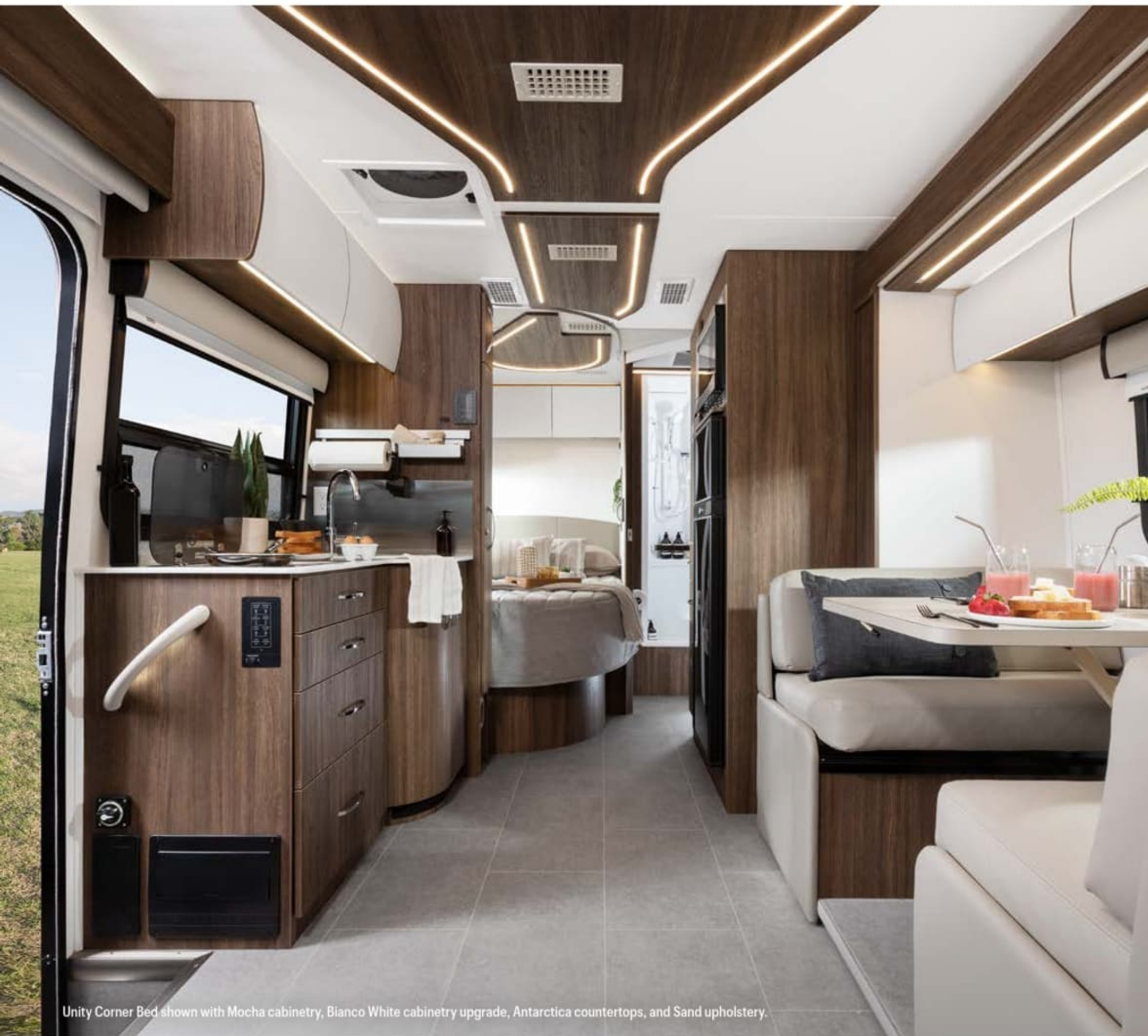
Unity Corner Bed shown with Mocha cabinetry, Bianco White cabinetry upgrade, Antarctica countertops, and Sand upholstery.