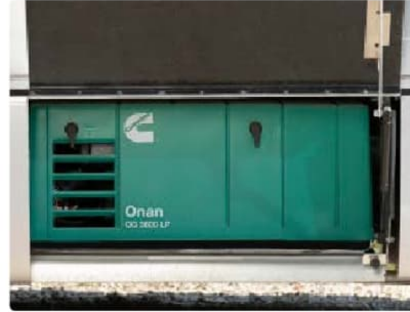
3.6 kW LP Generator With Auto Start and Auto Changeover Switch