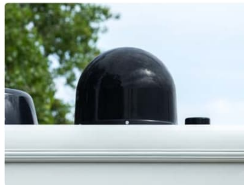
Auto-Acquisition Satellite Dish