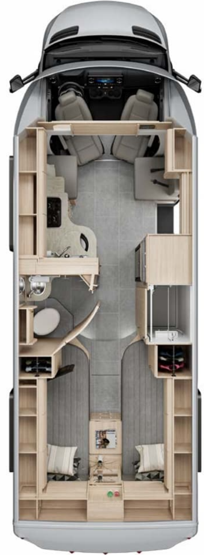
Twin Bed | U24TB