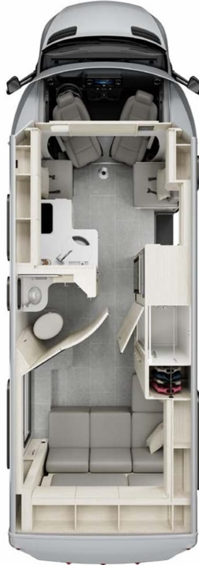
Rear Lounge | U24RL