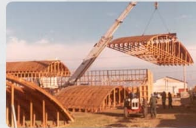
1972 Staff Dedication The company contemplated shutting its doors. It was the dedication, loyalty, and work ethic of laid off staff that would characterize the Triple E community. The staff called a meeting with management and offered their labour, free of charge, to re-build the plant.