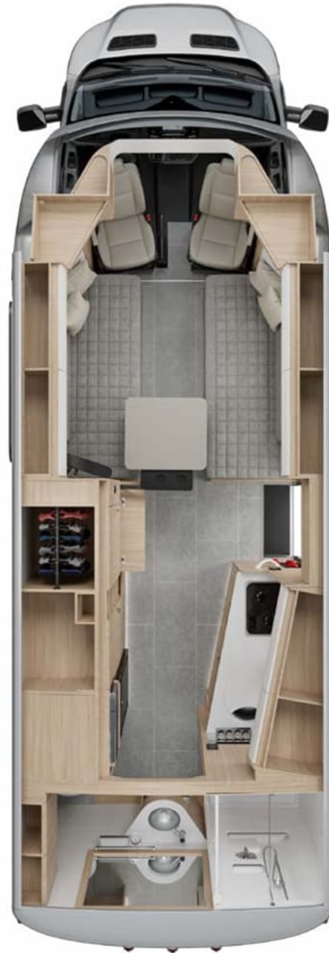
Front Twin Bed | W24FTB