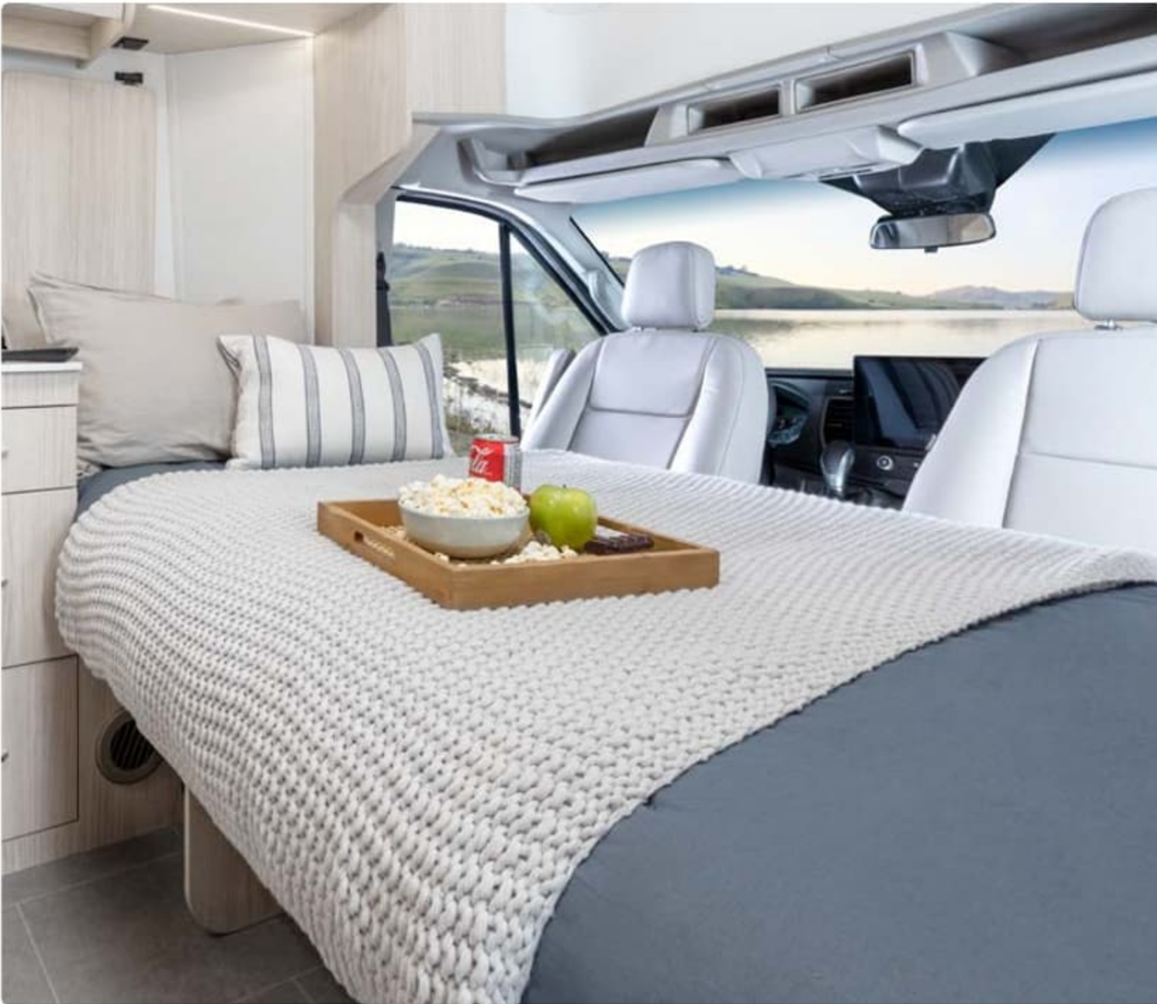
Inflatable Bed for Front Dinette 45" x 88" Sleeping Area (RL, RTB)