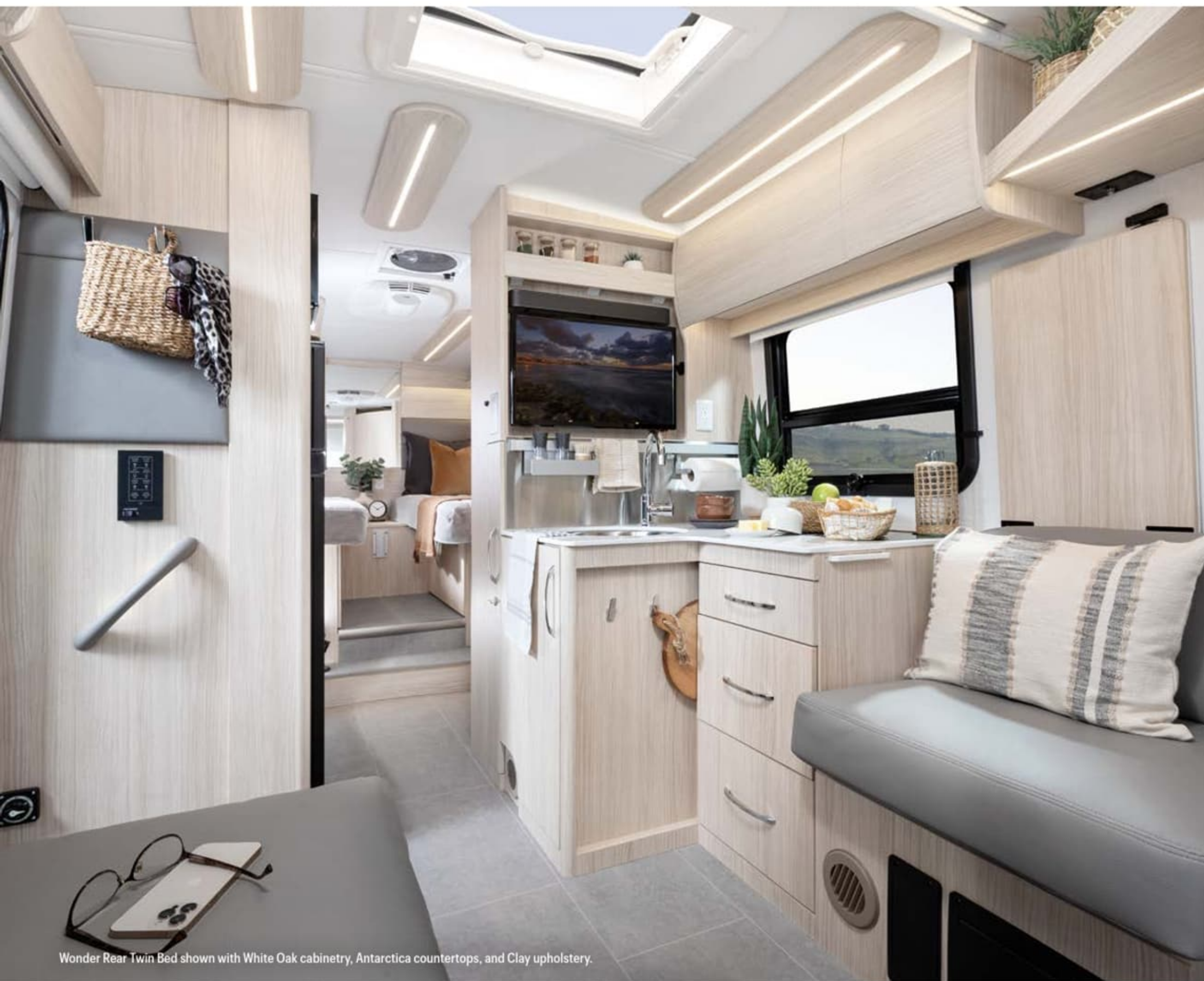
Wonder Rear Twin Bed shown with White Oak cabinetry, Antarctica countertops, and Clay upholstery.