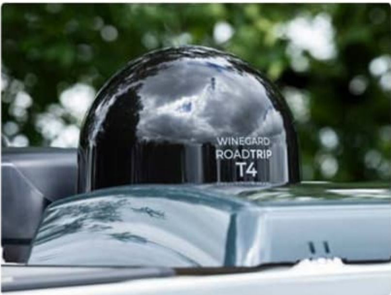
Auto-Acquisition Satellite Dish