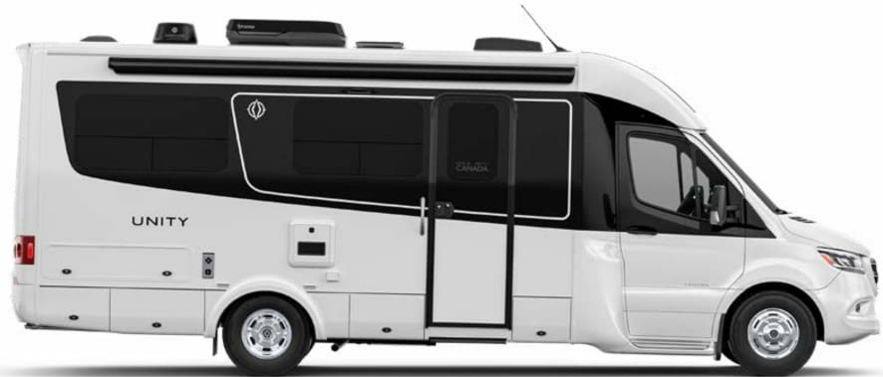
Wheelbase: 170" (4,326 mm)