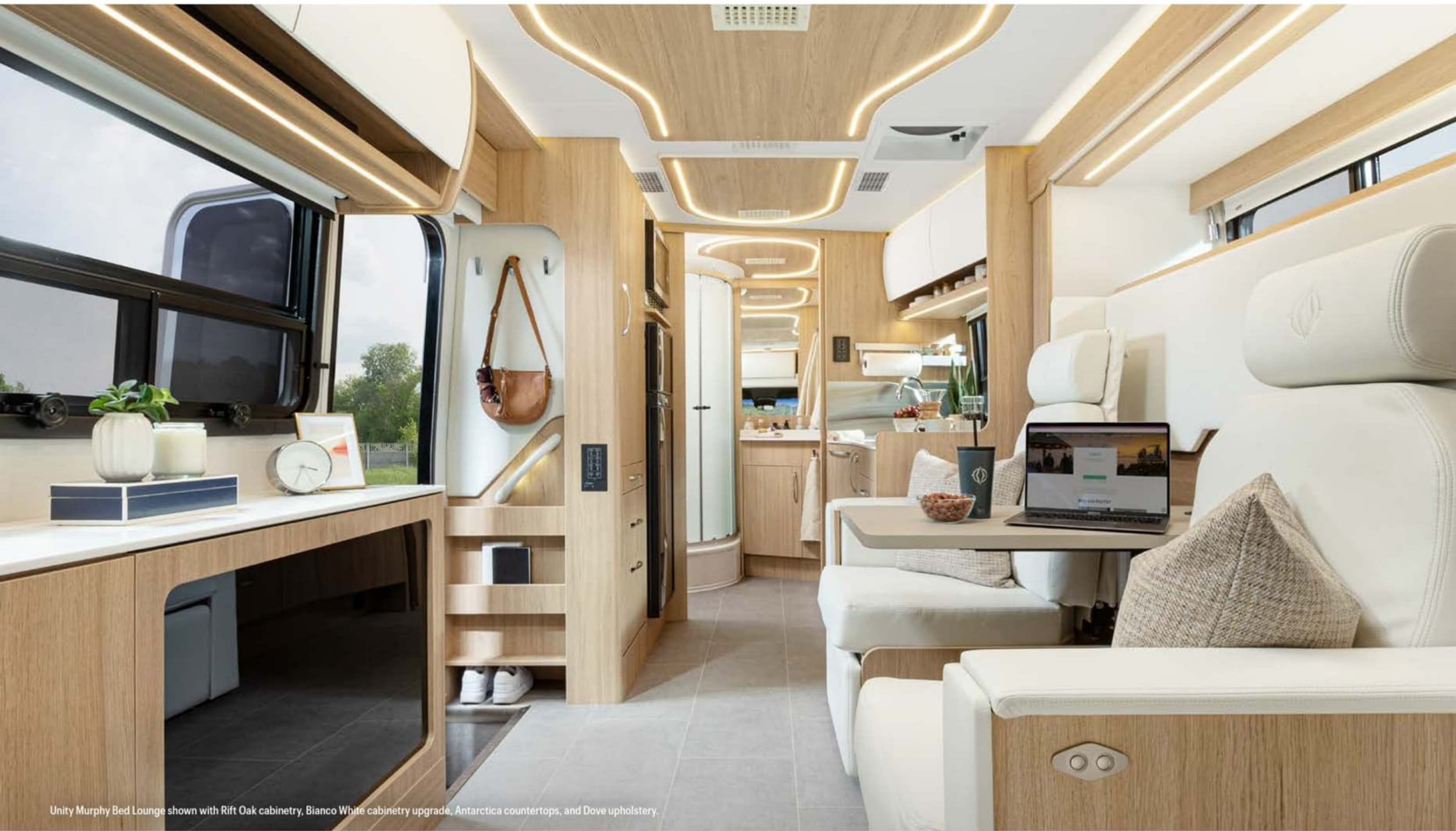
Unity Murphy Bed Lounge shown with Rift Oak cabinetry, Bianco White cabinetry upgrade, Antarctica countertops, and Dove upholstery.