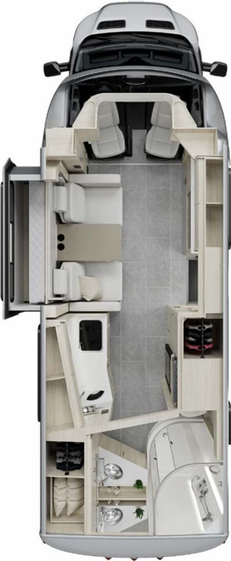
Murphy Bed Lounge | W24MBL