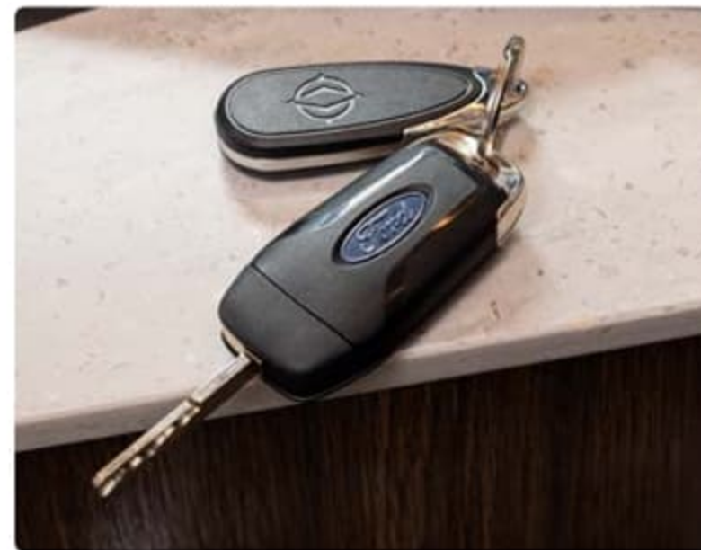
Keyless Entrance Door