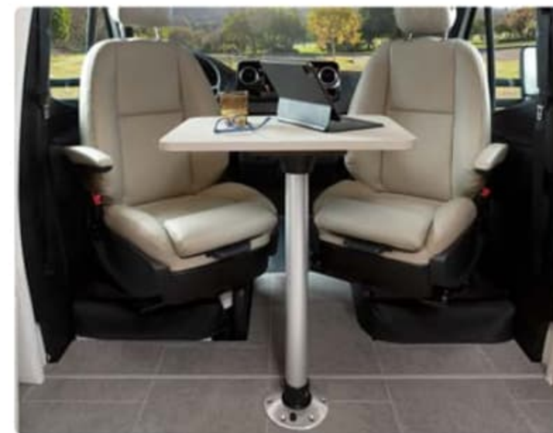
Removable Front Table Between Captain Chairs (MBL, MB, FX, CB)