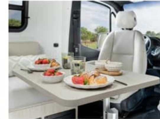
Table Mount System

The 2000-W Pure Sine Wave Inverter provides plenty of capacity for running your 120-V devices, as well as an inverted microwave plug.