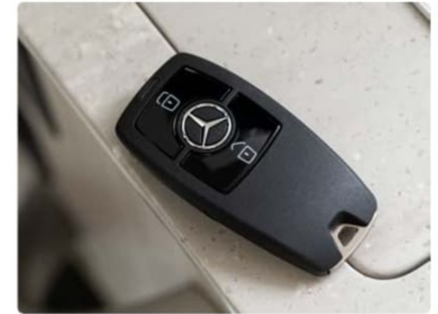
Remote Key Fob Entry Coach Entrance Door