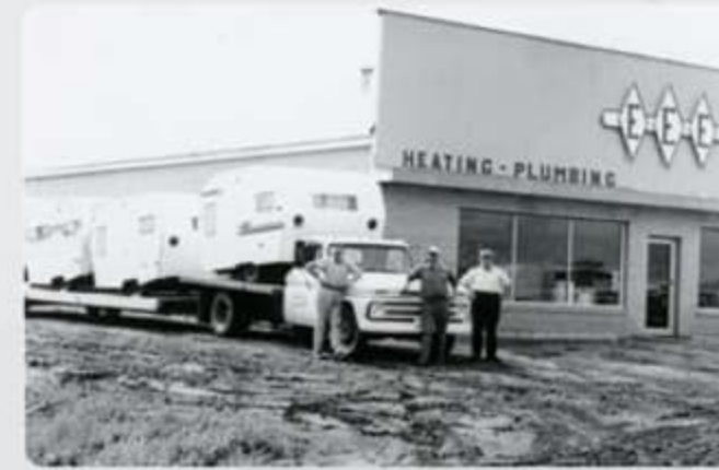
1965 The Beginning Triple E was incorporated on October 17, 1965.

Over 55 years later our vision remains committed to being a premier company. We're inspired by the freedom to explore and driven by a commitment to growing our community of employees, customers, dealers, suppliers, and our local community. May you experience the joy of companionship, surprise and adventure, as the road leads you on your journey ahead.