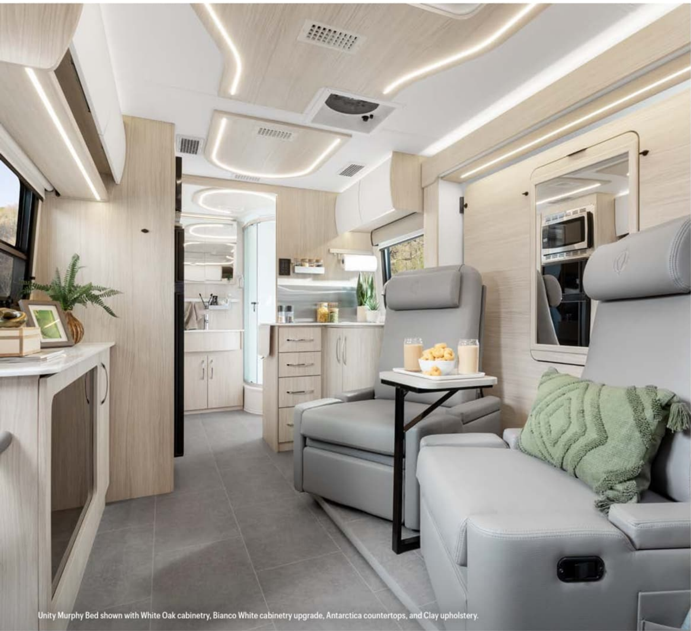
Unity Murphy Bed shown with White Oak cabinetry, Bianco White cabinetry upgrade, Antarctica countertops, and Clay upholstery.