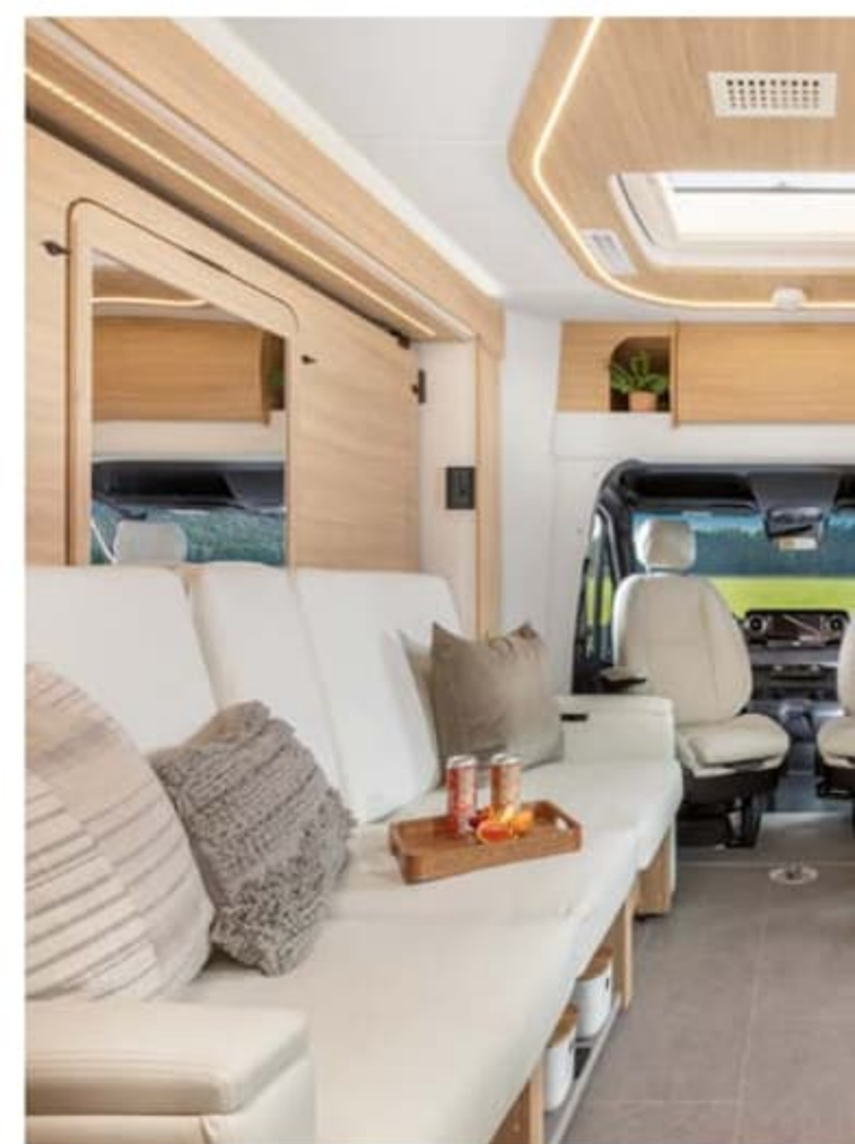
Unity FX shown with Rift Oak cabinetry, Antarctica countertops, and Dove upholstery.