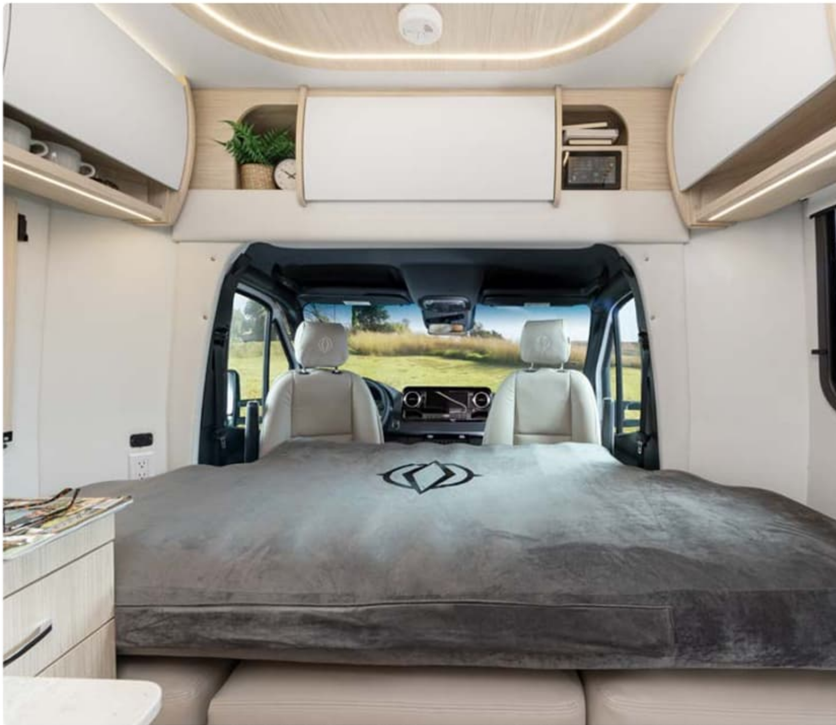
Inflatable Bed for Front Dinette 45" x 88" Sleeping Area (RL, TB)