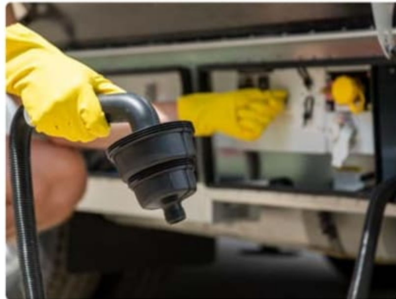
Macerator Sewage Discharge With Manual Disconnect