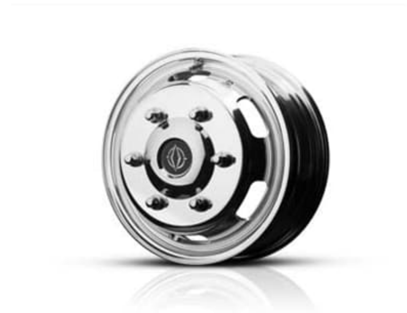
Alcoa Dura-Bright® Aluminum Wheels All 6 Aluminum Wheels, 4 Dura-Bright® Wheels