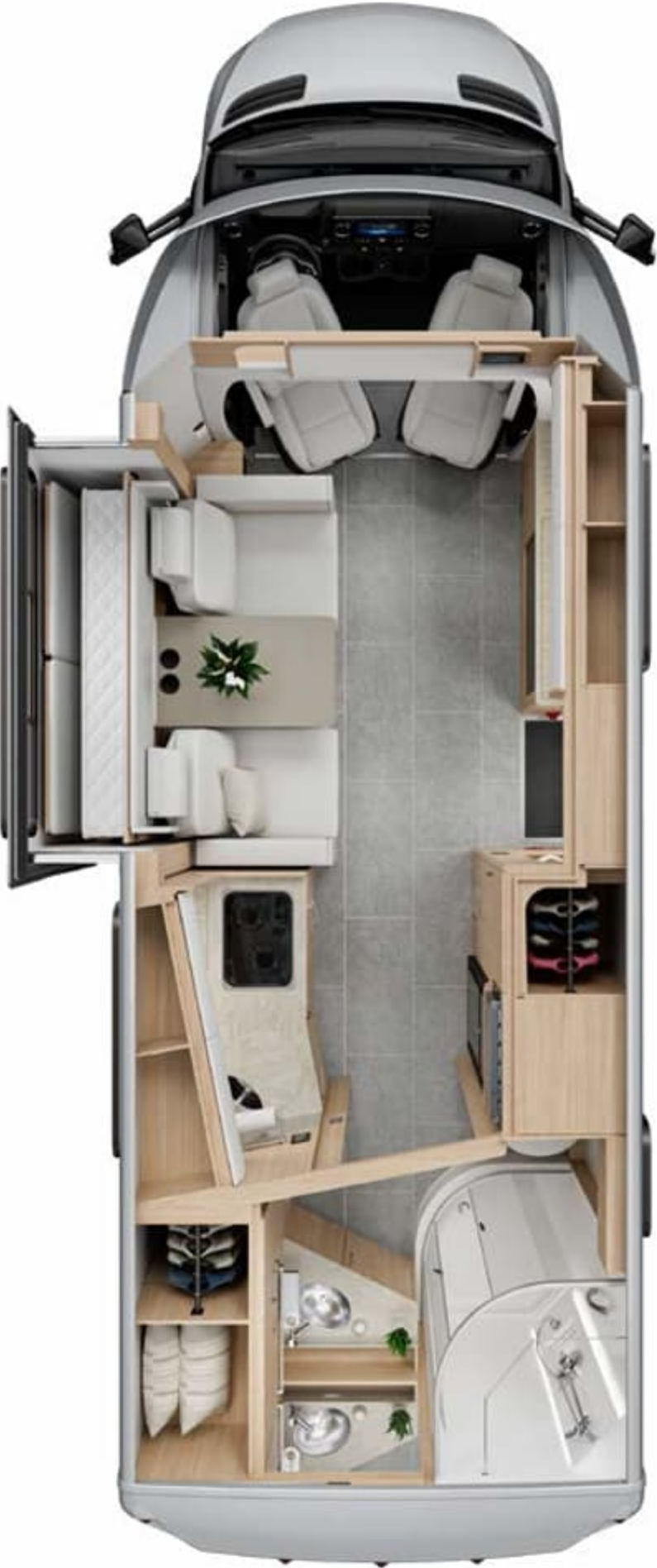
Murphy Bed Lounge | U24MBL