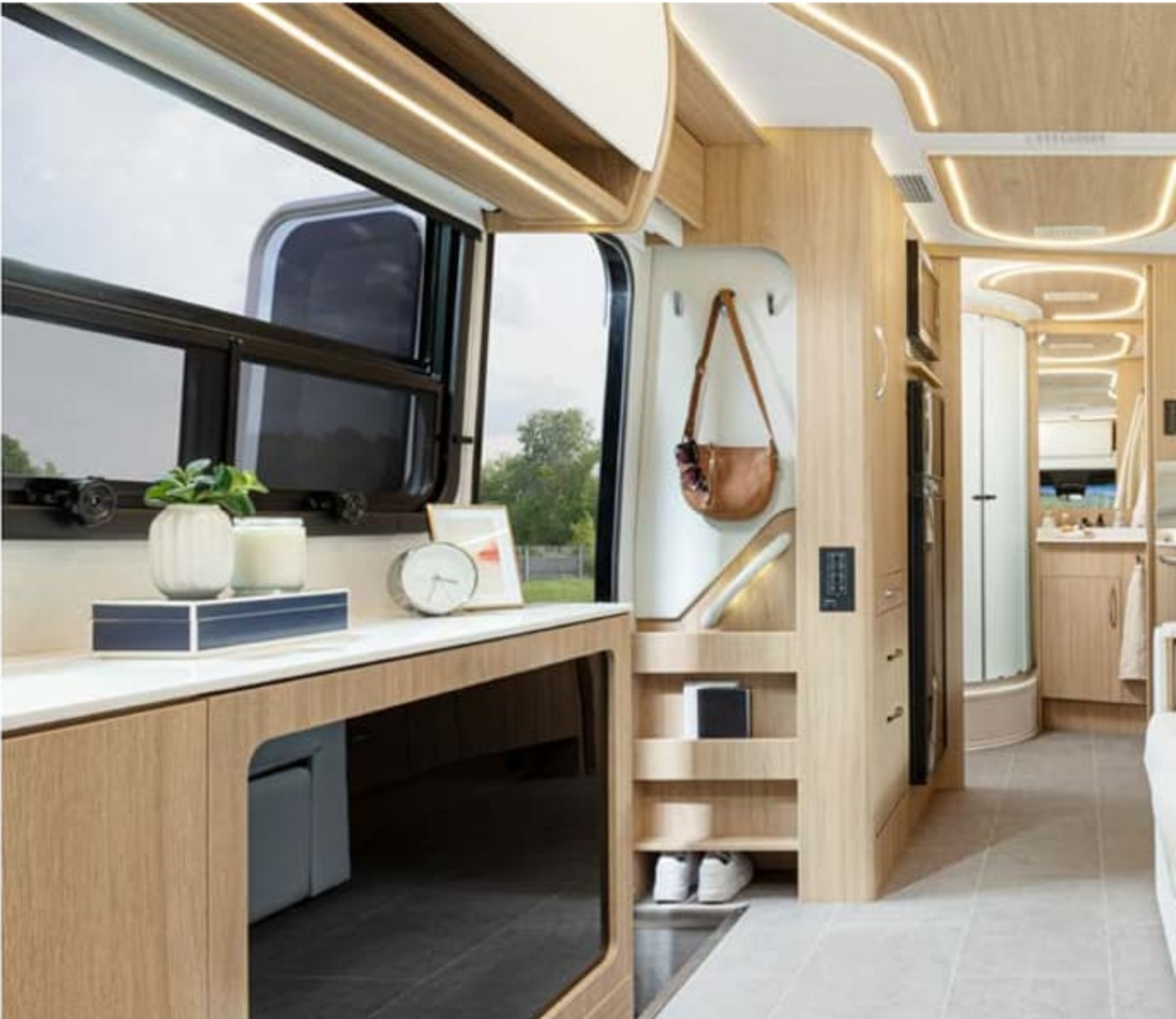
Rift Oak shown with Bianco White FENIX® Cabinetry Upgrade