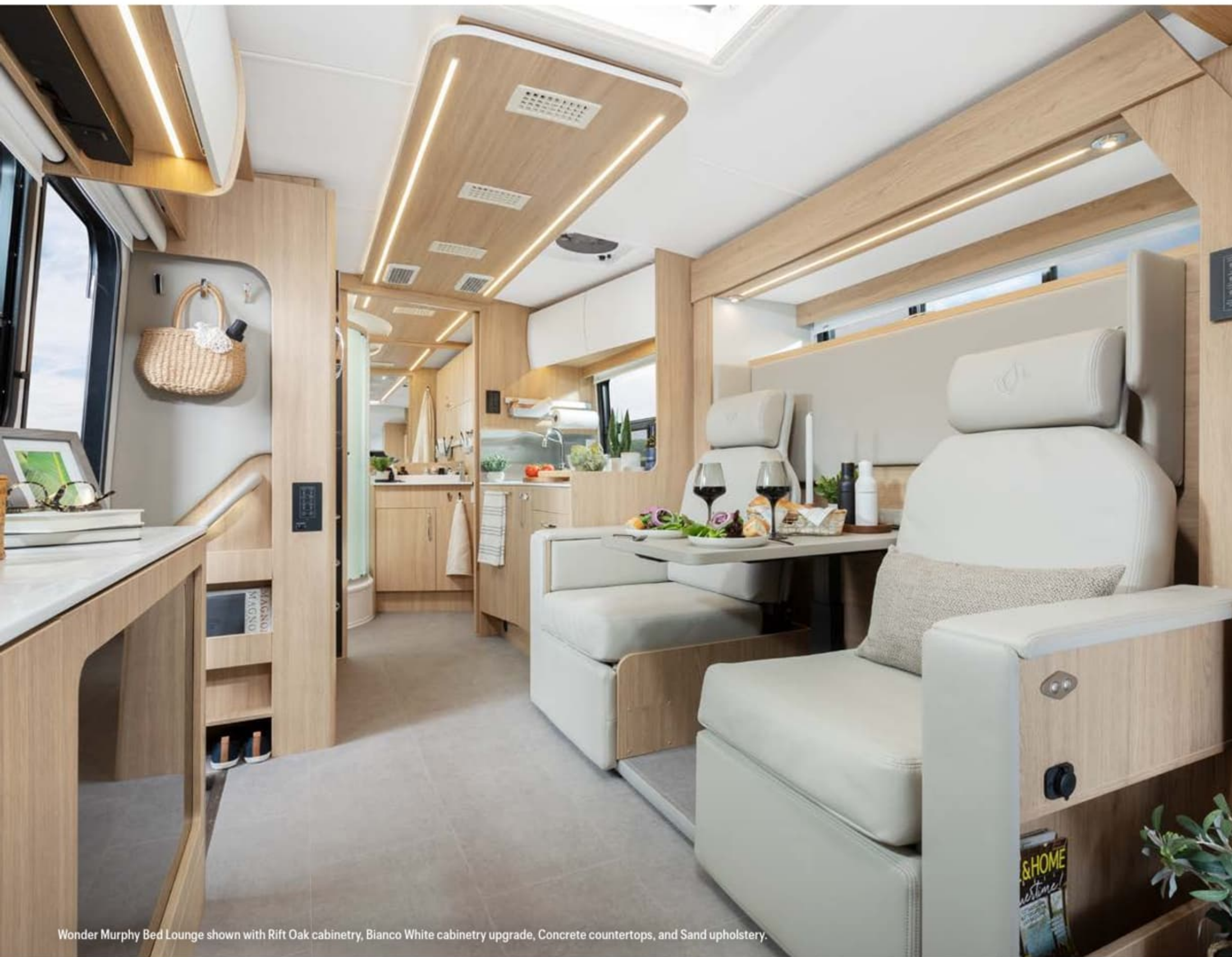
Wonder Murphy Bed Lounge shown with Rift Oak cabinetry, Bianco White cabinetry upgrade, Concrete countertops, and Sand upholstery.