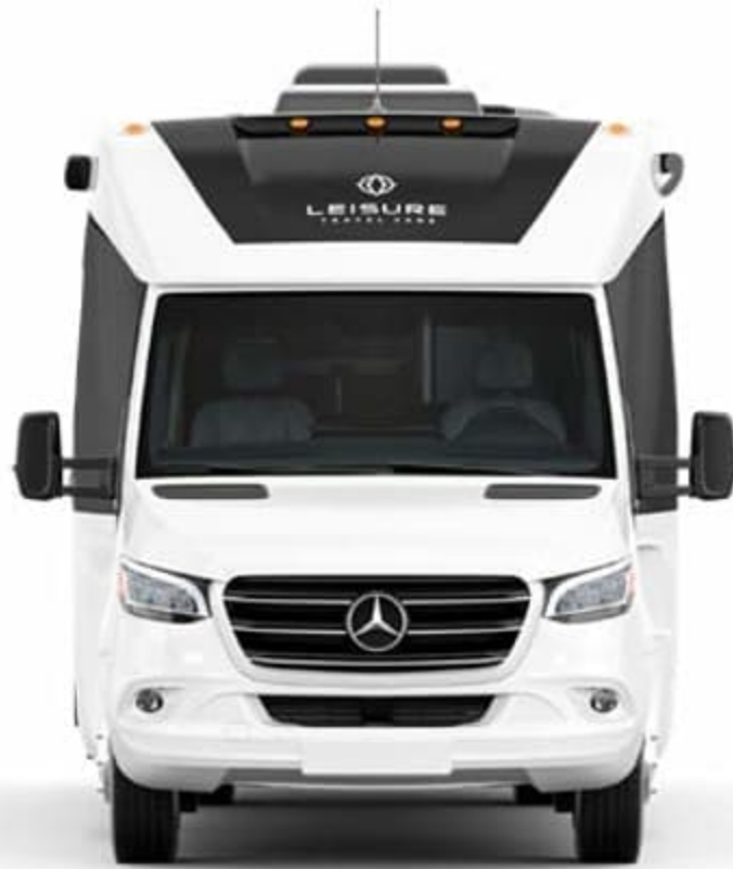
Width: 7' 11" (2,416 mm)