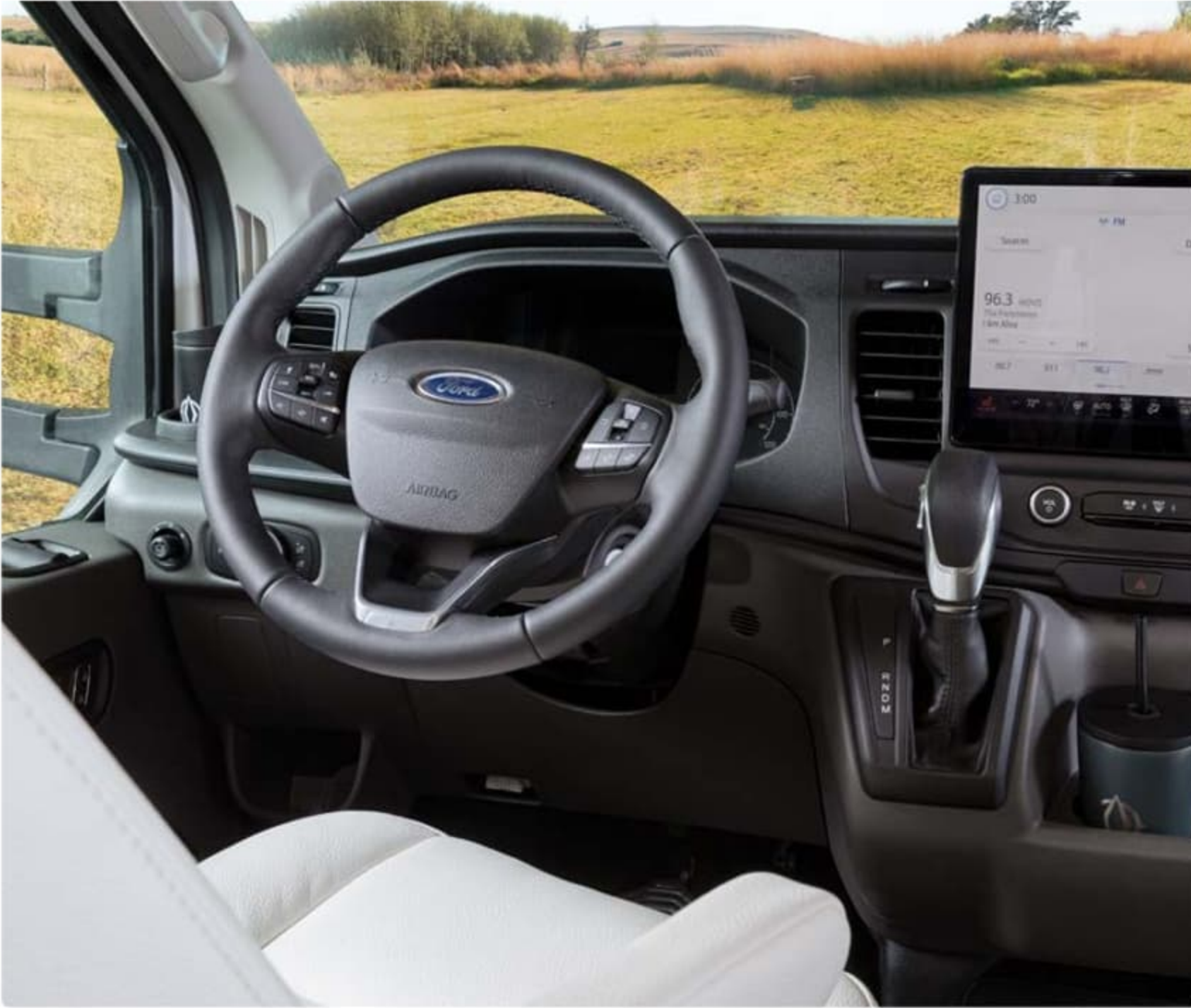
Ford Transit Chassis with Intelligent All-Wheel Drive