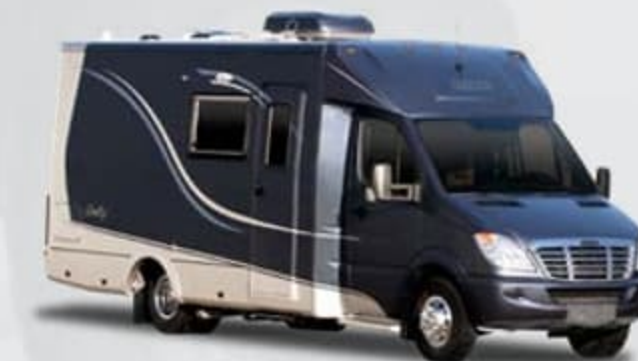
2009 An Industry First Triple E launched the Unity by Leisure Travel Vans – the industry's first Class C motorhome with a queen size Murphy bed built on a Mercedes-Benz chassis. The Unity quickly became recognized as one of Triple E's most innovative product introductions.