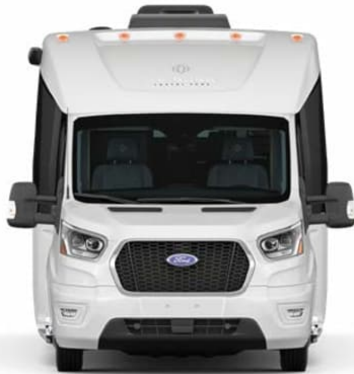
Width: 7' 11" (2,416mm)