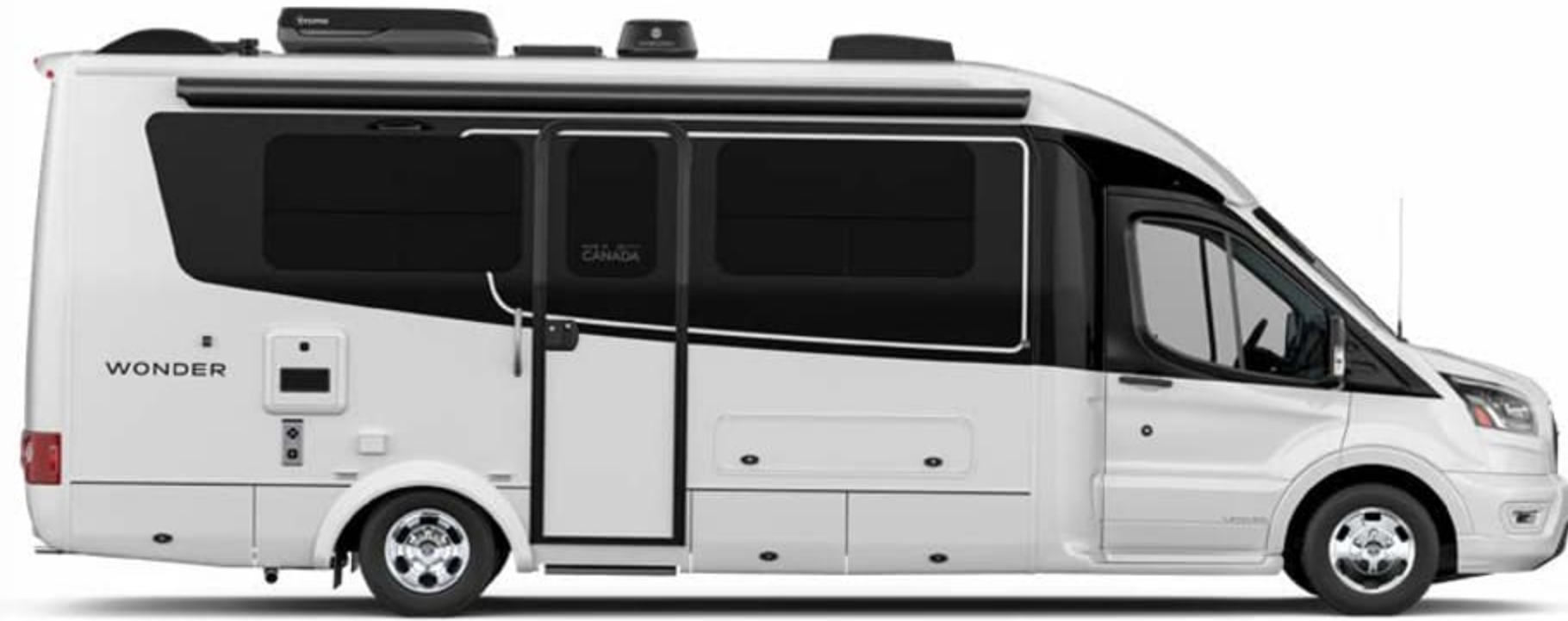
Wheelbase: 178" (4,522 mm)