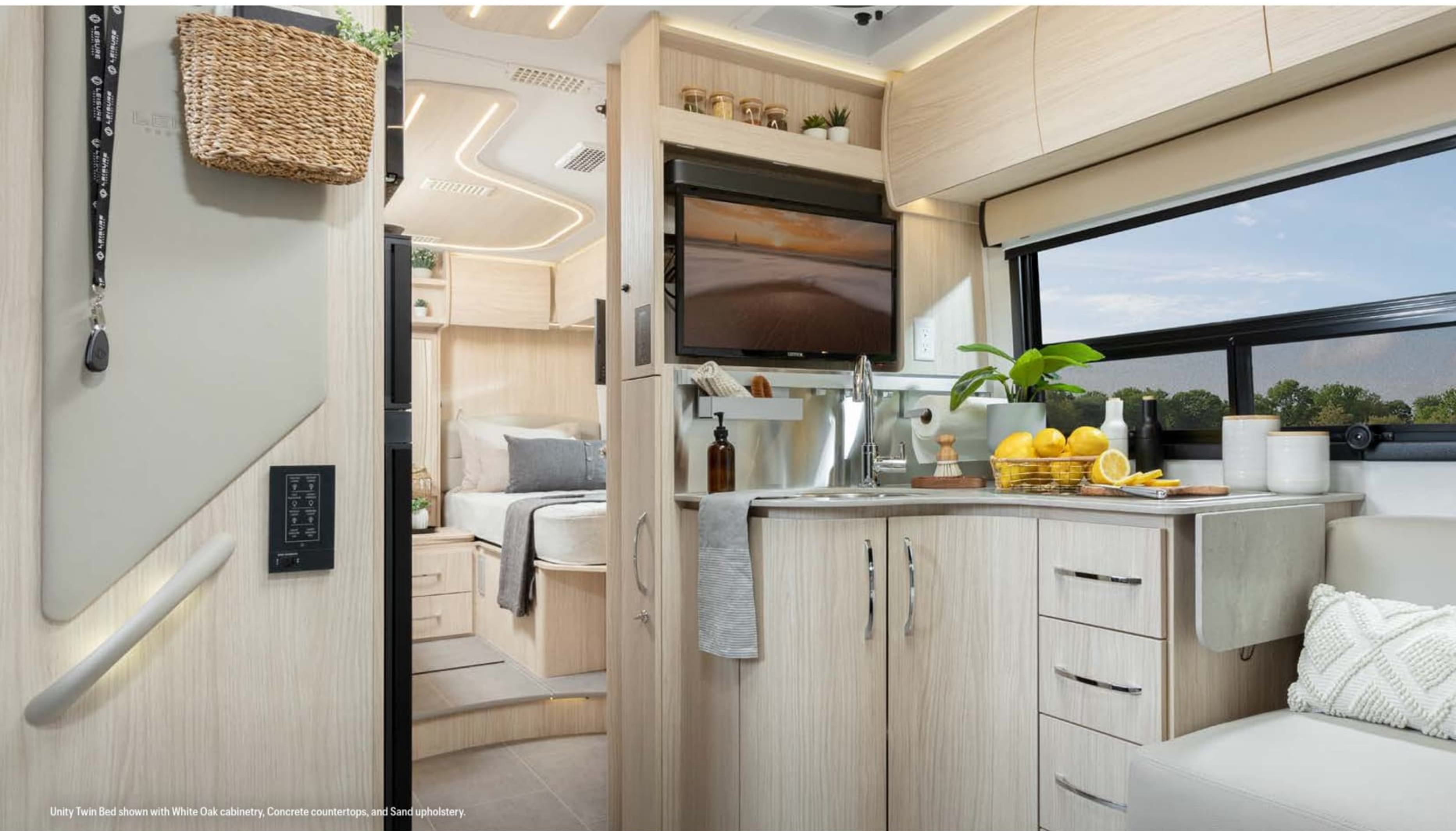
Unity Twin Bed shown with White Oak cabinetry, Concrete countertops, and Sand upholstery.