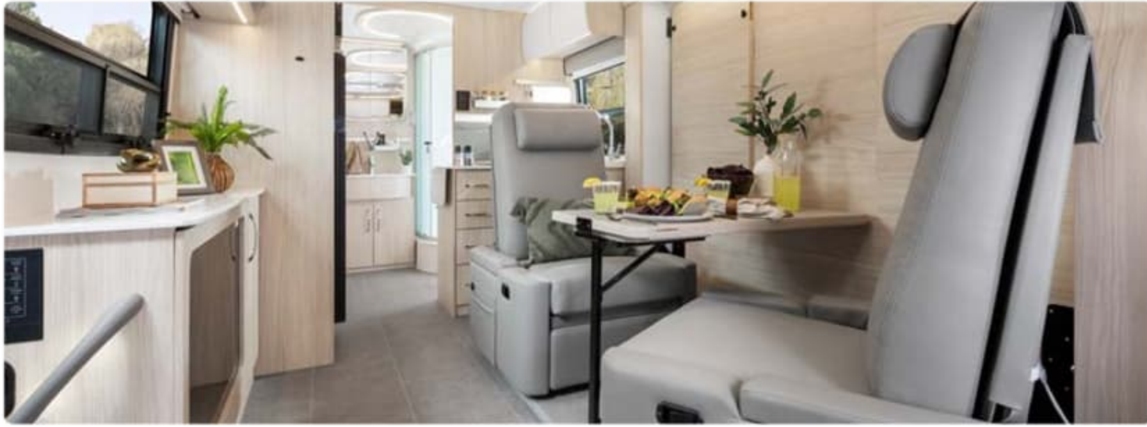
Leisure Lounge System Plus Dinette System 2 Ultrafabrics® Rotating Power Recliners (MB)