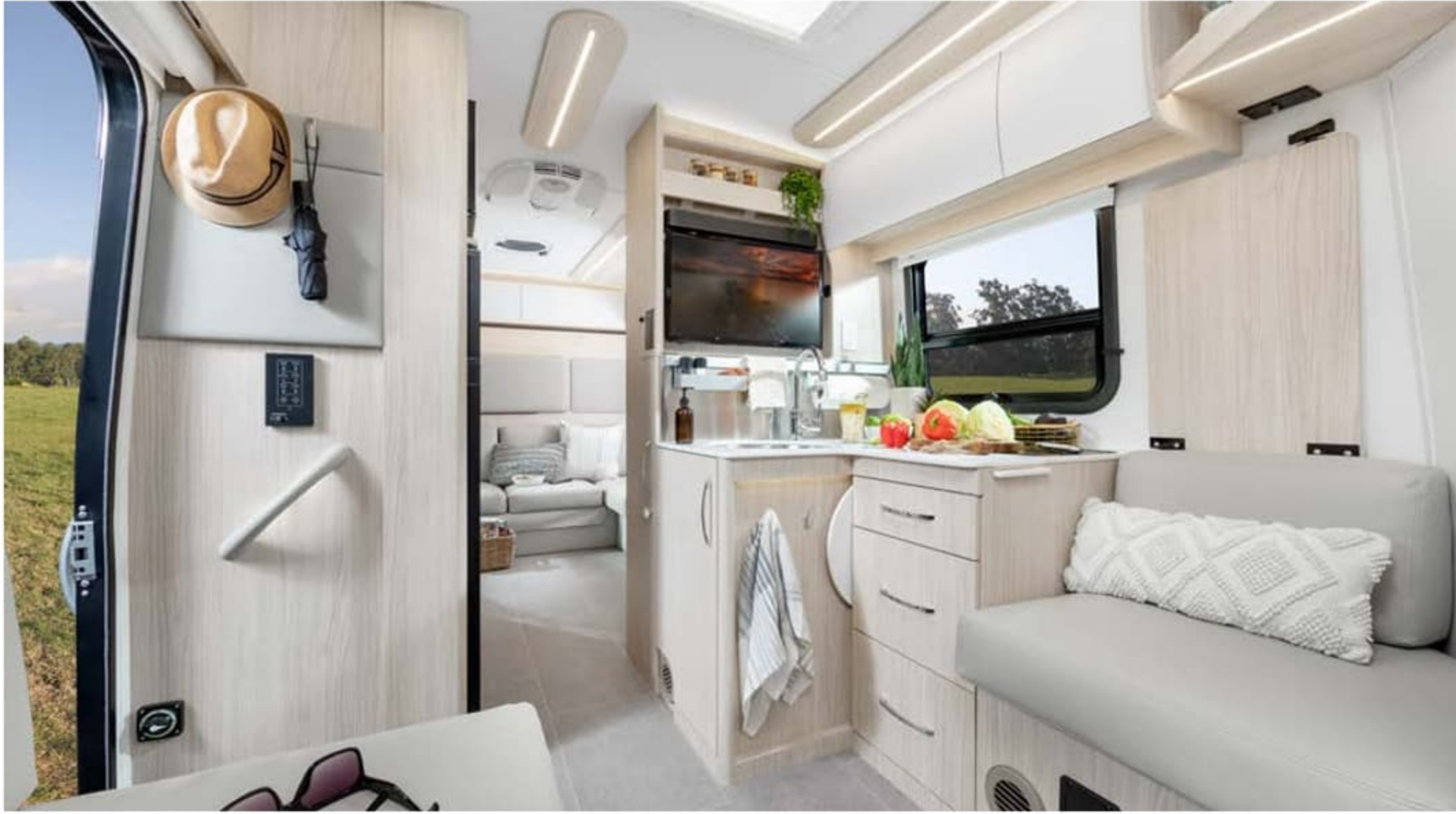
White Oak shown with Bianco White FENIX® Cabinetry Upgrade