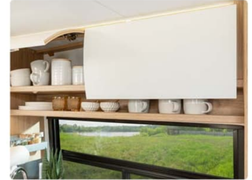
Cabinetry Upgrade FENIX® Matte Overhead Cabinet Doors