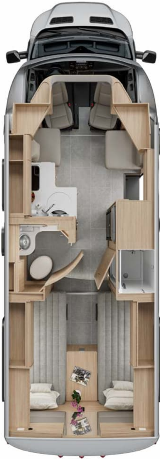
Rear Twin Bed | W24RTB