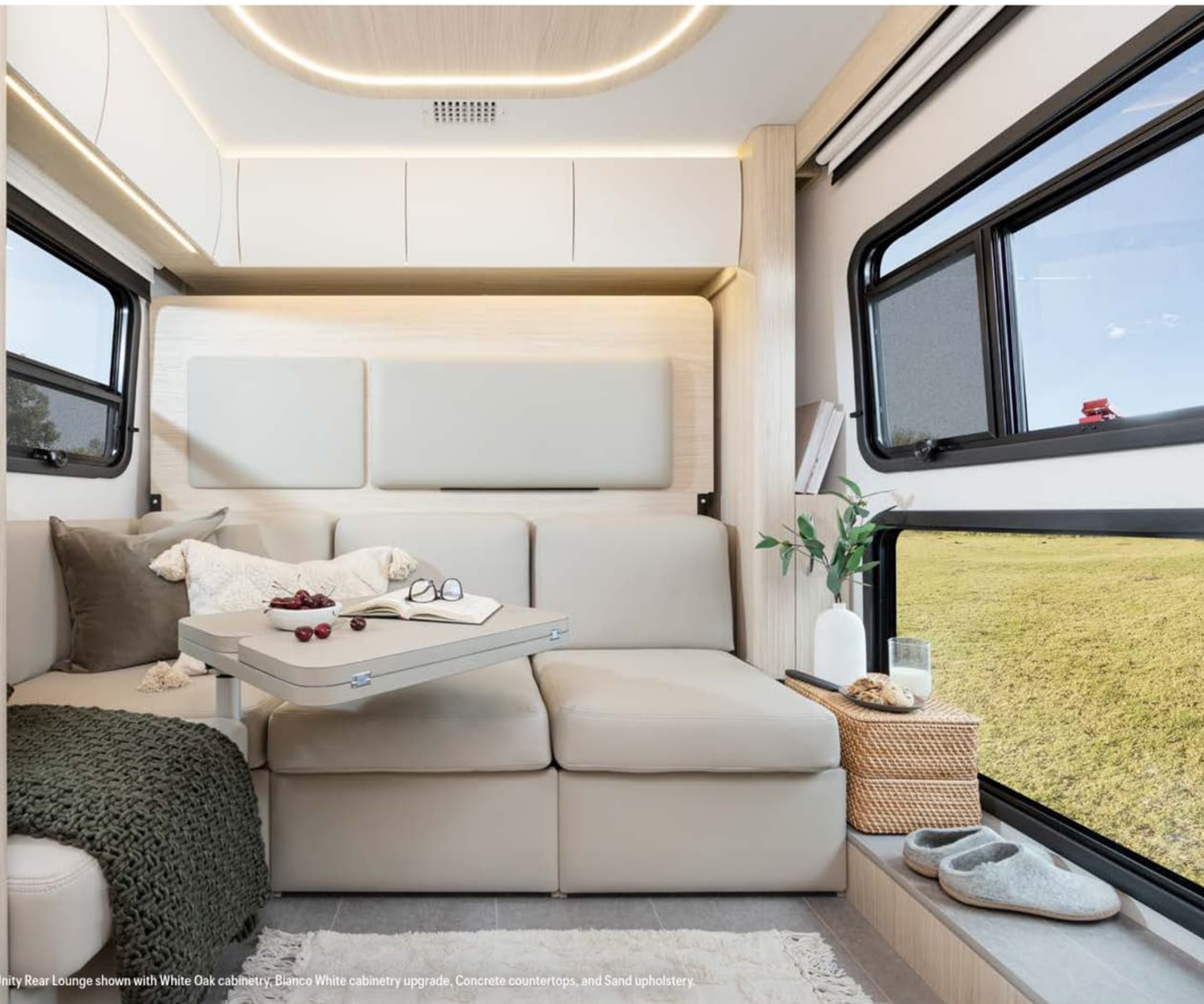
Unity Rear Lounge shown with White Oak cabinetry, Bianco White cabinetry upgrade, Concrete countertops, and Sand upholstery.