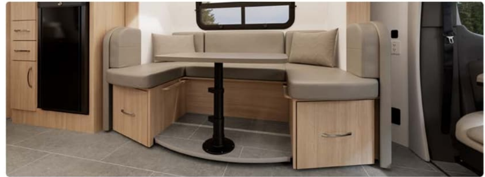
U-Lounge Dinette with Easy Lift Table Ultrafabrics® 40" x 69" Sleeping Area (CB)