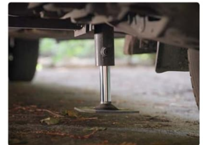
4-Point Self-Leveling Jacks