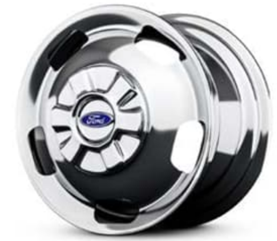
Aluminum Alloy Wheels Standard