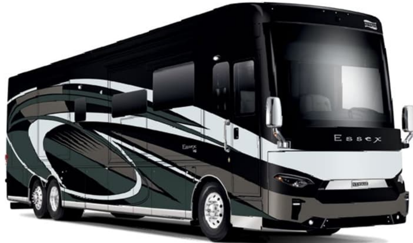
Awning Color: Charcoal Tweed