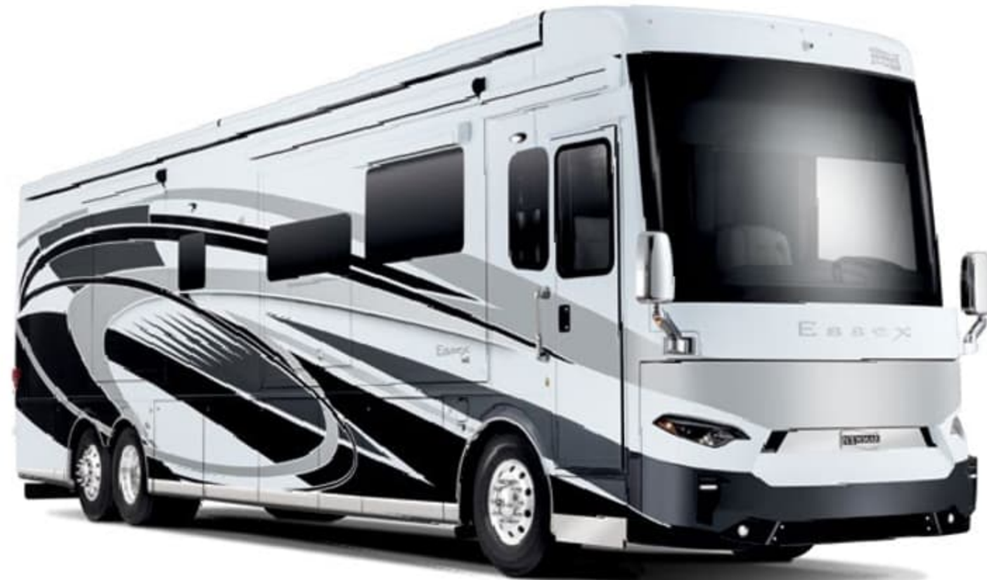
Awning Color: Charcoal Tweed