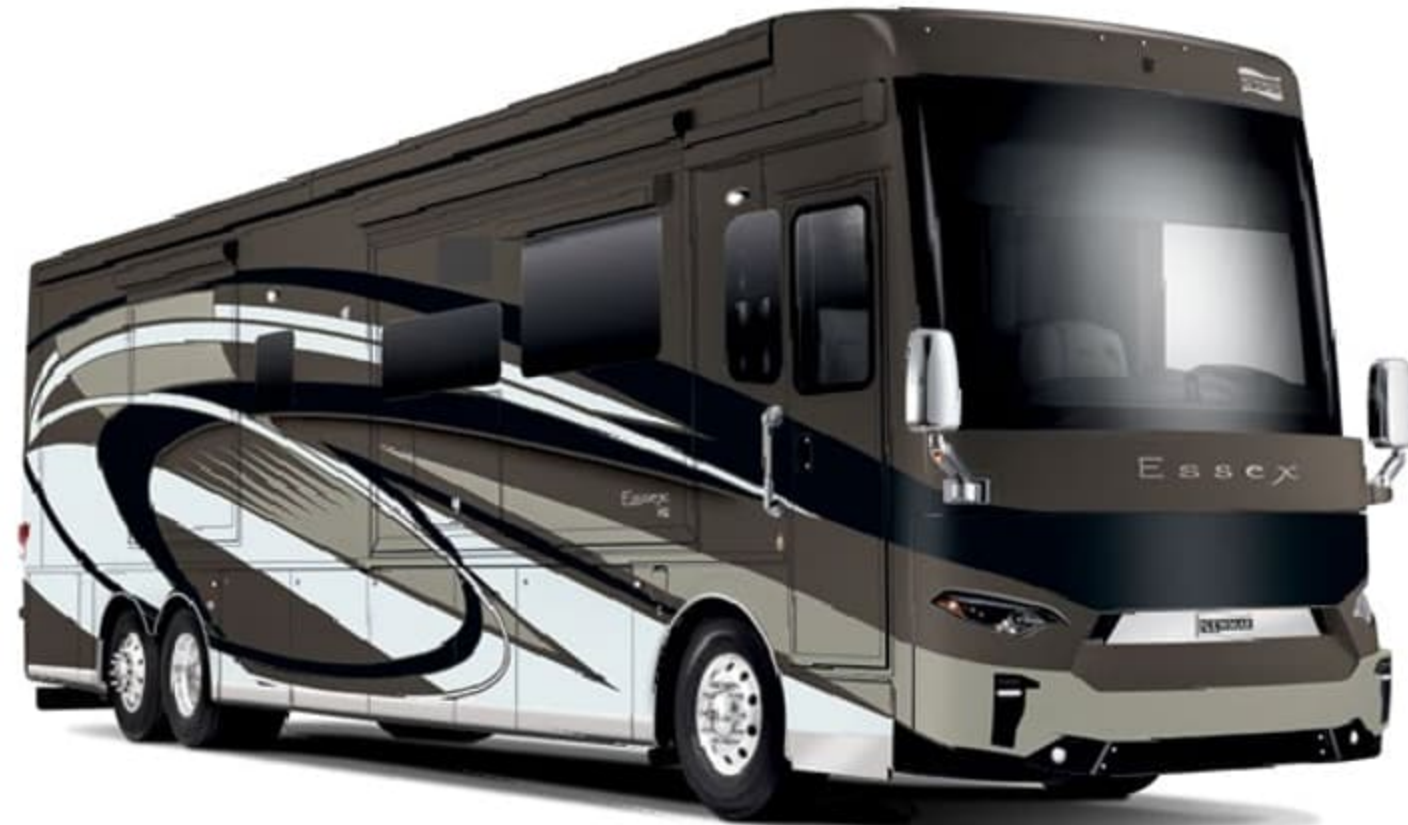
Awning Color: Charcoal Tweed