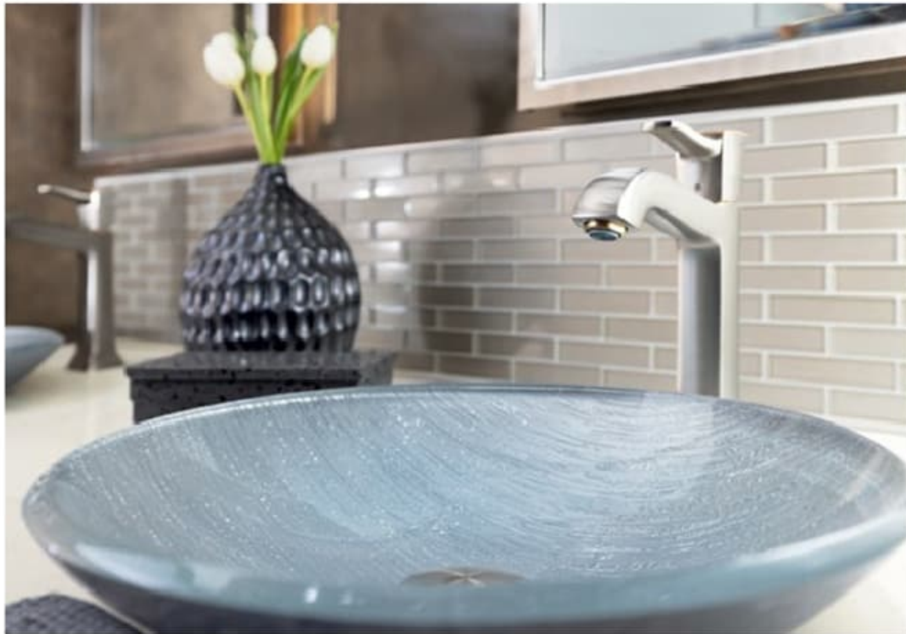
*No matching interior décor for Versailles