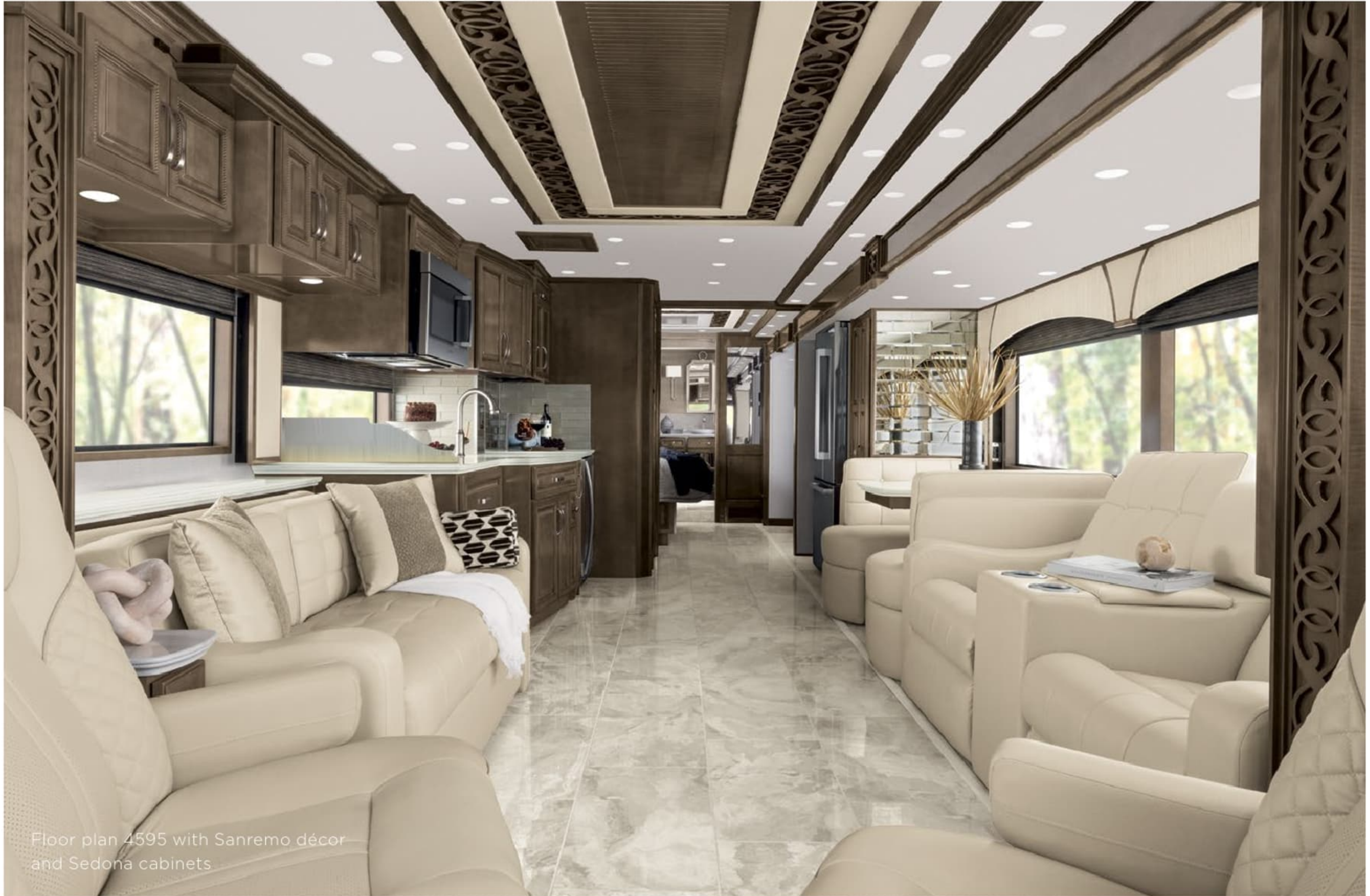
Floor plan 4595 with Sanremo décor and Sedona cabinets