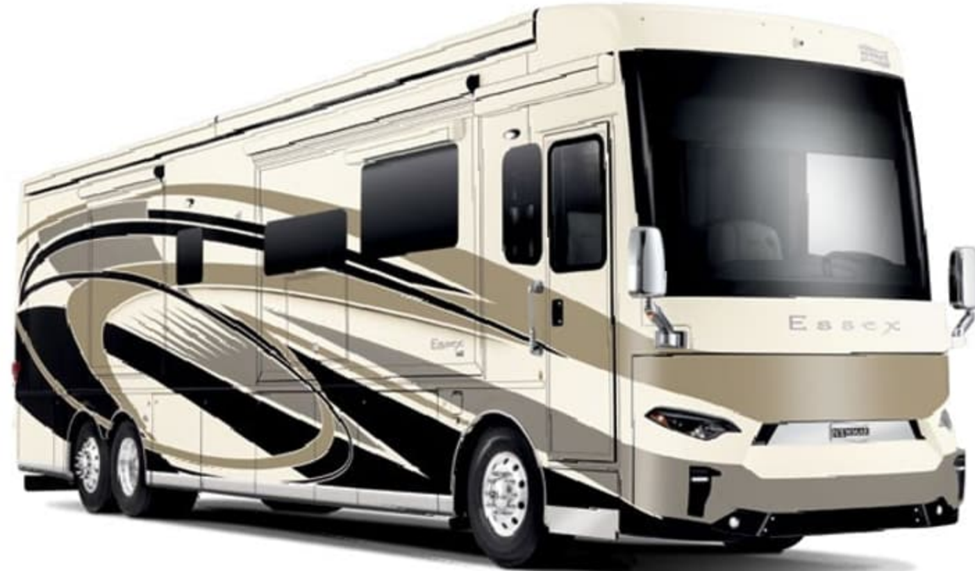
Awning Color: Linen Tweed