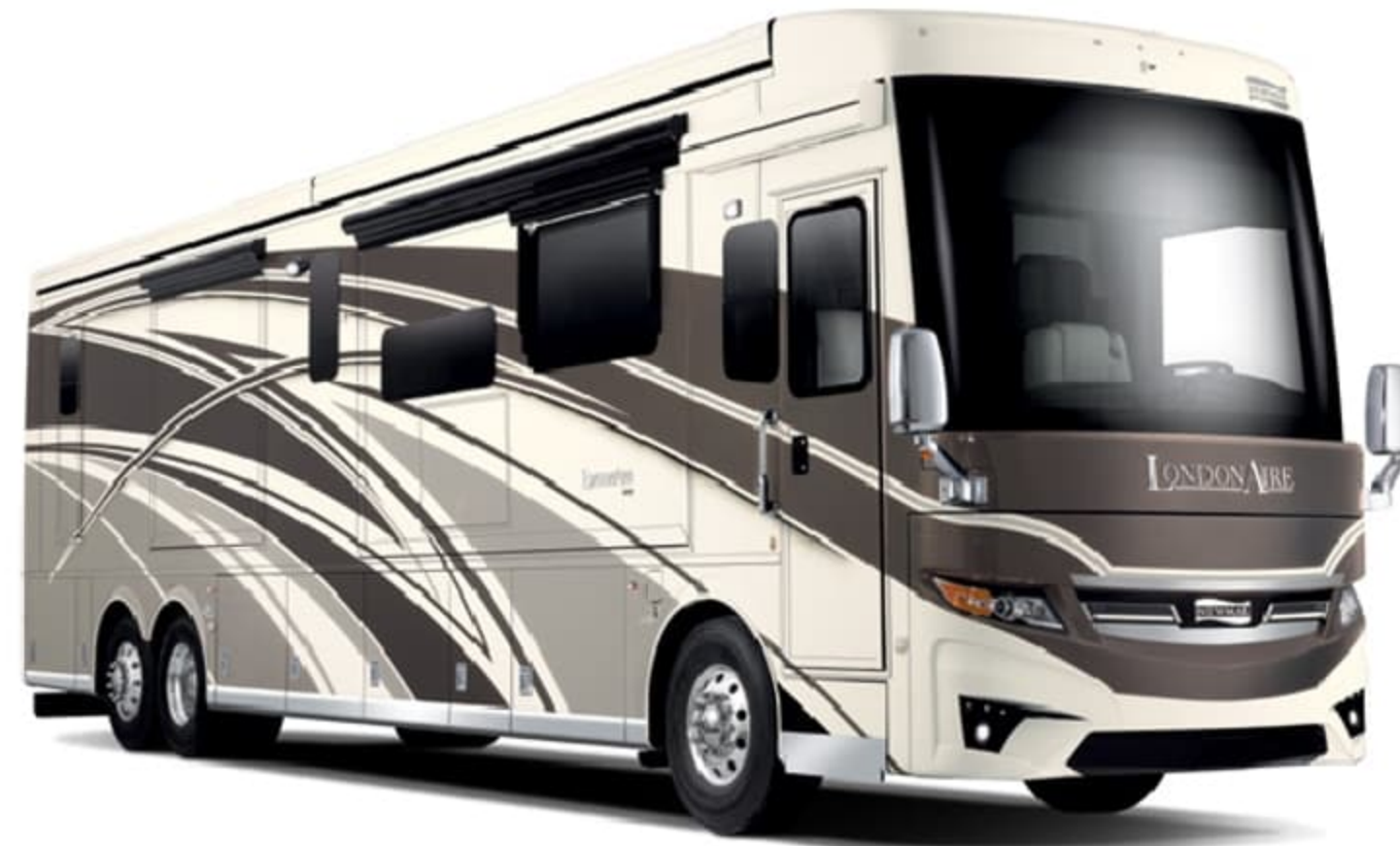
Awning Color: Linen Tweed