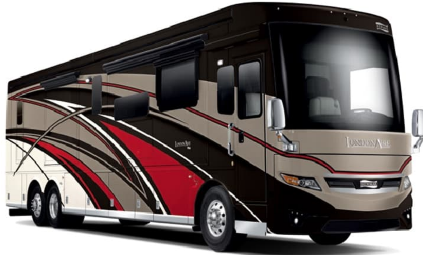
Awning Color: Charcoal Tweed