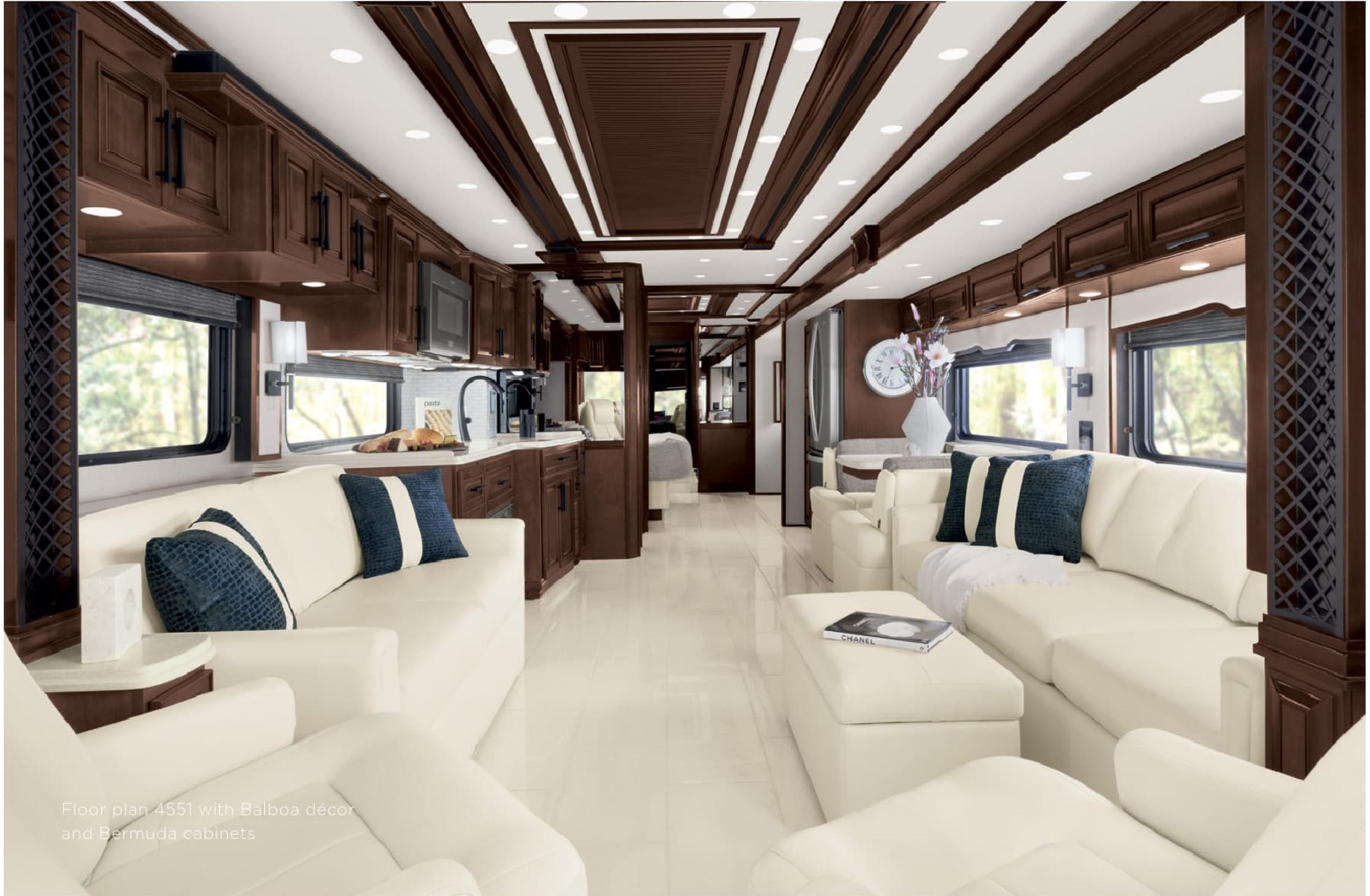
Floor plan 4551 with Balboa décor and Bermuda cabinets