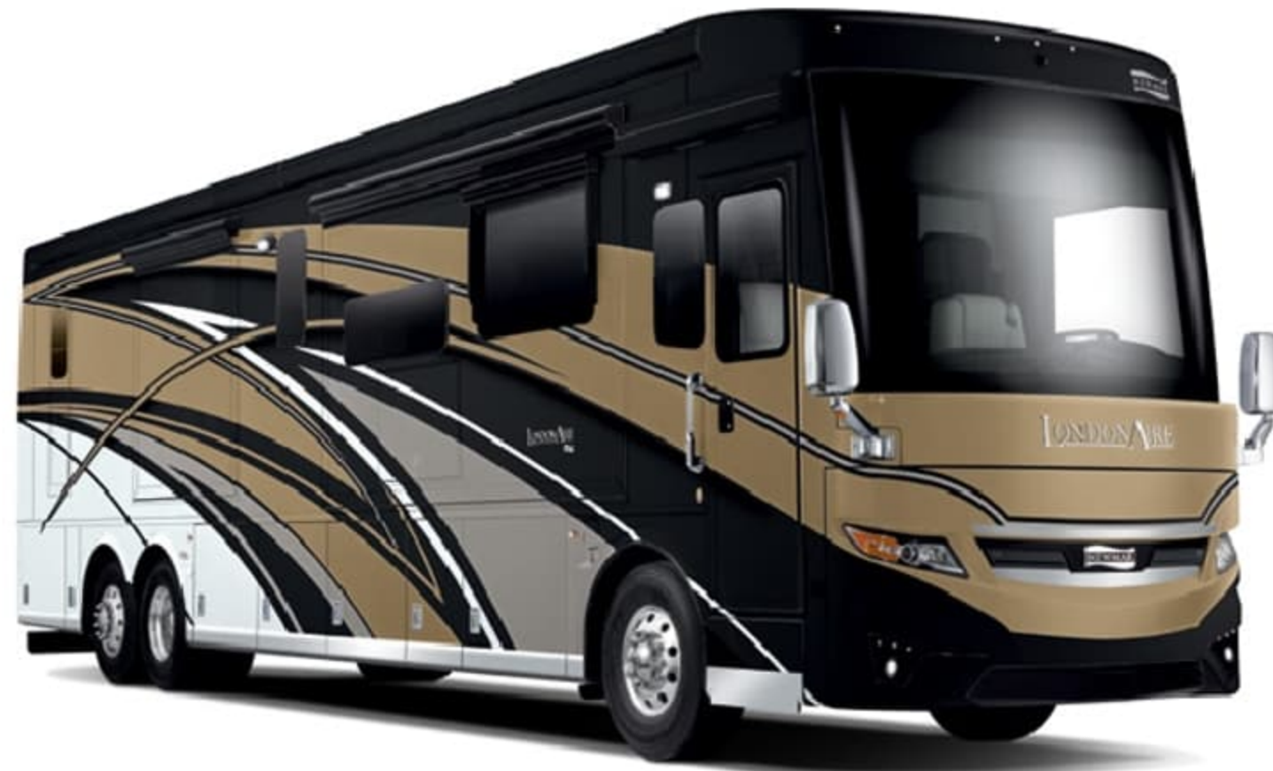
Awning Color: Charcoal Tweed