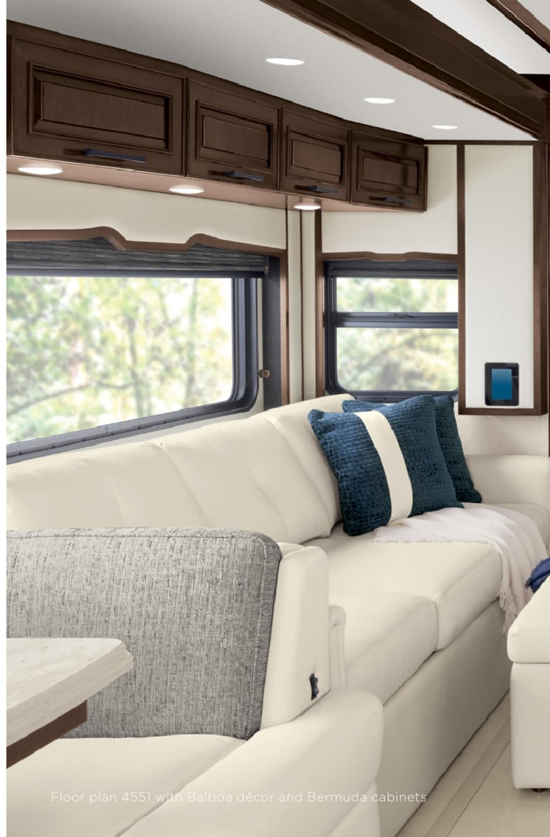
Floor plan 4551 with Balboa décor and Bermuda cabinets

WiFiRanger Denali System with Spruce Router