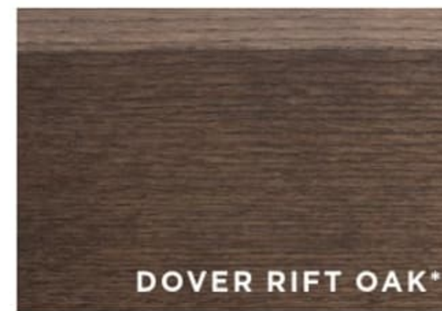
DOVER RIFT OAK*