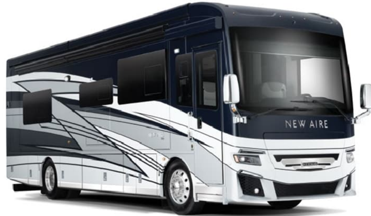
Awning Color: Charcoal Tweed