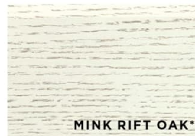
MINK RIFT OAK*