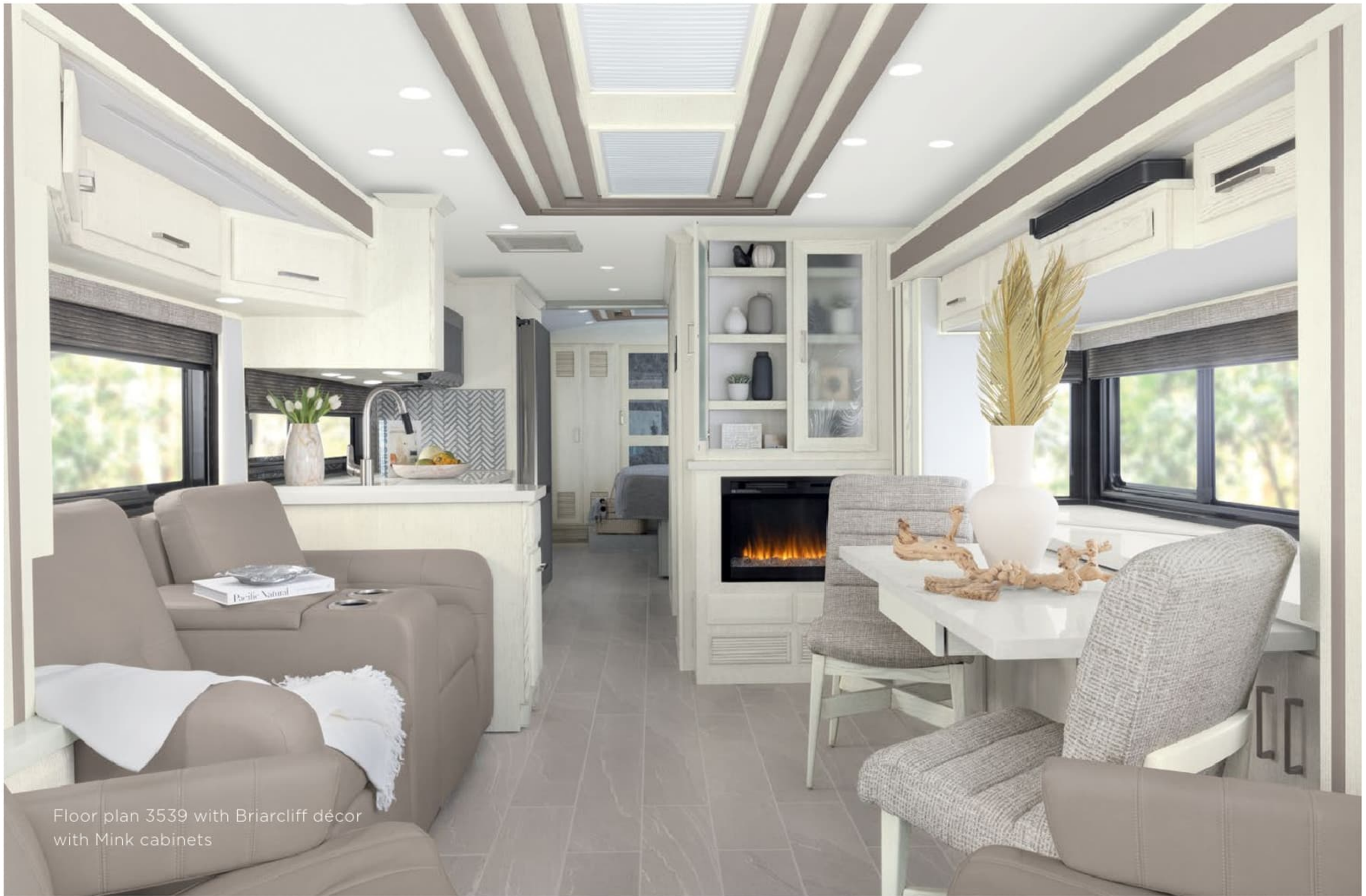
Floor plan 3539 with Briarcliff décor with Mink cabinets