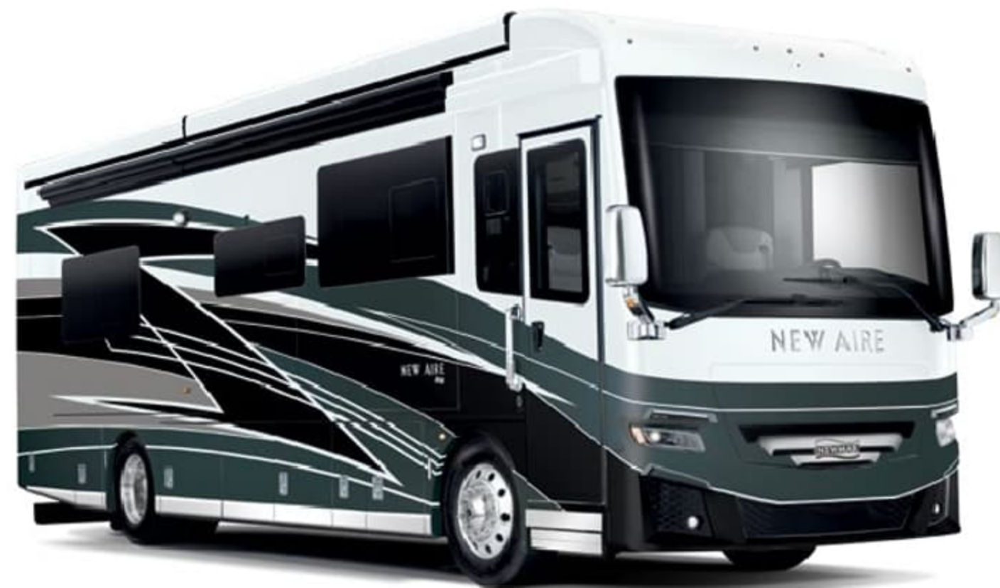
Awning Color: Charcoal Tweed