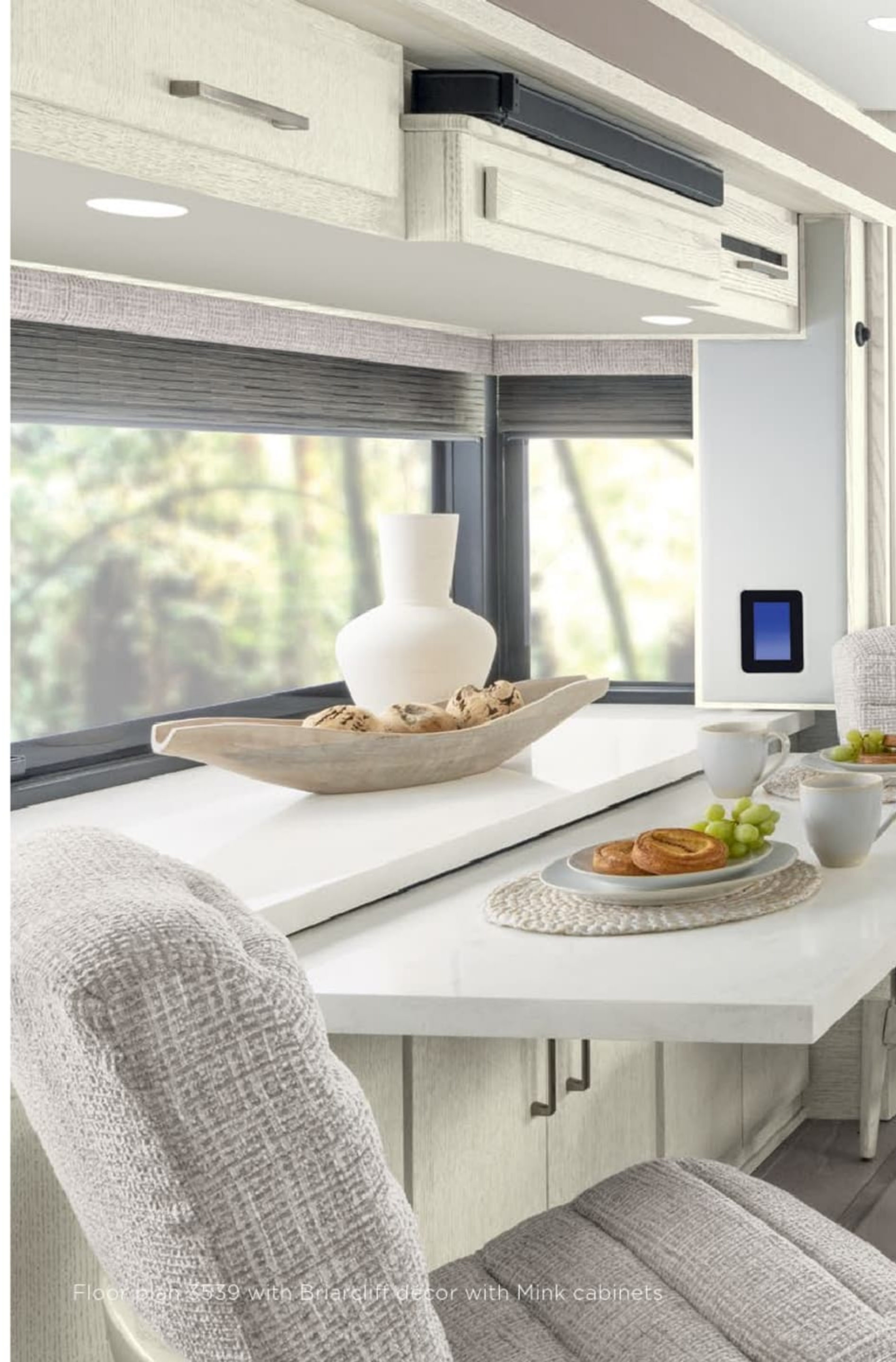
Floor plan 3539 with Briarcliff decor with Mink cabinets