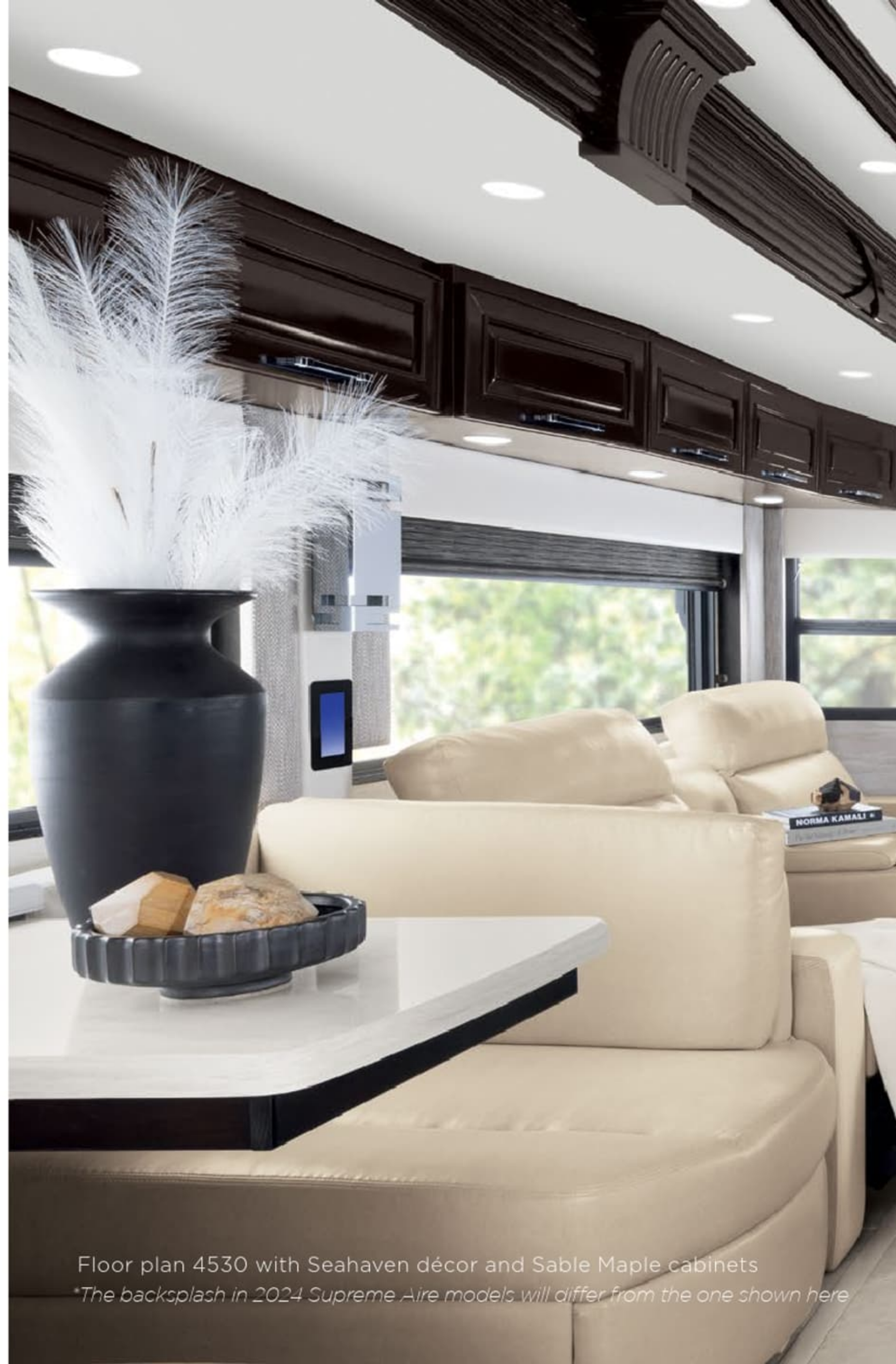
Floor plan 4530 with Seahaven décor and Sable Maple cabinets