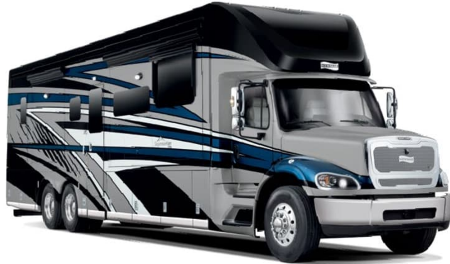
Awning Color: Charcoal Tweed