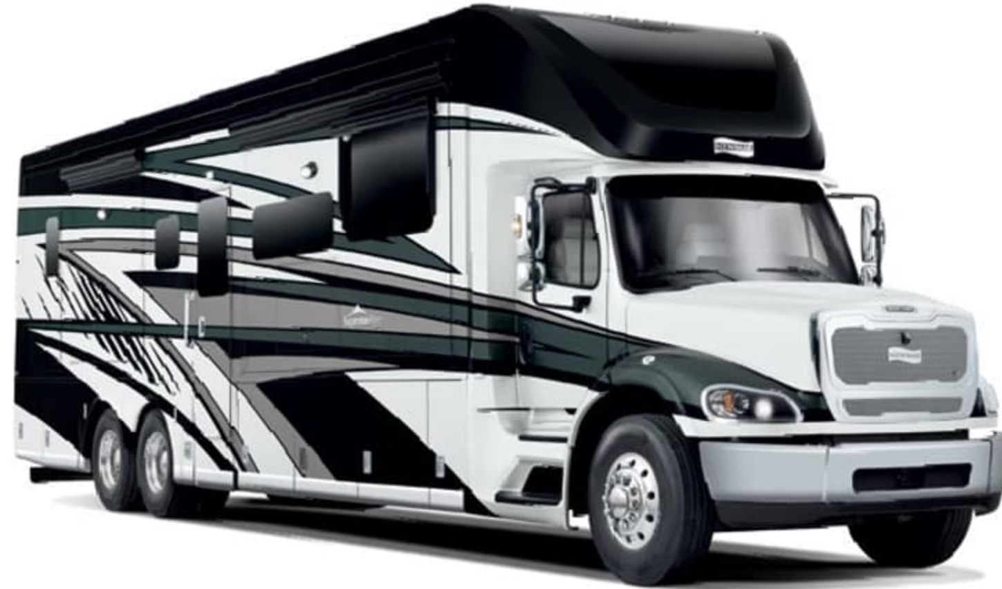
Awning Color: Charcoal Tweed