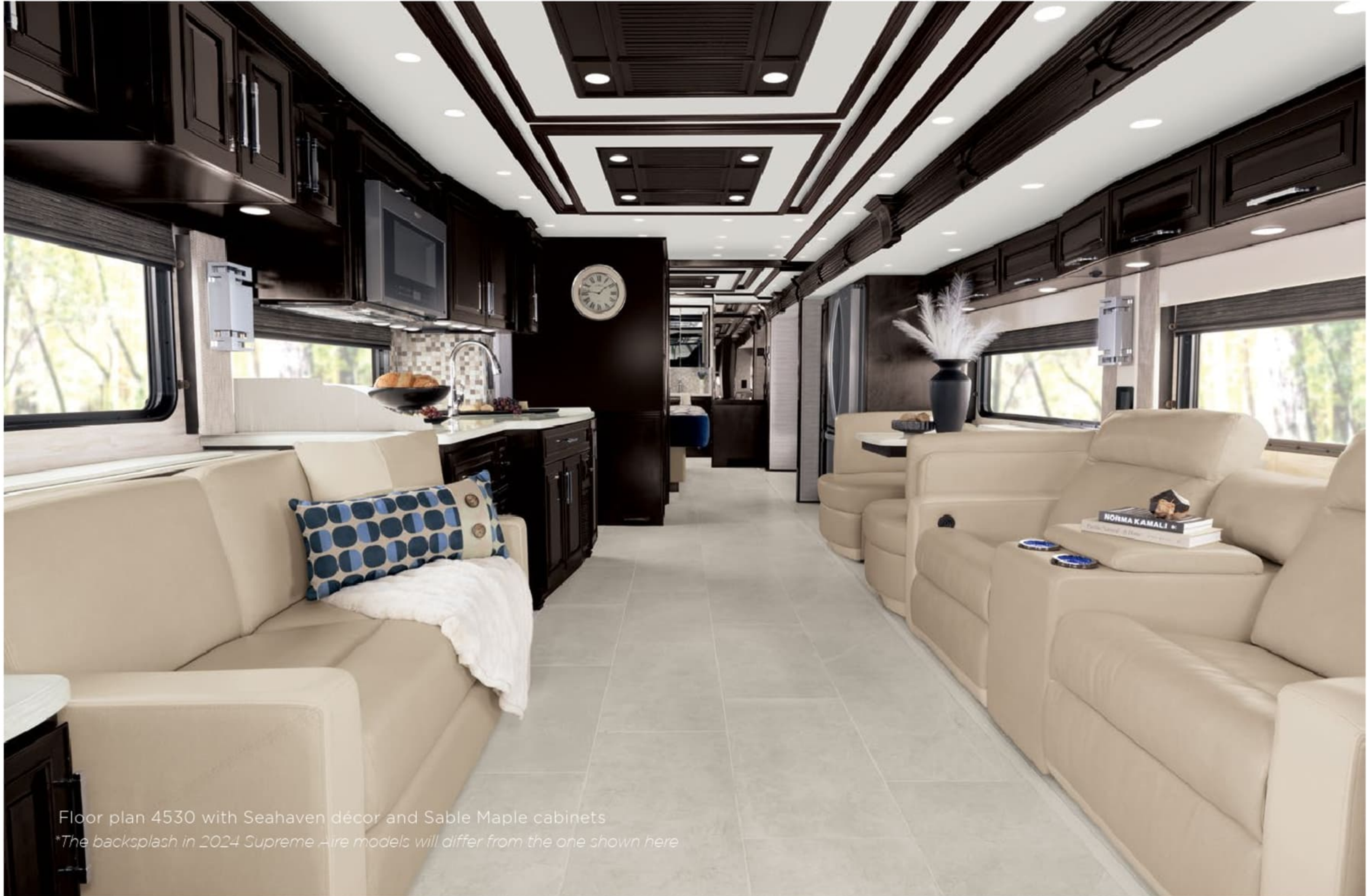
Floor plan 4530 with Seahaven décor and Sable Maple cabinets *The backsplash in 2024 Supreme Aire models will differ from the one shown here