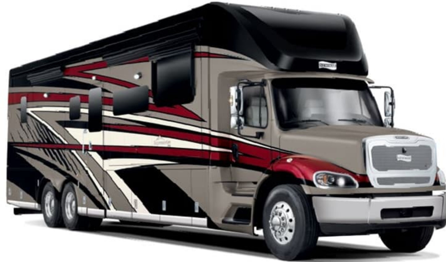
Awning Color: Charcoal Tweed