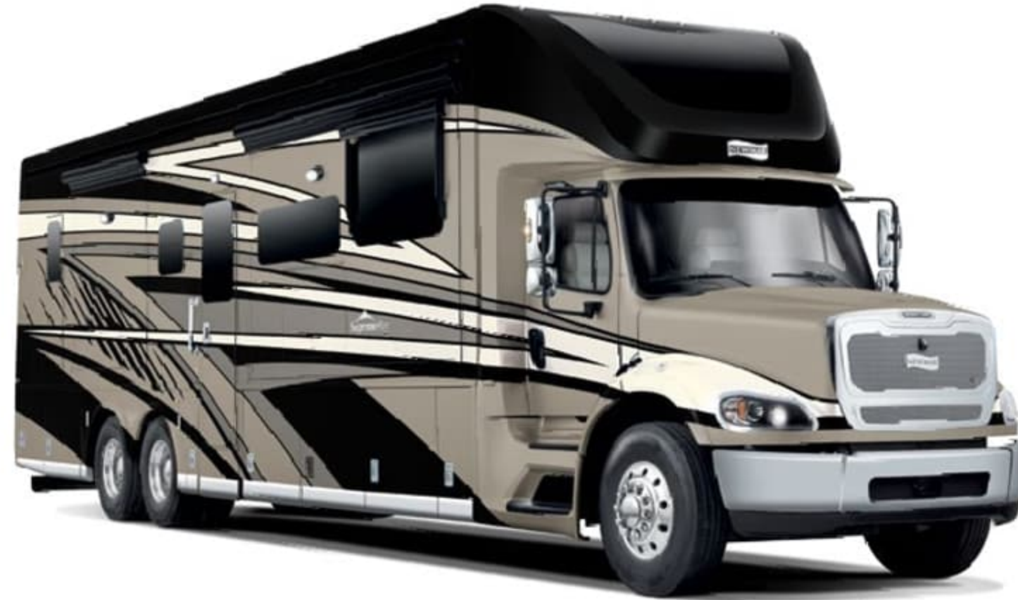
Awning Color: Linen Tweed