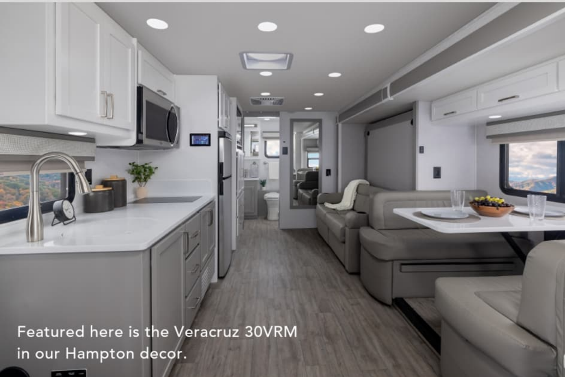
Featured here is the Veracruz 30VRM in our Hampton decor.