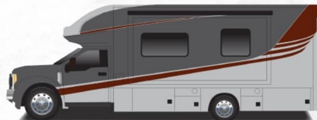
RED ROCK CANYON