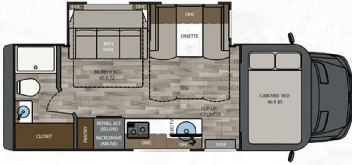
25RMC | 25' MURPHY BED W/ CABOVER BUNK