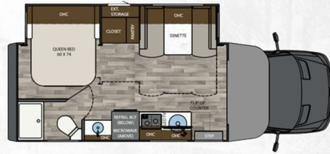
25FWS | 25' FULL WALL SLIDE W/ CABOVER STORAGE