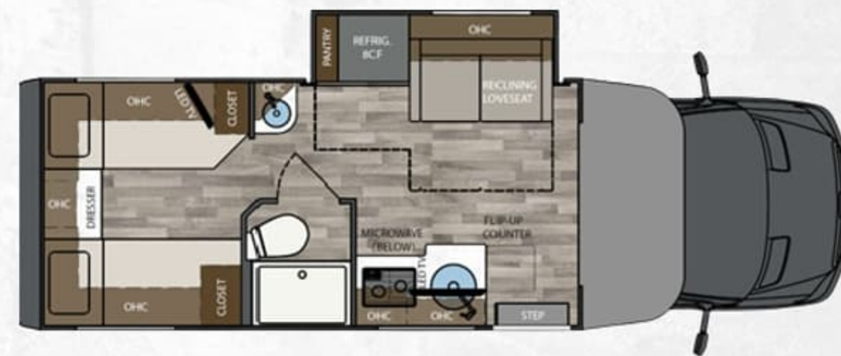
25TBN | 25' TWIN BEDS W/ CABOVER STORAGE