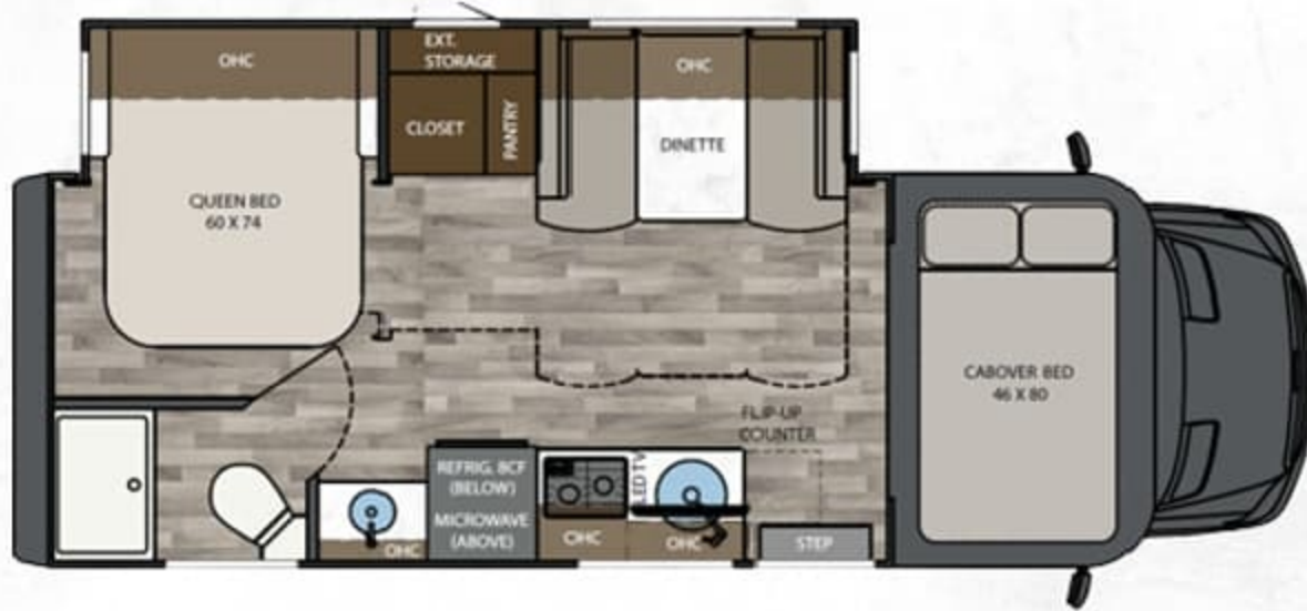
25FWC | 25' FULL WALL SLIDE W/ CABOVER BUNK