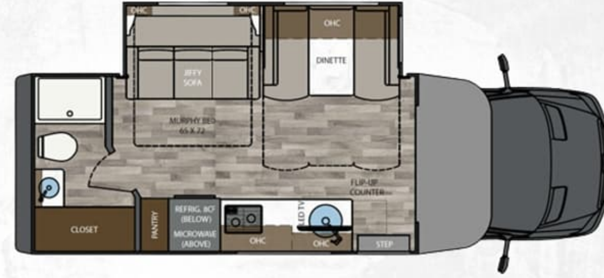
25RML | 25' MURPHY BED W/ CABOVER STORAGE