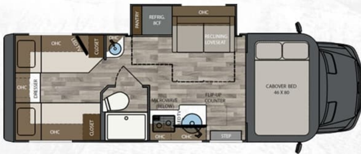
25TBC | 25' TWIN BEDS W/ CABOVER BUNK