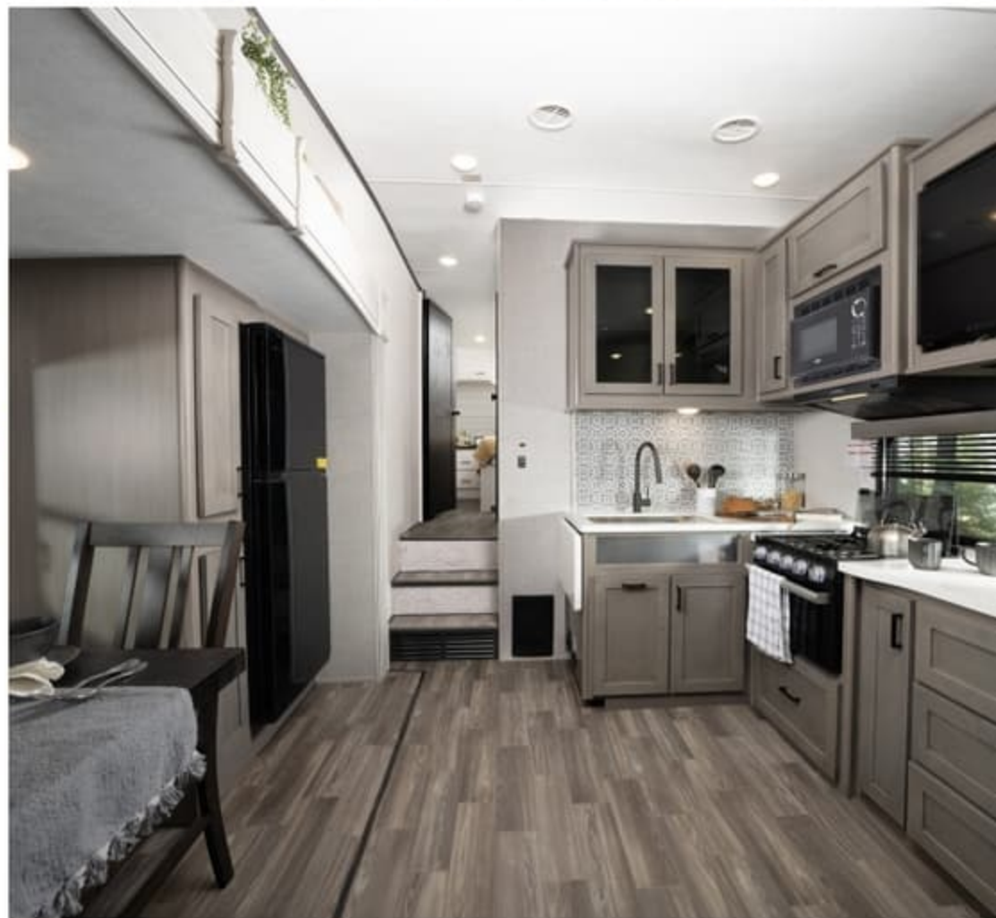
2024 Starcraft GSL LD FW 234RLS