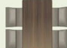
TABLE & CHAIRS/BENCH OPTION