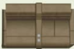
THEATER SEAT OPTION