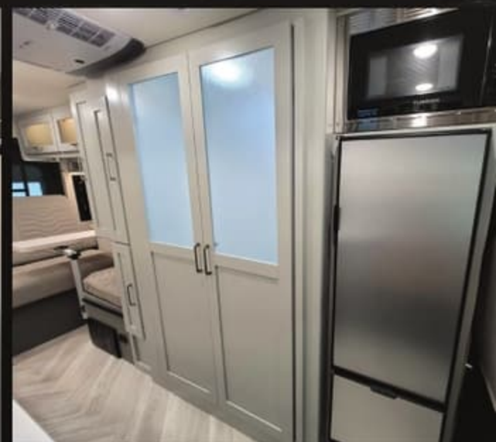
20C Floorplan shown with the New Modern Grey Cabinets