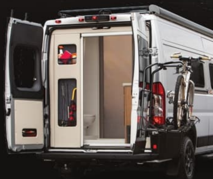
Easy to access rear bath and storage