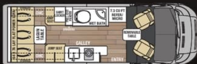
20C - Power Sofa with Double Captain's Chairs