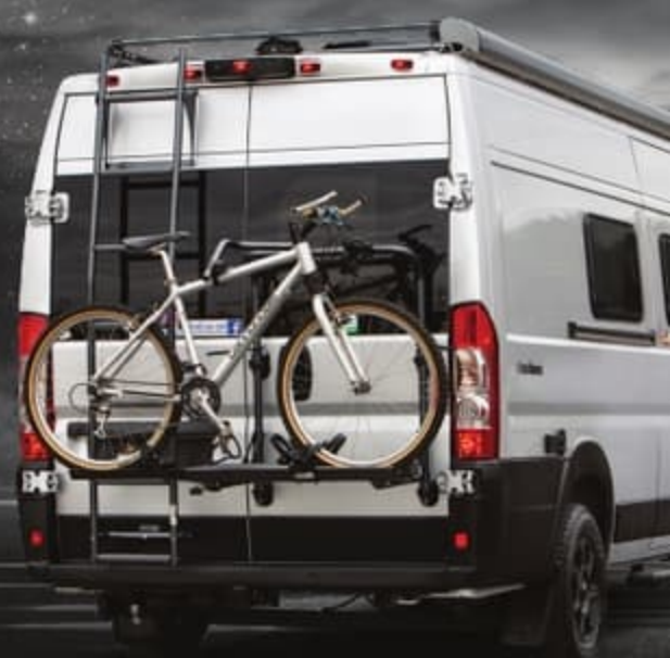
Optional bike rack