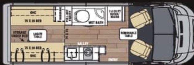
20D - Twin Beds with Double Captain's Chairs