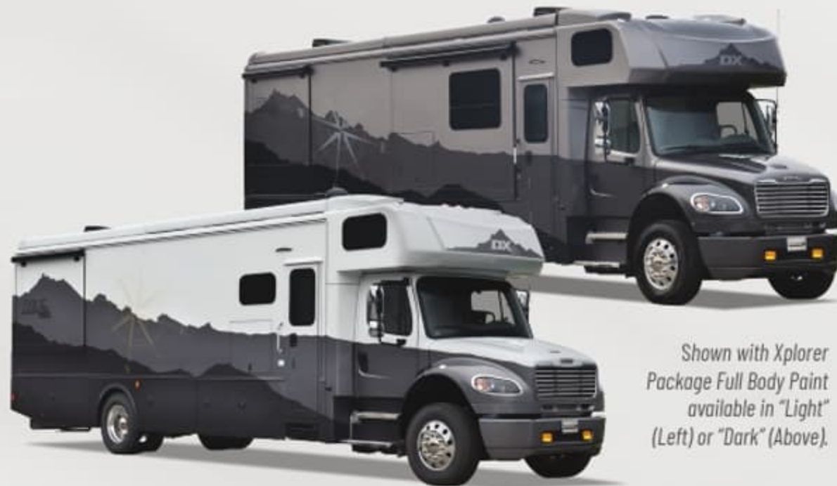
Shown with Xplorer Package Full Body Paint available in "Light" (Left) or "Dark" (Above).

Tested and developed for over a decade in the Canadian Rockies