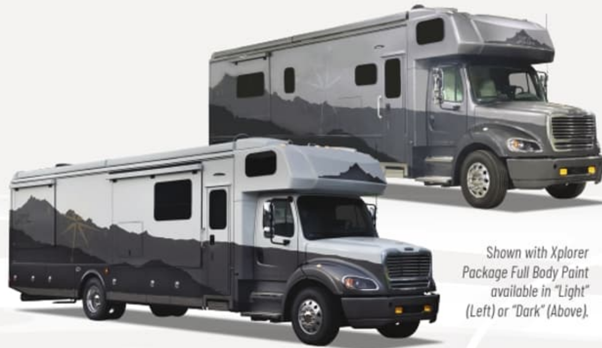
Shown with Xplorer Package Full Body Paint available in "Light" (Left) or "Dark" (Above).

Tested and developed for over a decade in the Canadian Rockies