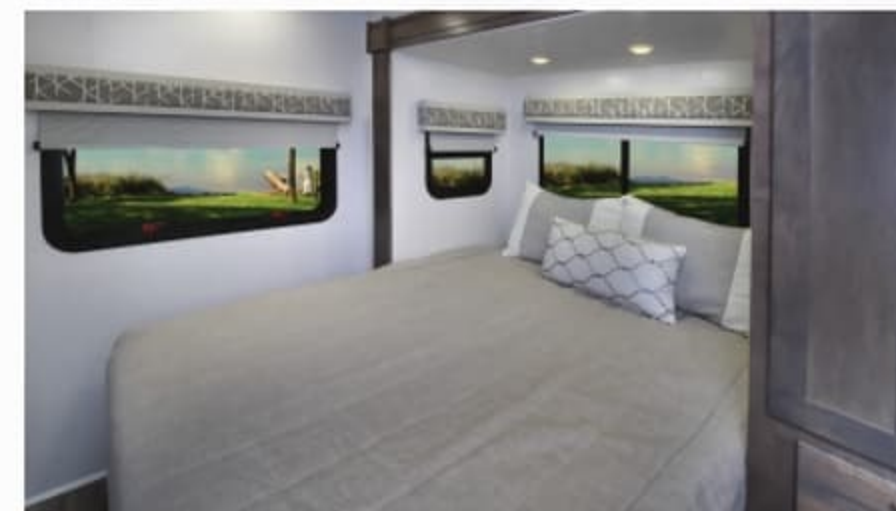
24FW shown with Driftwood II cabinetry and Milano décor.