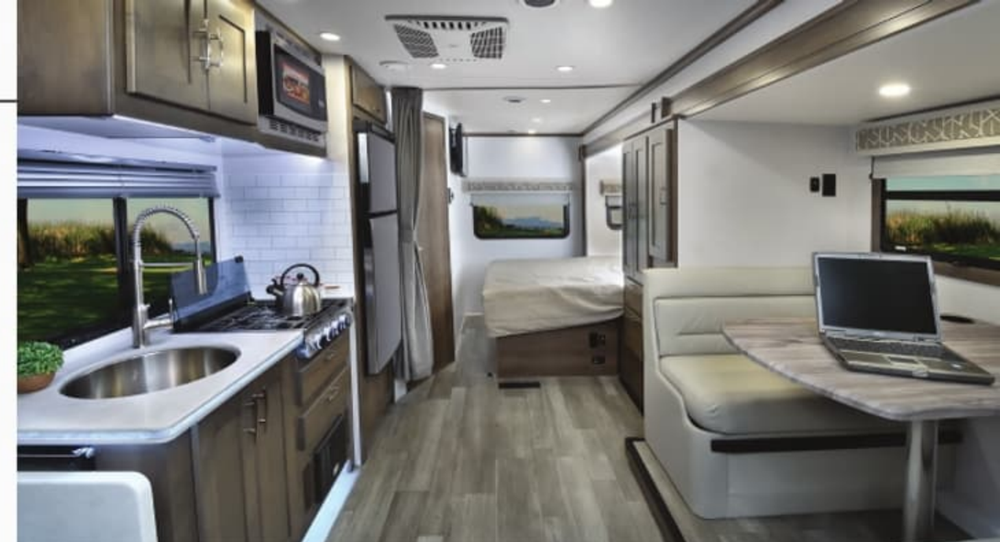
24FW shown with Driftwood II cabinetry and Milano décor.