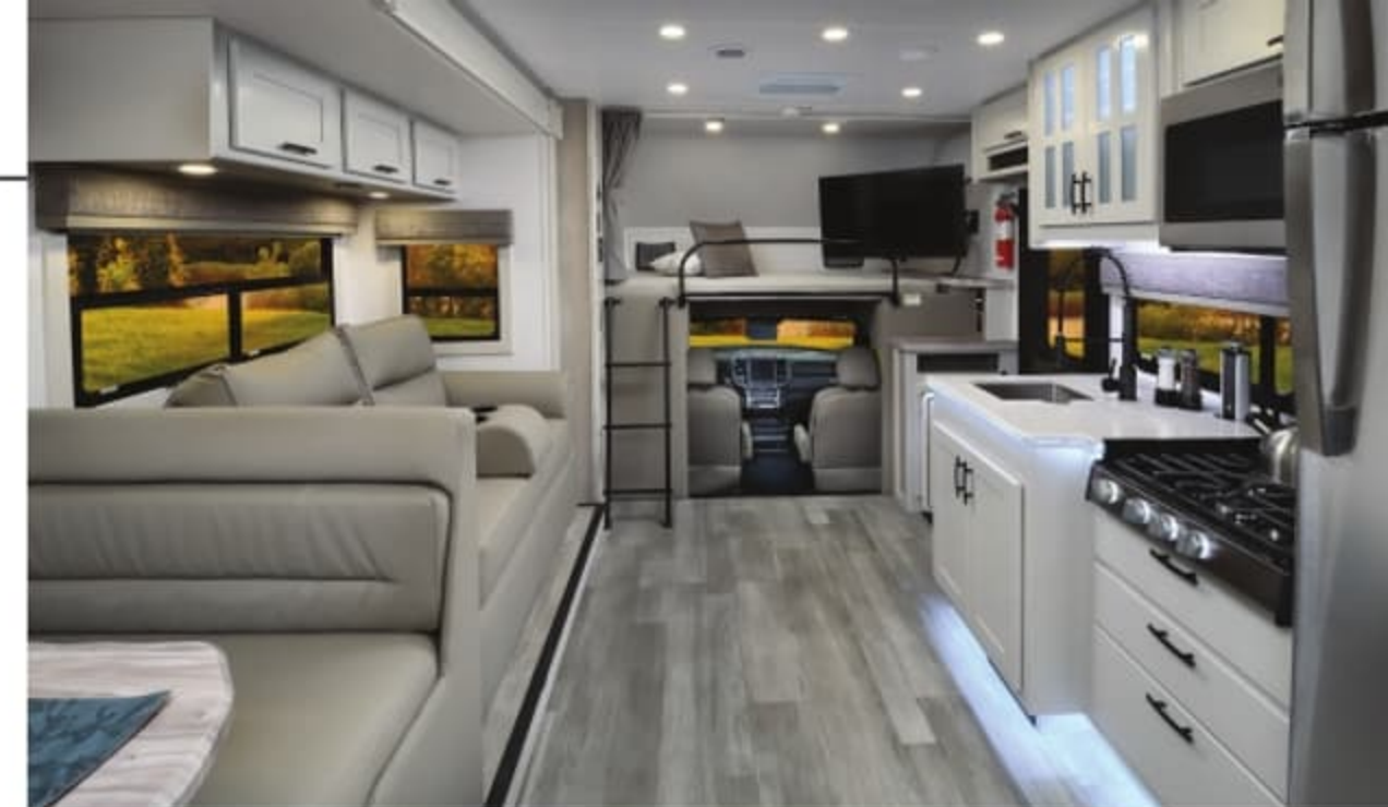
30FW with Gray Mist cabinetry and Milano décor