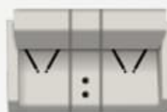
DUAL POWER THEATER SEATS IPO Dinette (28SS) IPO Sofa (30FW, 34DS)