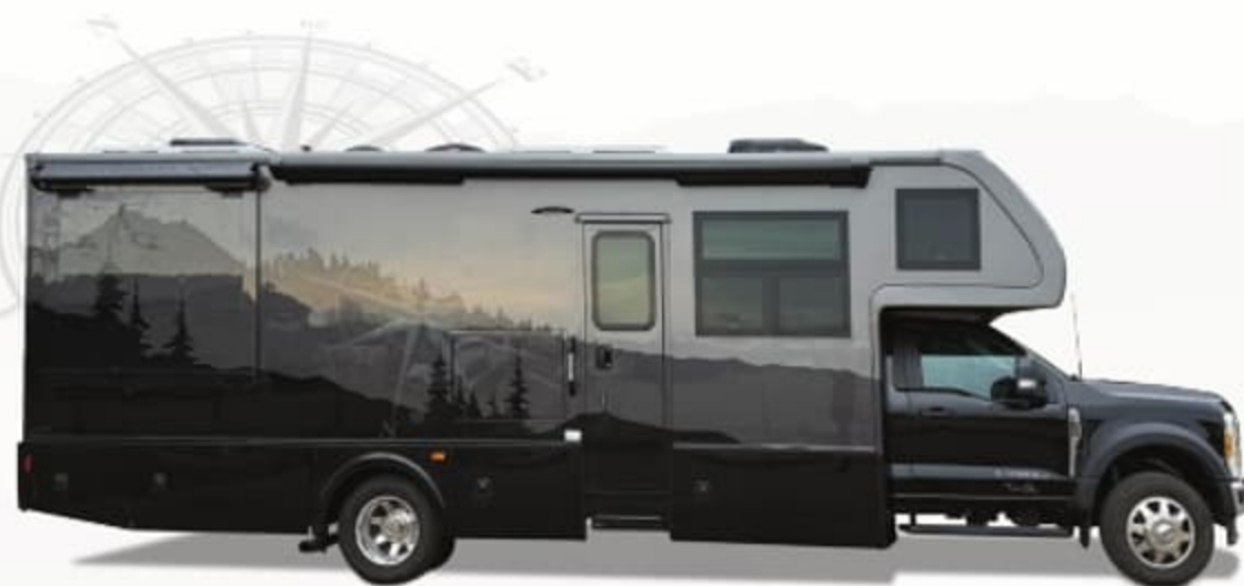
Shown in Xplorer Dark Full Body Paint. Additional Full Body Paint Options TBD.