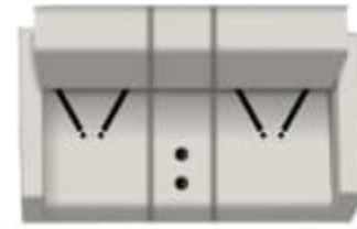
DUAL POWER THEATER SEATS IPO Sofa (30FW)