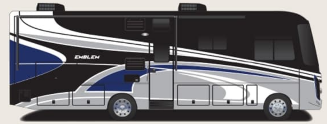
Coastal Full-Body Paint