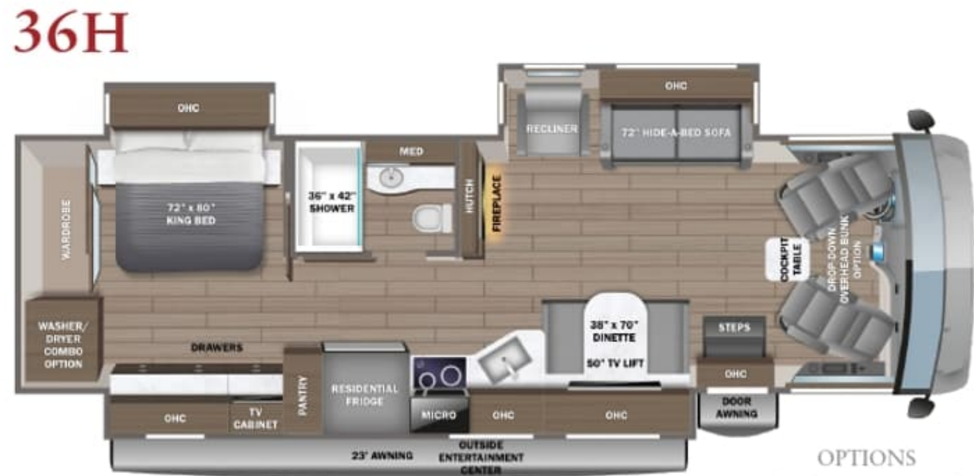
36H OPTIONS A, B AND D