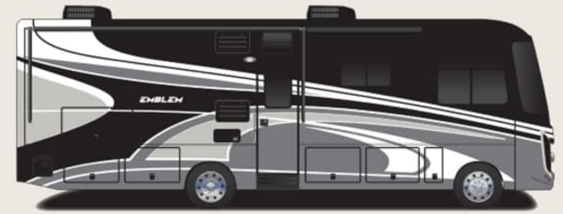
Appalachia Full-Body Paint