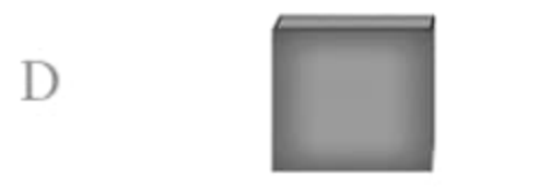
D 15 Cu. Ft. Fridge Option