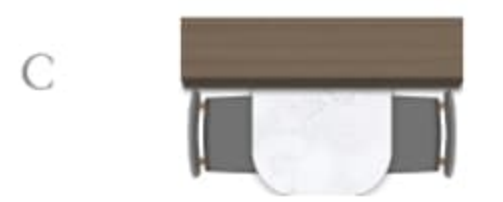
C Freestanding Dinette