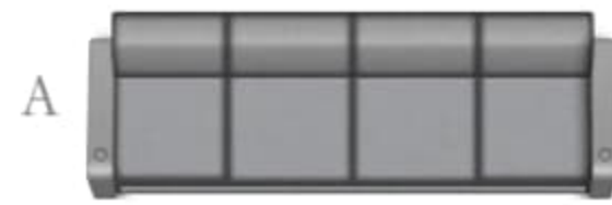
A 120-inch Reclining Sofa