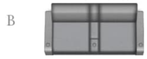
B 72-inch Theater Sofa