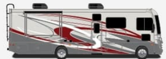
RUNWAY NEW EXTERIOR MY2025