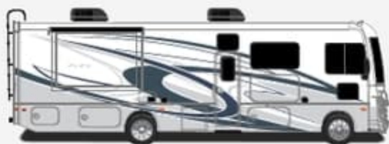
CASTAWAY NEW EXTERIOR MY2025