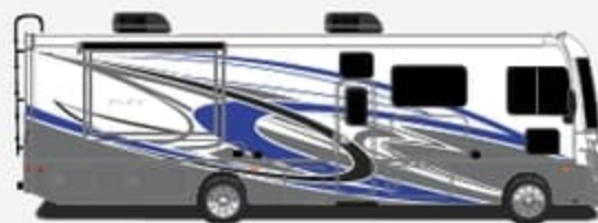
DIAMONDBACK NEW EXTERIOR MY2025