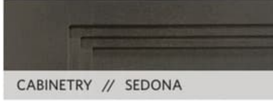
CABINERY // SEDONA