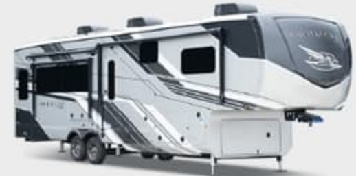
Silver Metallic Full-Body Paint