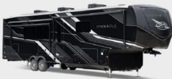
Midnight Charcoal Full-Body Paint