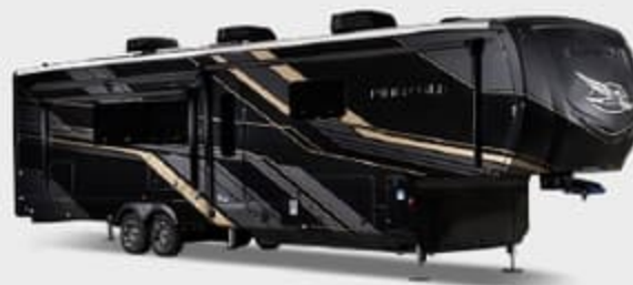
Midnight Gold Full-Body Paint