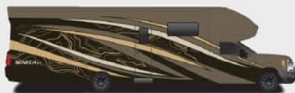
Scorched Full-Body Paint