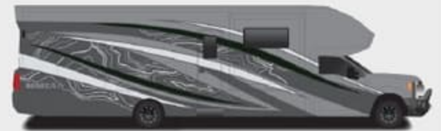
Mountain Meadow Full-Body Paint