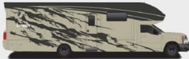
Desert Storm Full-Body Paint