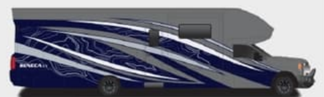
Summer Storm Full-Body Paint