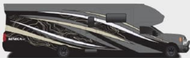
Sandatorm Full-Body Paint