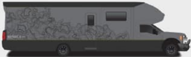
Backwoods Adventure Full-Body Paint