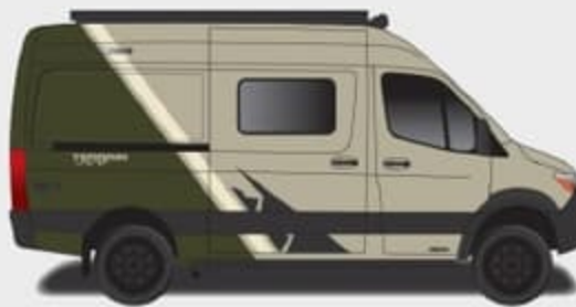
Optional Forest Glade Partial Paint (Sandstone Van Only)