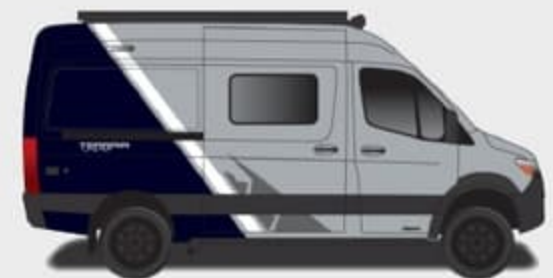
Optional Mystic Tide Partial Paint (Blue-Grey Van Only)