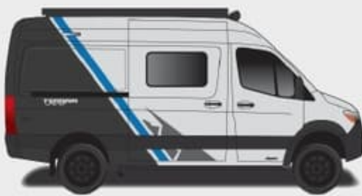
Optional Aztec Partial Paint (Silver Van Only)