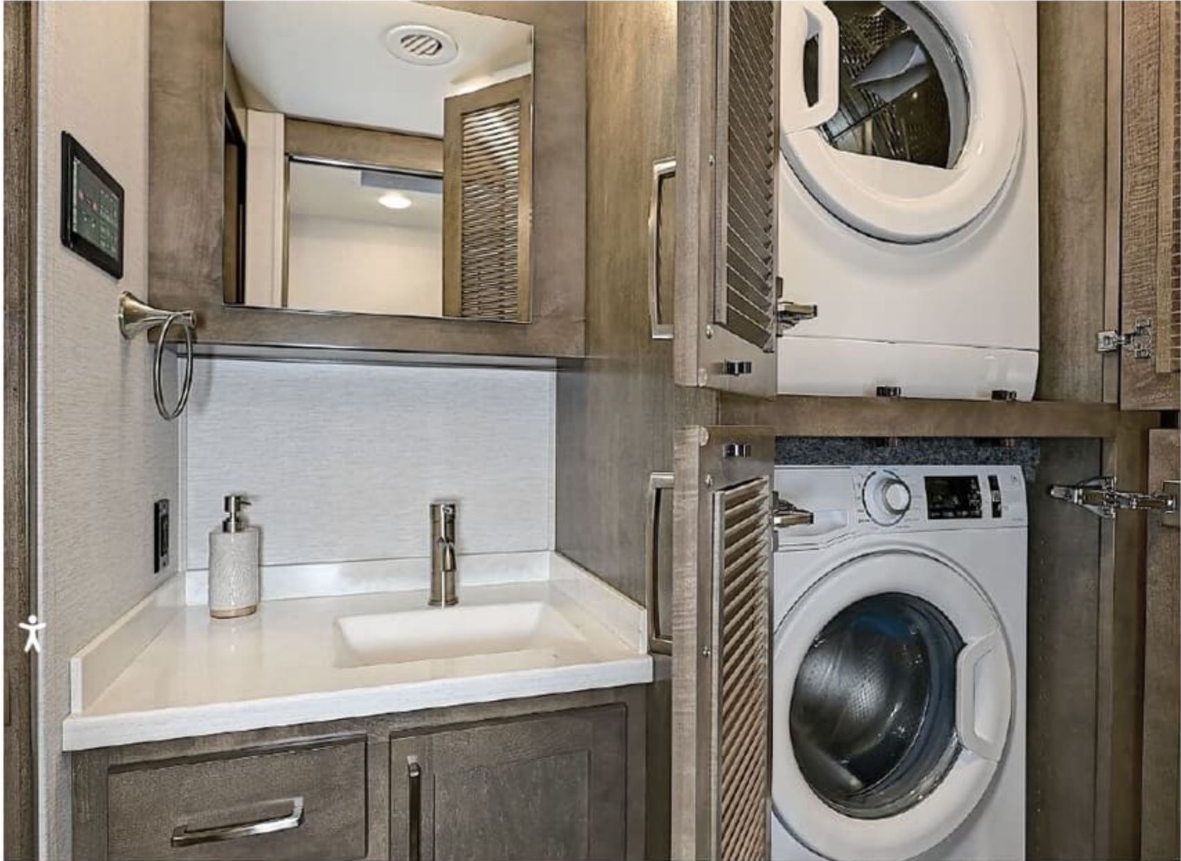
Lakewood Cabinetry // Augusta Interior Décor // The 2025 Valencia comes pre-wired and plumbed for an optional washer/dryer.