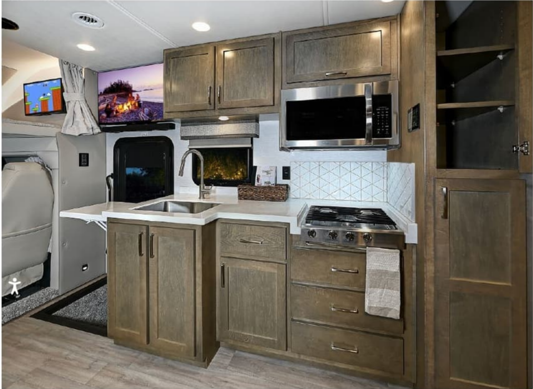
Lakewood Cabinetry // Augusta Interior Décor // The kitchen comes with a stainless steel 3-burner LP cooktop and a convection microwave oven.