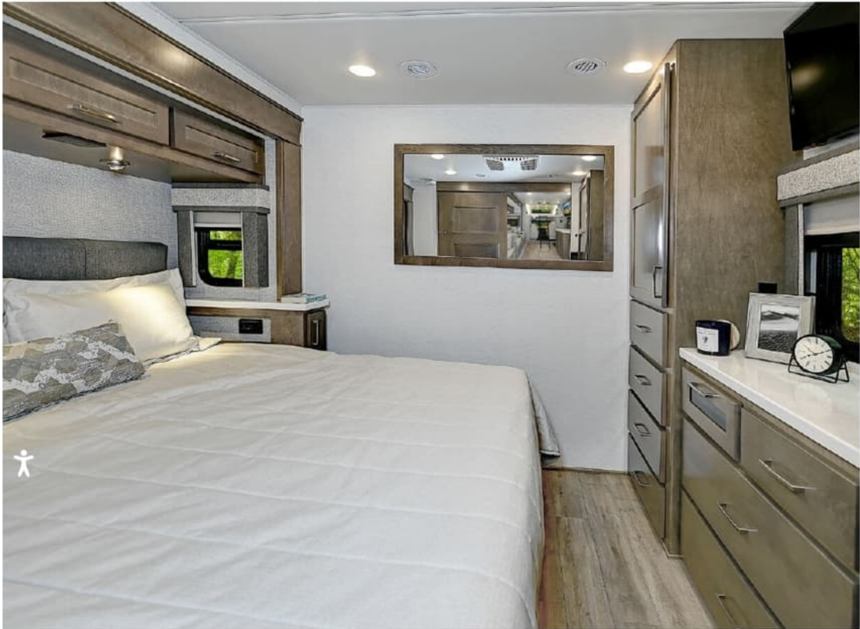
Lakewood Cabinetry // Augusta Interior Décor // The bedroom includes a comfortable memory foam mattress and lots of storage space.