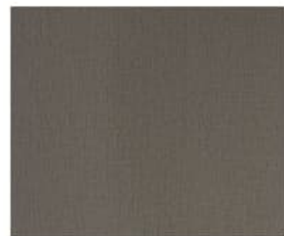
Valance Accent & Furniture