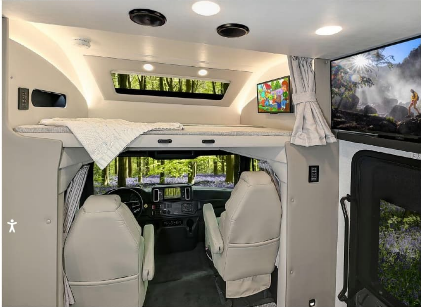
Lakewood Cabinetry // Augusta Interior Décor // The cab-over bunk area is decked out with a 24" Smart LED TV and USB/USB-C charging ports.