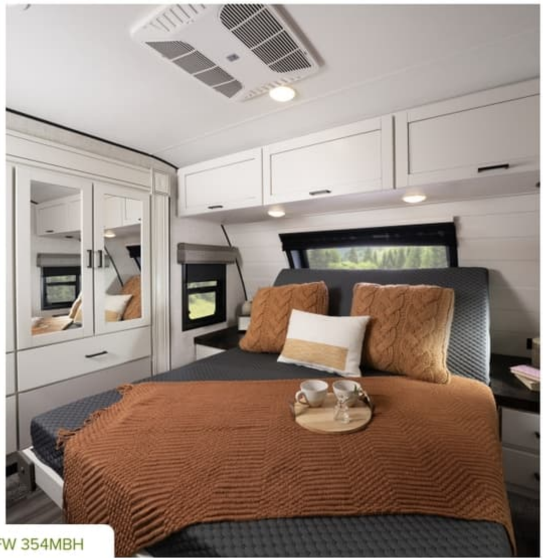
2025 GSL FW 354MBH