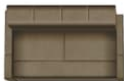
TRI-FOLD SOFA OPTION (BUNKROOM)