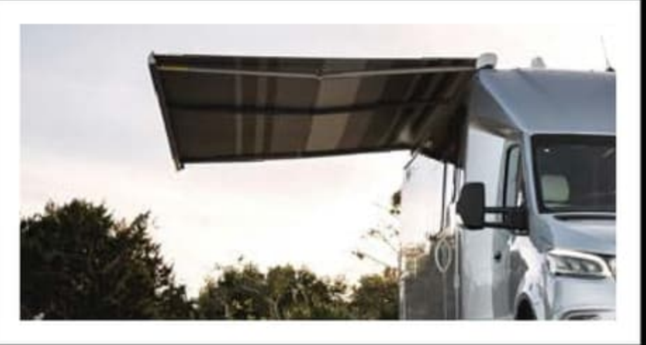
2 A powered, armless awning creates a wide exterior seating area.