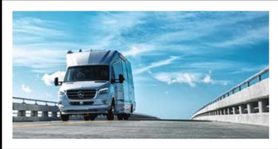
4 Air Ride Suspension delivers an exceptionally smooth ride with less road noise.