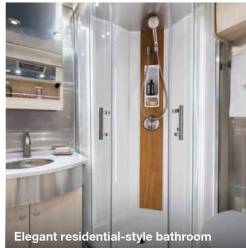
Elegant residential-style bathroom