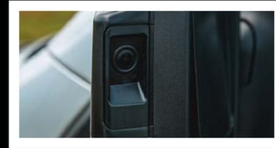
5 Safety sensors and cameras provide 360-degree awareness and peace of mind.