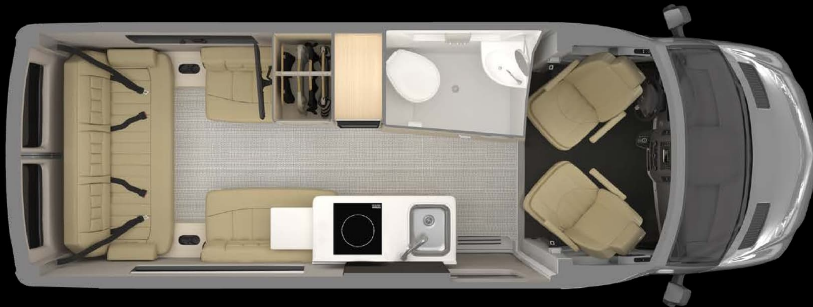
Classic Canyon Décor Shown