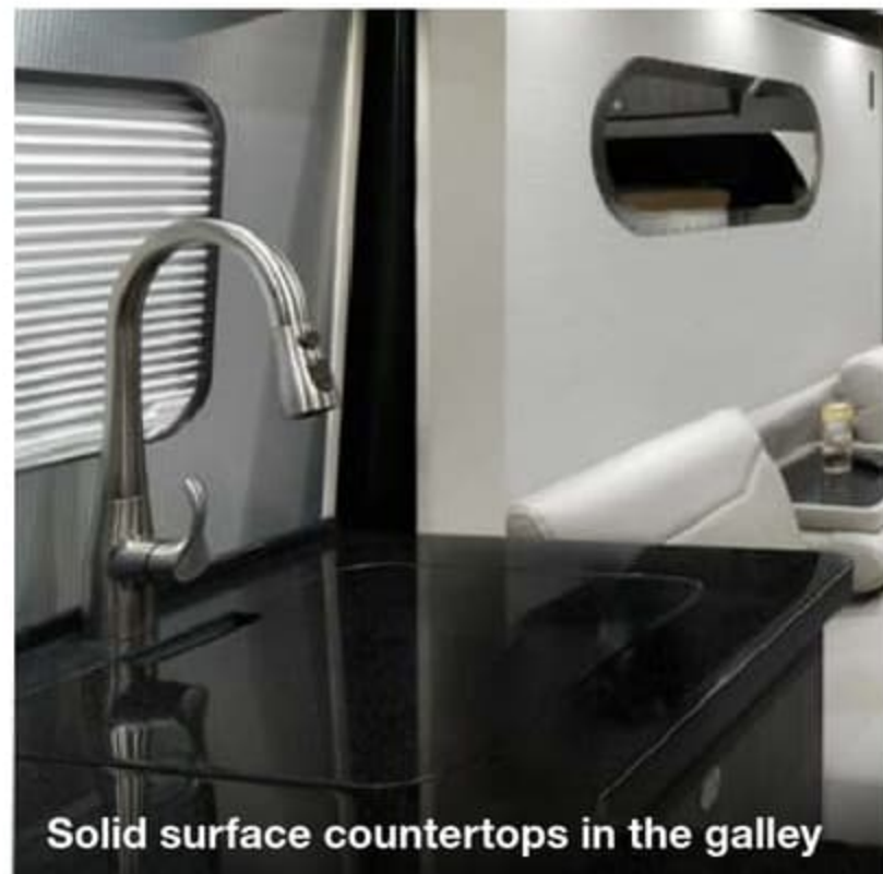
Solid surface countertops in the galley

On the road, the Atlas provides a driving experience par excellence. A 2.0L turbo charged high output 4-cylinder diesel engine delivers power and performance under the hood, and we select every available safety and comfort feature Mercedes-Benz offers. With the Advanced Power system, and up to 17.3kWh of usable power in the optional Advanced Power Plus, you have more power, simplicity, and off-grid capability.