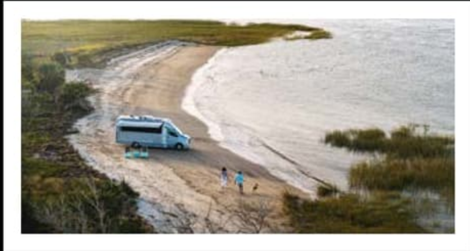
6 Upgrade to the Advanced Power Plus System for even more power and off-grid capability.