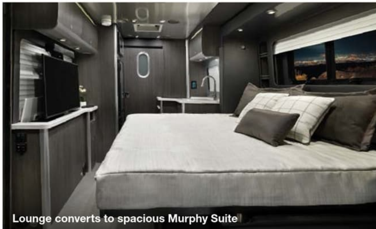
Lounge converts to spacious Murphy Suite