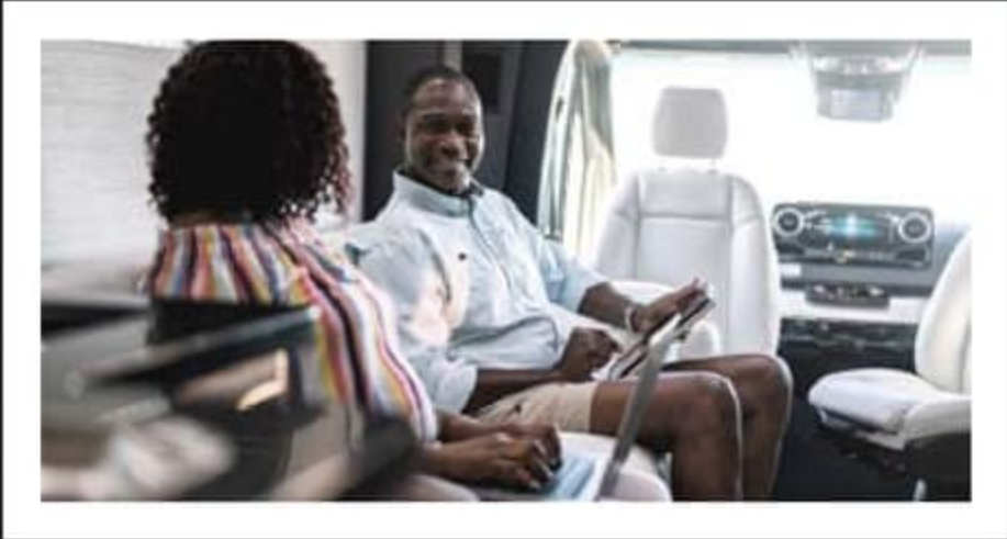
3 Stay connected with a Starlink High Performance In-Motion system that comes standard. *****