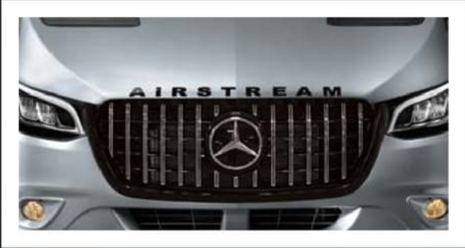
1 Refined new grille adds subtle sophistication to familiar Airstream styling.