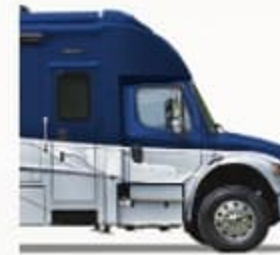
Aerodynamic Front Cap with Cab-Over Cabinets