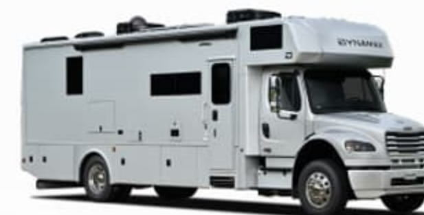
Platinum (Single Color Full Body Paint)