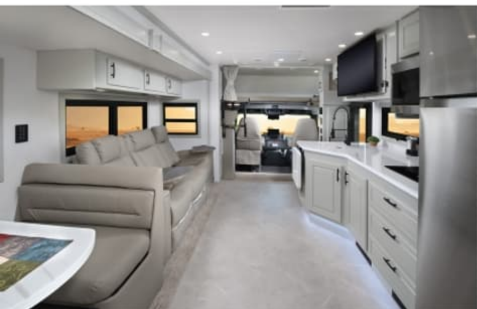
34KD shown with Mindful Gray cabinetry and Milano II décor.