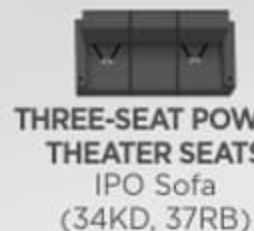
THREE-SEAT POWER THEATER SEATS IPO Sofa (34KD, 37RB)