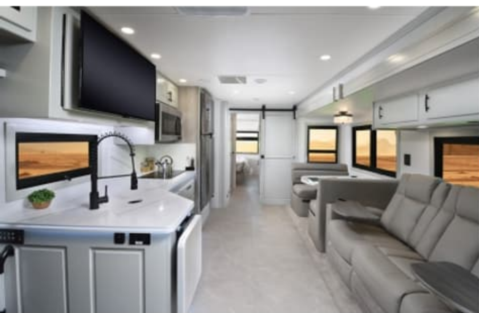
34KD shown with Mindful Gray cabinetry and Milano II décor.