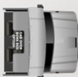
DUAL POWER THEATER SEATS IPO Sofa (32KD, 37BD, 37TS)